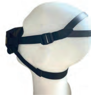
REPLACEMENT SMALL STRAP