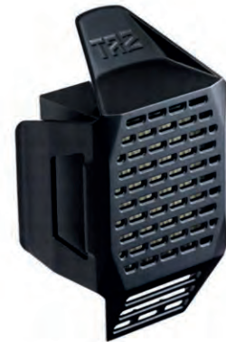
REPLACEMENT FRONT COVER