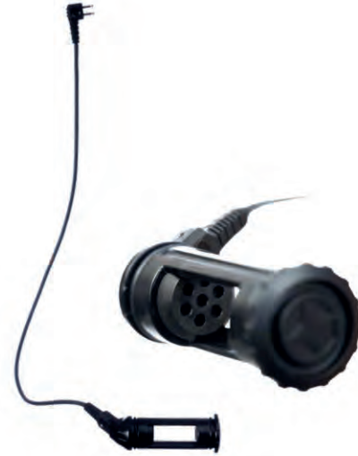
MIC & CABLE