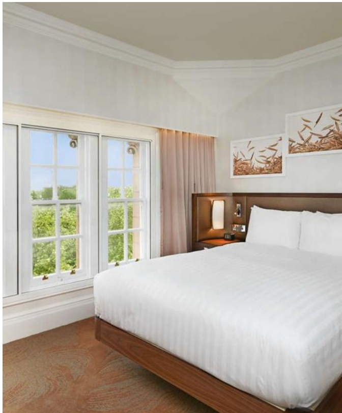
King Deluxe with Park View

Our rooms are designed with comfort and convenience in mind; The gentle colour schemes provide a calming and relaxing atmosphere. Explore the various types of rooms, browse the amenities, and choose the space that's right for you.