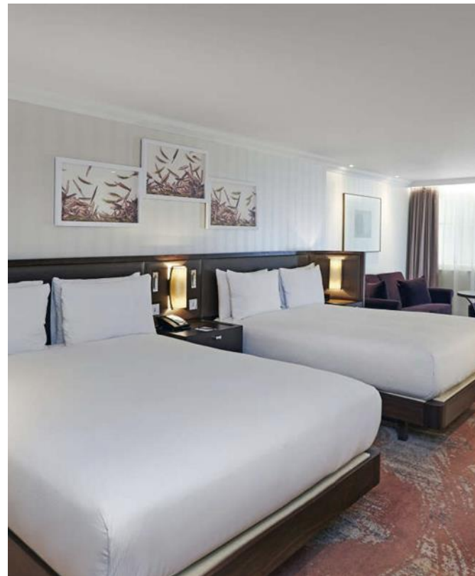
Grand Superior Room