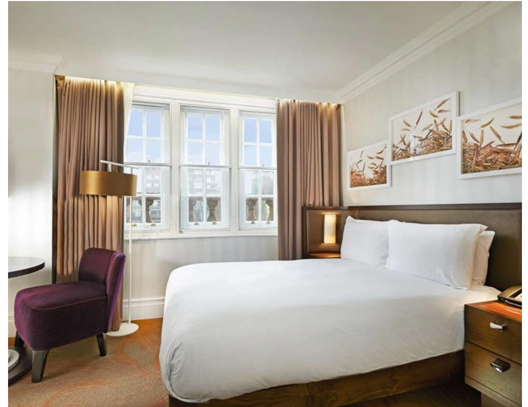
Queen Guest Room with Park View