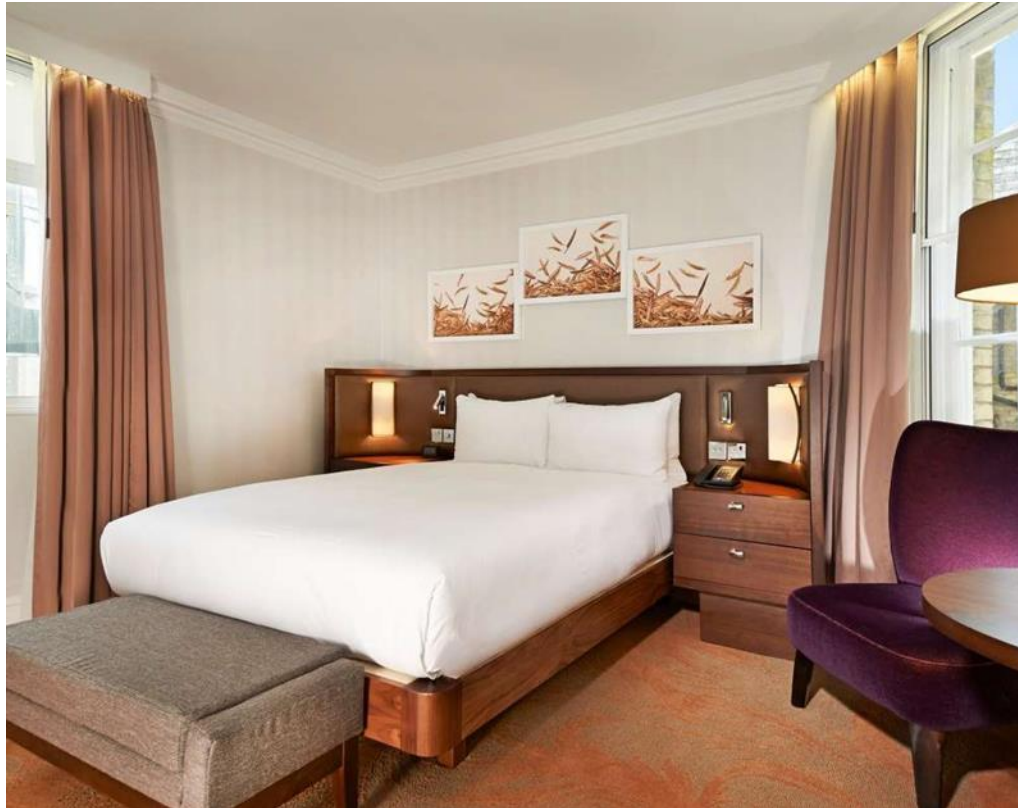
Double Guest Room

Our rooms are designed with comfort and convenience in mind; The gentle colour schemes provide a calming and relaxing atmosphere. Explore the various types of rooms, browse the amenities, and choose the space that's right for you.