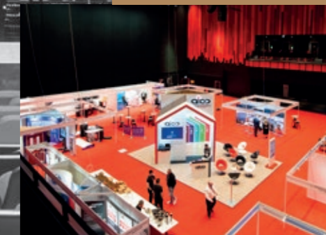
750 Seat conference theatre with 12m x 3.5m conference stage

OUR AUDITORIUM CAN BE DIVIDED IN HALF , creating a self-contained conference theatre, which can be used at the same time as our acoustically separated main floor.