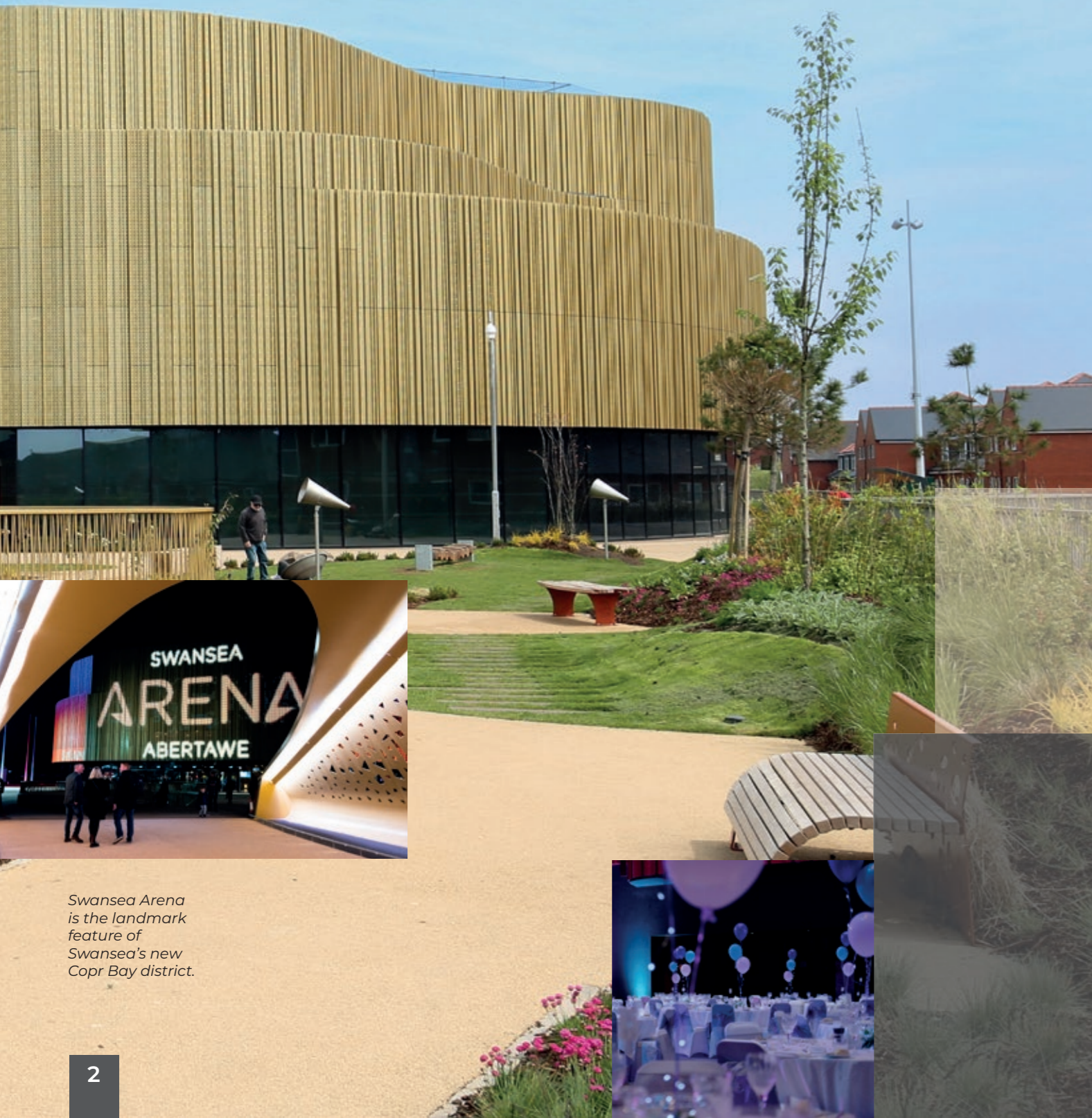
Swansea Arena is the landmark feature of Swansea's new Copr Bay district.

Set in the spectacular surroundings of the first inner-city park developed since the Victorian era, Swansea Arena offers spaces suitable for every event.