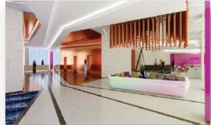
Check In Lobby