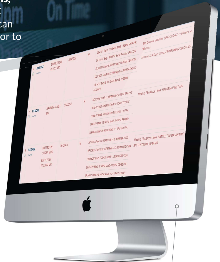
RIGHTQC displaying reporting dashboard. Actual dashboard layout may differ.