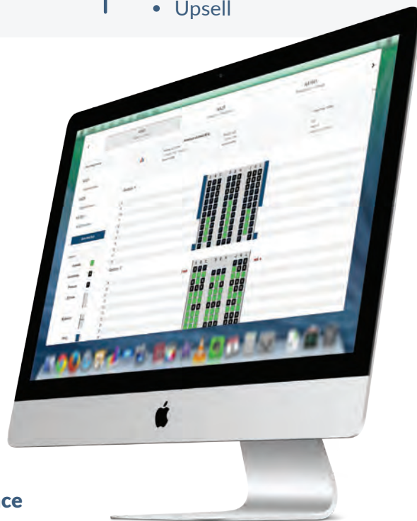
RIGHTFLIGHT displaying seat selection.