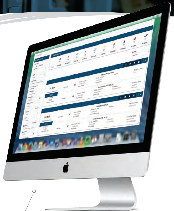
RIGHTFLIGHT displaying flight availability and shopping features.