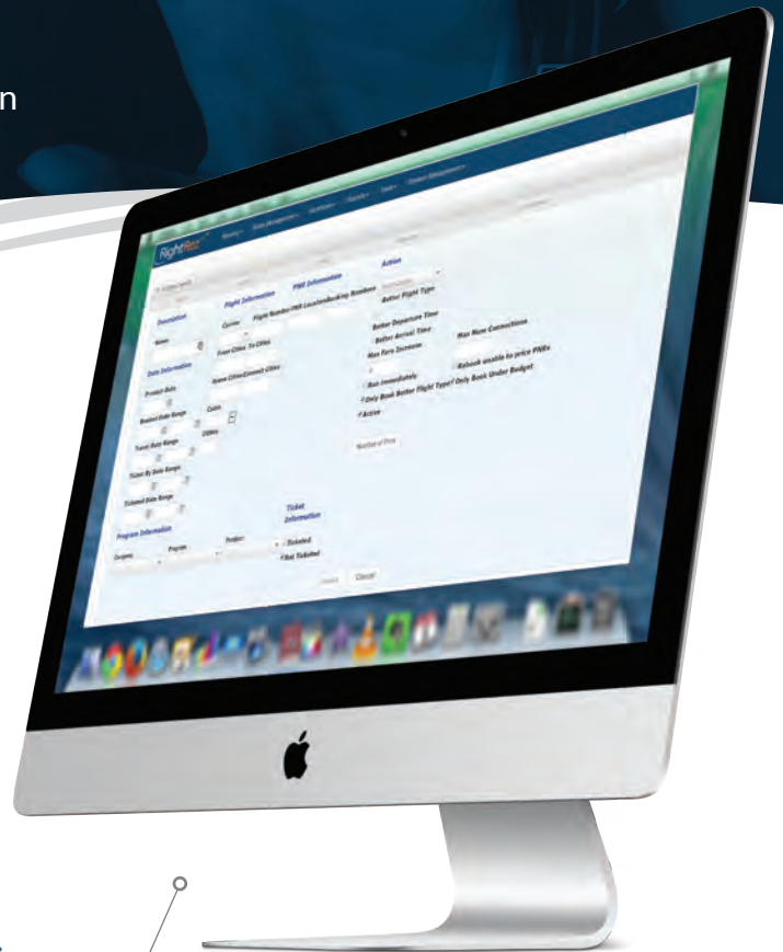
RIGHTRESHOP displaying record interface