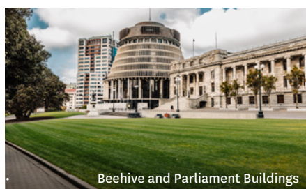
Beehive and Parliament Buildings