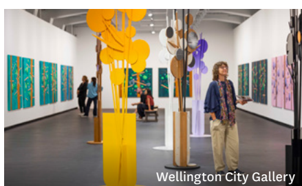
Wellington City Gallery