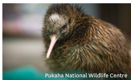
Pukaha National Wildlife Centre

JOURNEY along the Classic New Zealand Wine Trail. Wellington sits in the heart of the trail, a journey from Hawke's Bay to Wairarapa and across to Marlborough in the South Island - three regions that produce more than 80% of New Zealand's wine.