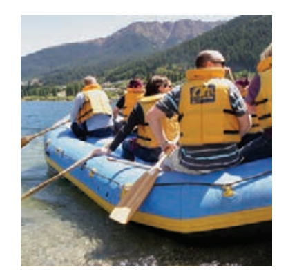
THE GREAT RACE