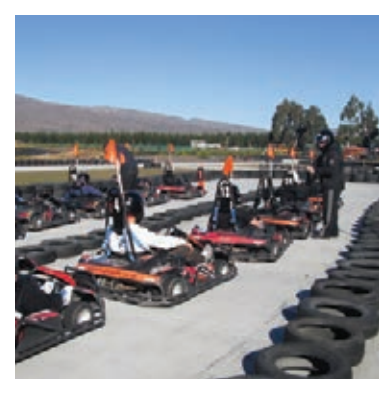
TOP GEAR CHALLENGE