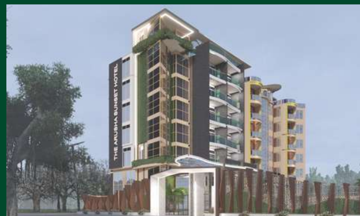
ARUSHA SUNSET HOTEL END OF 2025