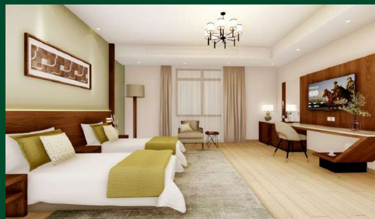
NGORONGORO SUNSET LODGE BEGINNING 2025