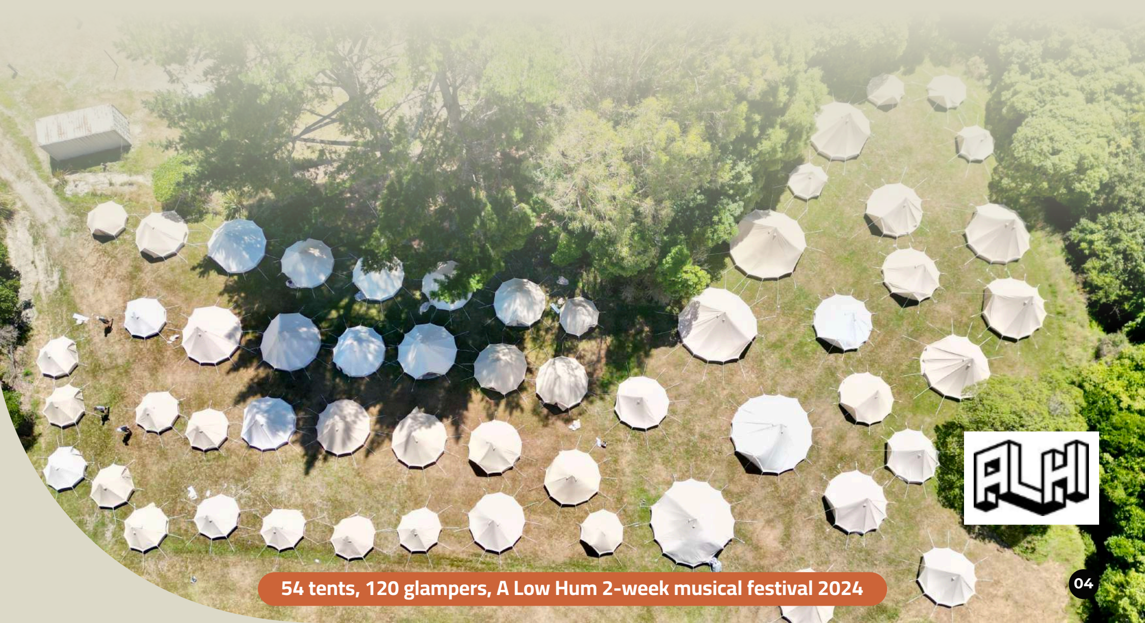
54 tents, 120 glampers, A Low Hum 2-week musical festival 2024

SNM services are based on the “just turn up” approach: delivered, set up, fully-furnished and packed down for you. A brought to you and done for you service.