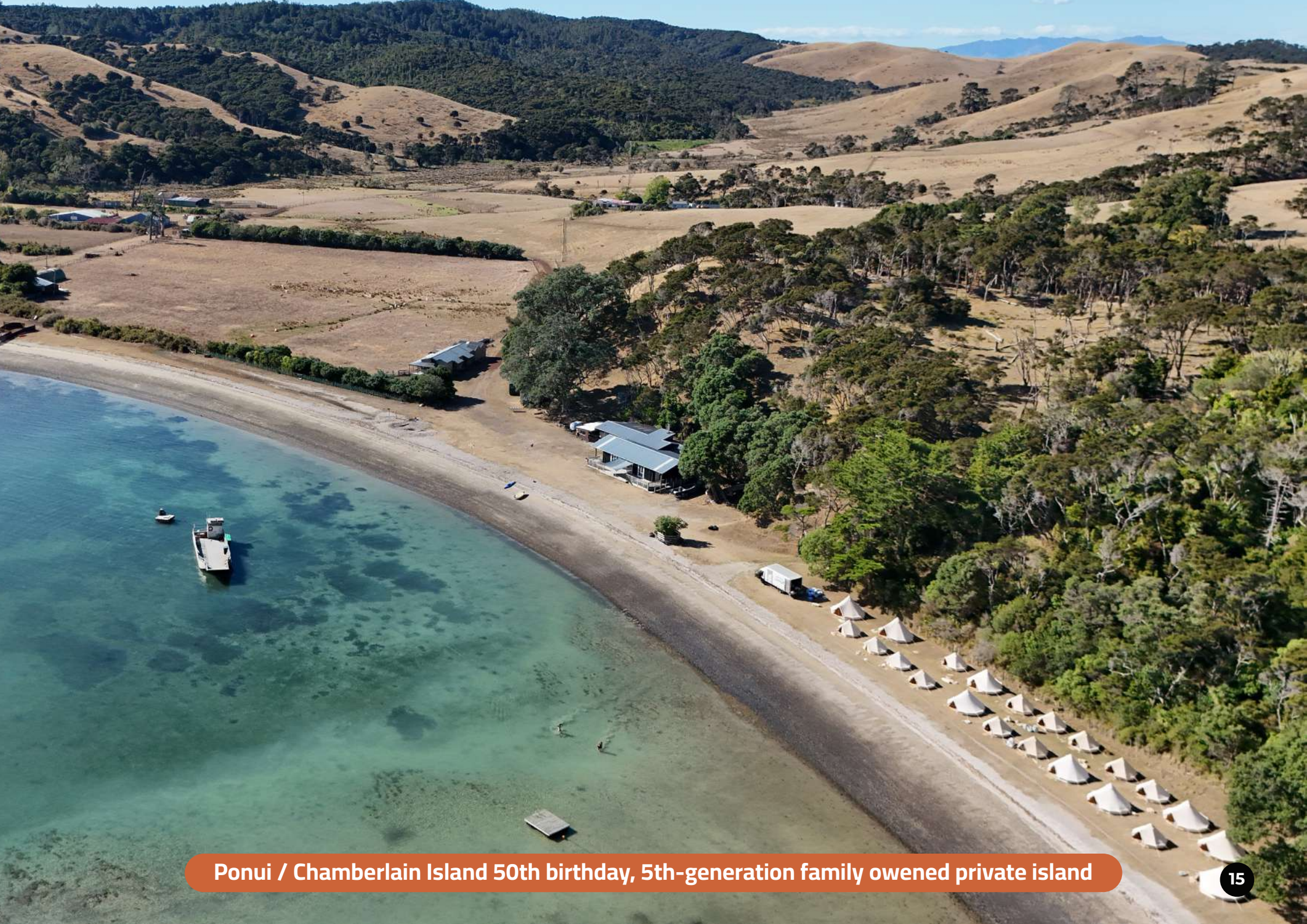
Ponui / Chamberlain Island 50th birthday, 5th-generation family owned private island