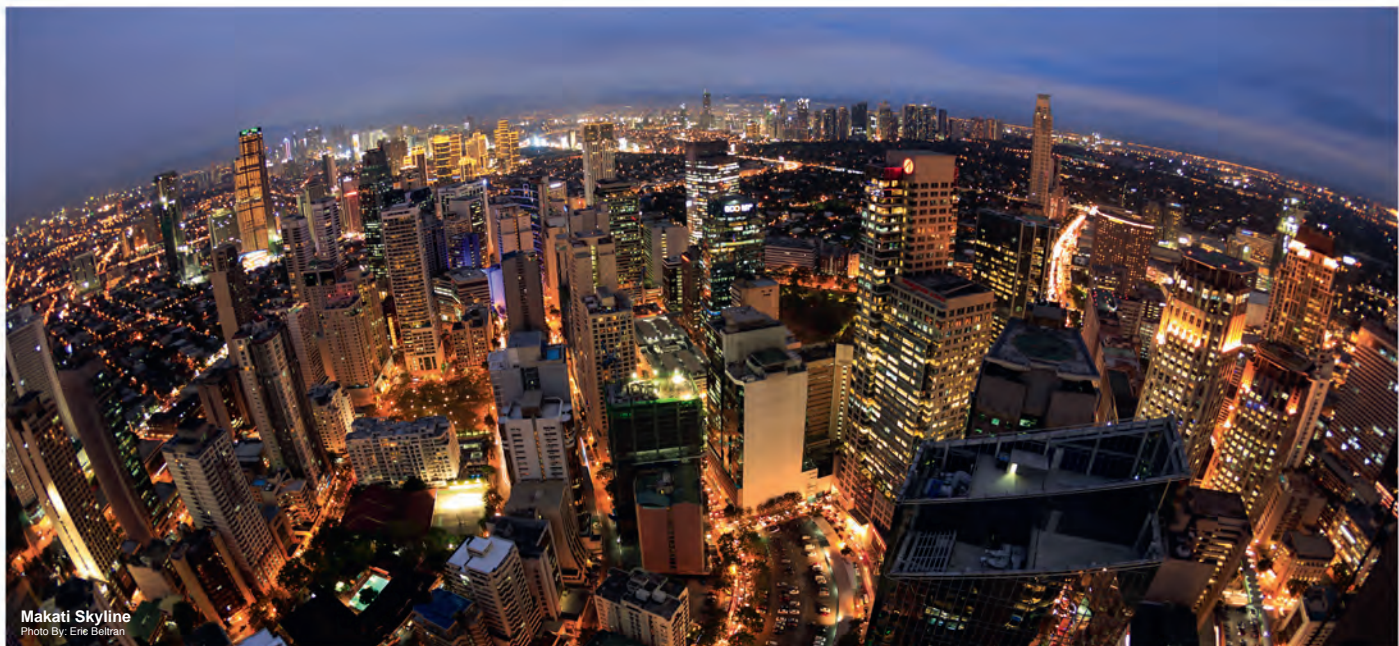
Makati Skyline

The Ninoy Aquino International Airport (NAIA) in Manila is the premier gateway. It is serviced by more than 30 local & international airlines, which fly to and from different cities around the world.