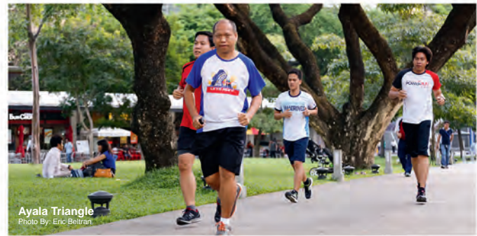
Ayala Triangle

Home to some 12 million people, Manila has history, style and charm. It boasts a wide range of sightseeing possibilities offers cosmopolitan cuisine and superb entertainment. In this city that never sleeps, there is a good night out for everyone.