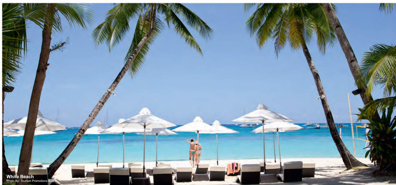
White Beach

Kalibo international Airport or Caticlan is an hour and fifteen minutes flight from Manila. From Kalibo, Boracay is 90 minutes away by bus and a short boat trip; from Caticlan it is 20 minutes by boat.