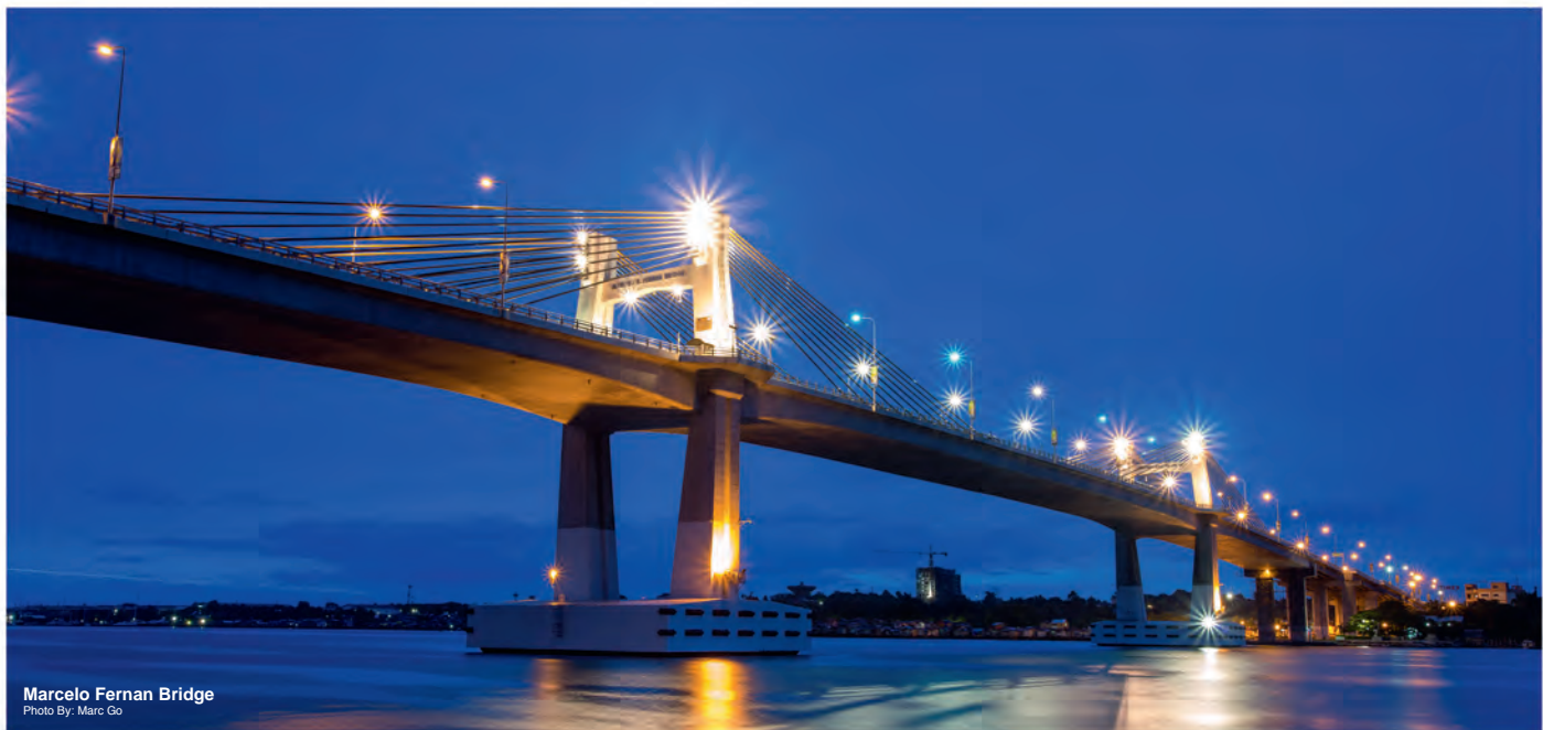
Marcelo Fernan Bridge

The Mactan - Cebu international airport services daily flights from Asia's key cities. It is an hour's flight from Manila and easily accessible from domestic destinations by land, air and sea.