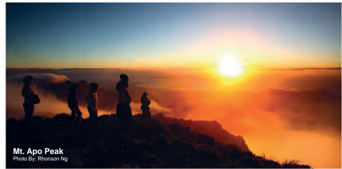
Mt. Apo Peak

Just as enchanting is its community, a harmonious tapestry woven from the diverse cultural threads of its people. In Davao, the contemporary fuses with the traditional as migrant settlers from all over the country co-exist peacefully with numerous ethnic tribes who continue to live as they did centuries ago.