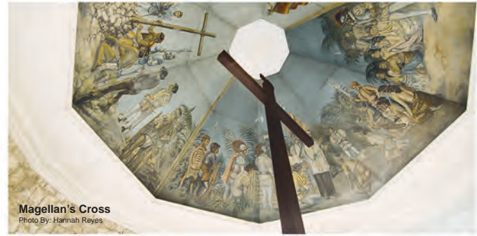
Magellan's Cross

In contrast to its bustling metropolis and glittering nightlife, the rest of Cebu's 167 islands and islets are lined with serene white sand beaches where one can stare blithely out to sea for hours. Cebu is famous worldwide for its diving grounds, rich in spectacular coral beds and sea life. But for those seeking high adventure, the Crown Regency Hotel & Towers boasts a coaster ride that takes thrill seekers more than 38 stories sky high for a breathtaking view of Cebu City.