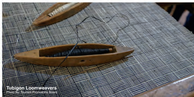
Tubigon Loomweavers