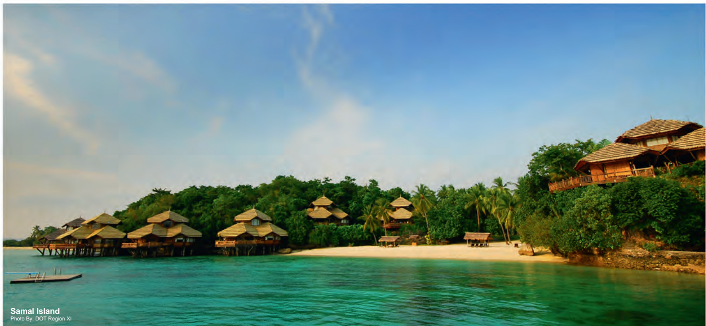
Samal Island

Domestic carriers run regular daily flights from Manila to Davao's Francisco Bangoy International Airport (one hour and 45 minutes).