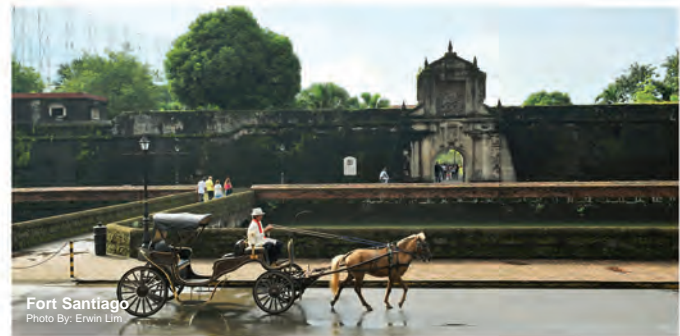
Fort Santiago