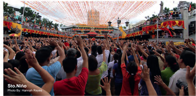
Sto. Niño