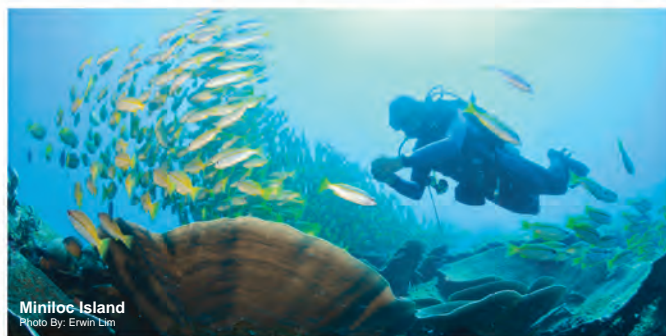
Minifoc Island