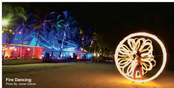
Fire Dancing

But there is plenty to do other than soaking up the sun on the beach or attending sunset parties. Diversions include windsurfing, sail boating and kayaking. There are 20 dive sites at last count. Horseback riding, trekking and mountain biking are great ways to enjoy scenic rocky cliffs, discover hidden beaches and stumble upon quaint villages.