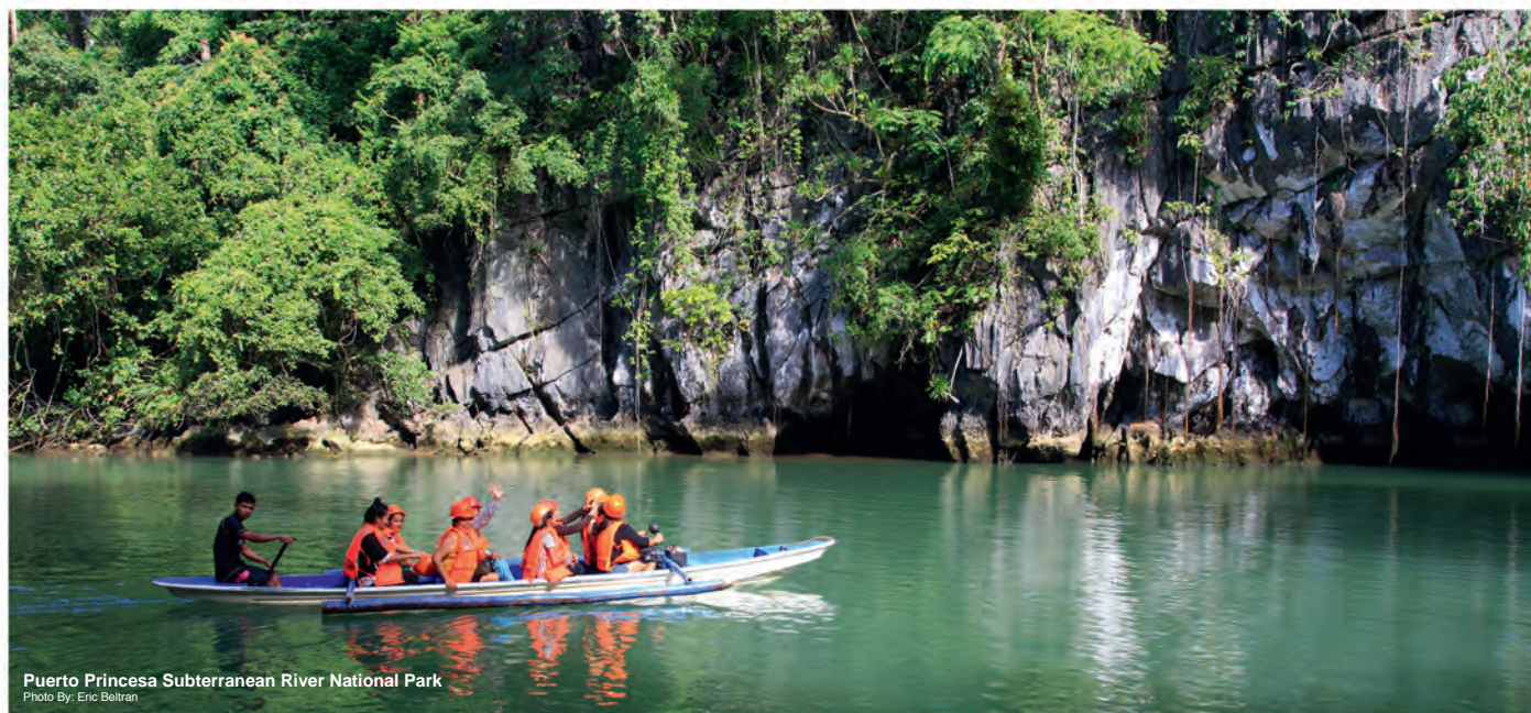
Puerto Princesa Subterranean River National Park

Puerto Princesa international airport is served by all domestic airlines, and is just a few minutes from the city. There are daily flights from Manila.