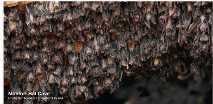
Monfort Bat Cave