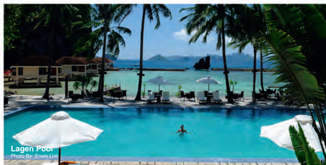
Lagen Pool

Palawan's bewitching landscapes include storied lagoons and bays hiding ancient shipwrecks, uncharted mountains, mangrove swamps, hidden pockets of lush forest and deserted islets ringed by kaleidoscopic sea gardens as well as white sand beaches. Palawan is a wildlife haven, where giraffes, zebras and gazelles co-exist with exotic fauna such as the mouse-deer, civet and scaly anteater.