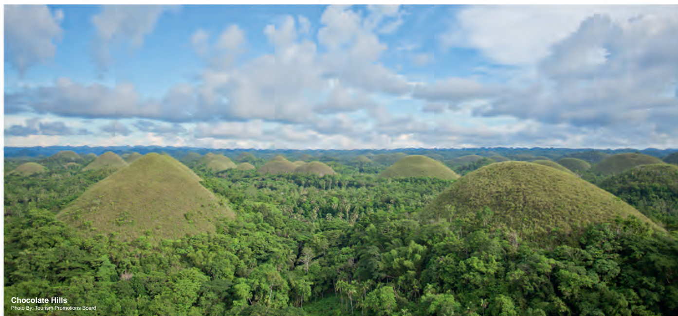
Chocolate Hills

Flights to and from Tagbilaran to Manila take around one hour and 15 minutes. Domestic and budget carriers have daily flights. Fast ferries operate between Bohol and Cebu regularly.