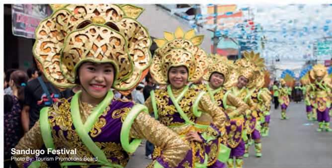
Sandugo Festival

Bohol is also a historical and cultural destination. Its 16th century watchtowers and ancient coral-stone churches with gilded altars and priceless icons are amazing attractions. One hidden gem is the centuries-old Spanish Pamilacan Island, an eco-tourism destination that's gaining a reputation for its dolphin and whale-watching tours and superb diving sites.