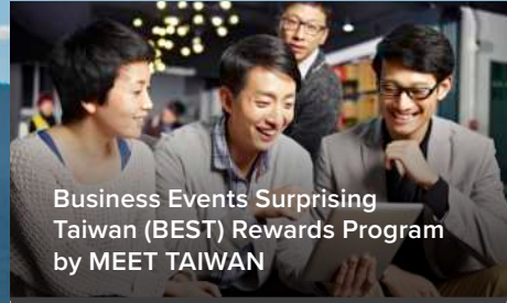
Business Events Surprising Taiwan (BEST) Rewards Program by MEET TAIWAN