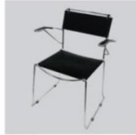
C105 Leather Arm Chair