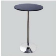
T201 Bistro Table 600DIA x 1000H ■ □