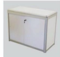
S02 Lockable Cabinet 1000L x 500W x 750H