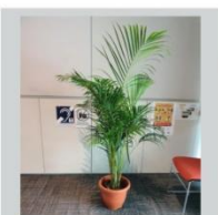
P03 Potted Palm without White Pot 3ft - 4ft Height