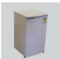
M02 Medium Fridge 470L x 470W x 800H