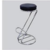
C201 Round Barstool