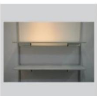
M100 SystemShelf(Flat) 1000Lx300W