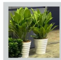
P01 Potted Plant with White Pot 2ft - 3ft Height