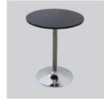
T101 Round Table with Metallic Round Base 600DIA x 750H ■ □