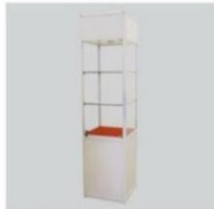
S08 Square Showcase 500L x 500W x 2000H