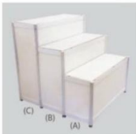
S11 3-Tier Display Counter (A)1000L x 310W x 500H (B)1000L x 310W x 750H (C)1000L x 310W x 1000H