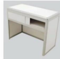
S01 Reception Desk 1000L x 500W x 750H