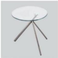
T301 Round Glass Coffee Table (3 legged) 500DIA x 520H