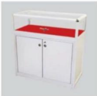
S07 Low Showcase with LED Light 1000L x 500W x 1000H