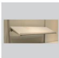
M100 SystemShelf(Slope) 1000Lx300W