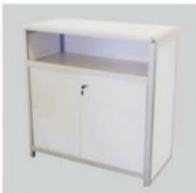
S04 High Lockable Cabinet 1000L x 500W x 1000H