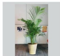
P02 Potted Palm with White Pot 3ft - 4ft Height