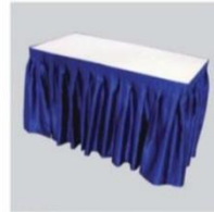
T107A Table Skirting 4ft x 2ft x 770H