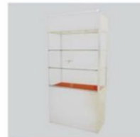
S09 High Showcase 1000L x 500W x 2000H