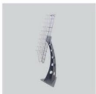
D03 Metal Brochure Rack 430L x 430W x 1090H