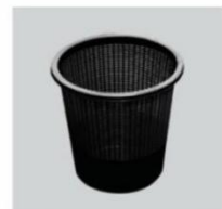
M07 Waste Paper Basket