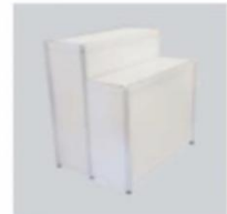
S10 2-Tier Display Counter 1000L x 310W x 750H 1000L x 310W x 1000H