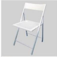
C101B Folding Chair ■ □