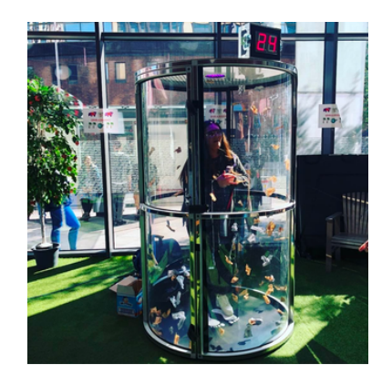
Cash Grabber Game from £495