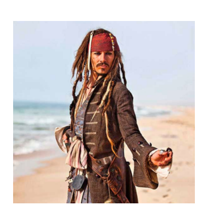
Captain Jack Sparrow Lookalike from £530