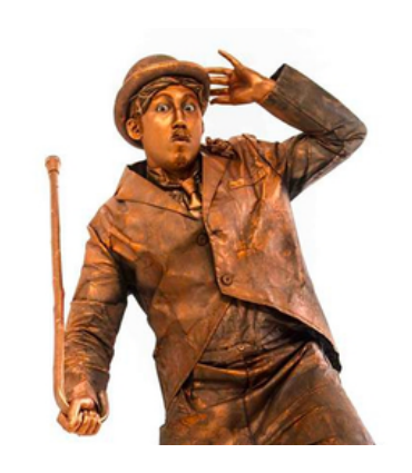
Living Statues from £375