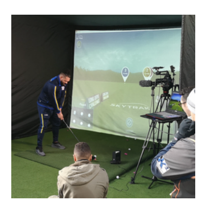
Golf Simulators from £1,699