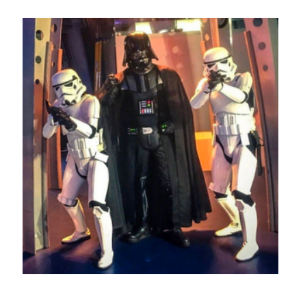
Screen Icons from £500