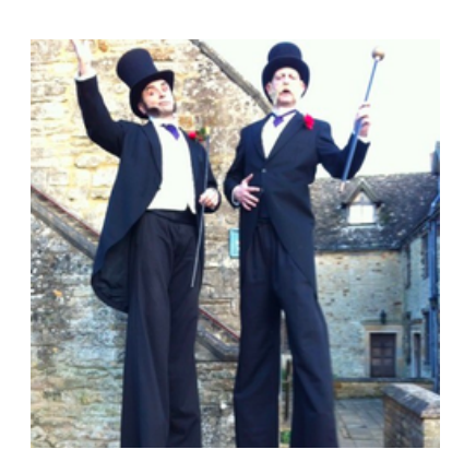
Stilt Walkers from £390