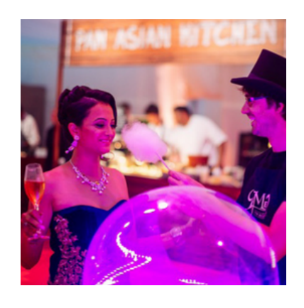
60mph Fairy Floss Whizzer from £1,350