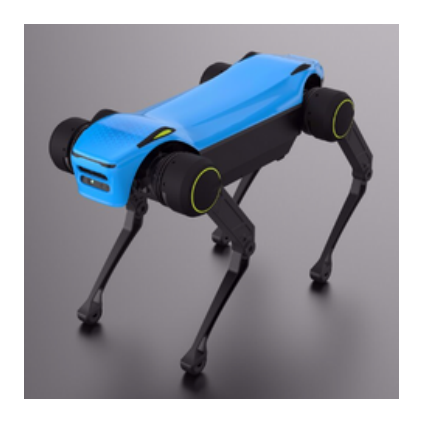
Robots from £600