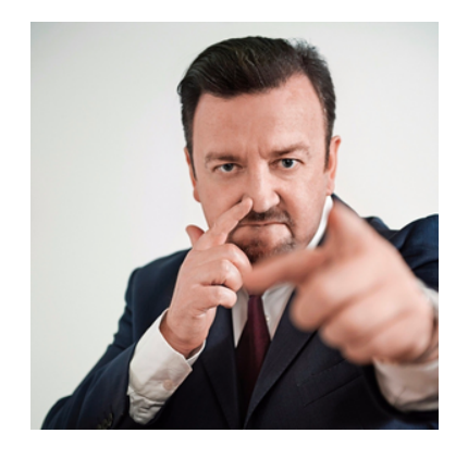
David Brent lookalike £550 for 2 hours and £100 an hour thereafter