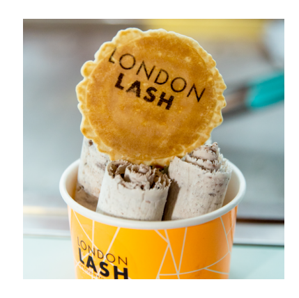
Roll Me Up Ice Cream from £2997