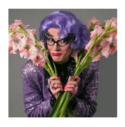
The Untamed Edna Experience from £645