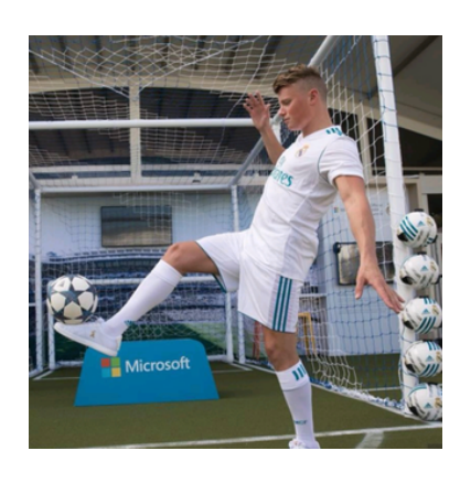
Football Freestylers from £600