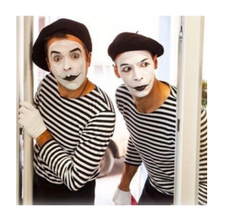
Mime Artists from £450