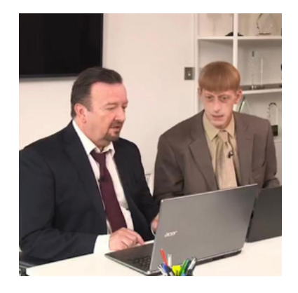
Gareth lookalike included £500 for 2 hours and £100 an hour thereafter