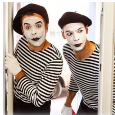
Mime Artists from £450