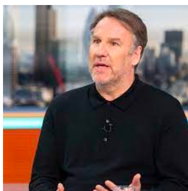
Paul Merson from £3,500