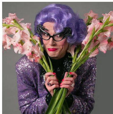
The Untamed Edna Experience from £645