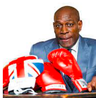
Frank Bruno from £4,850