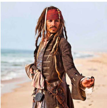
Captain Jack Sparrow Lookalike from £530