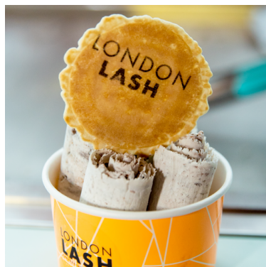
Roll Me Up Ice Cream from £2997