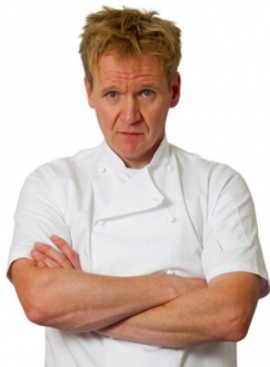
Gordon Ramsay Lookalike from £600