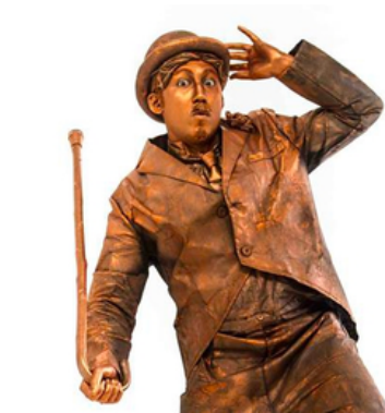
Living Statues from £375