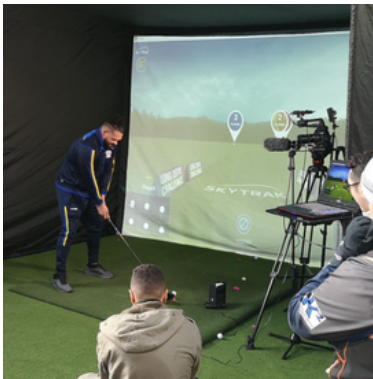
Golf Simulators from £1,699