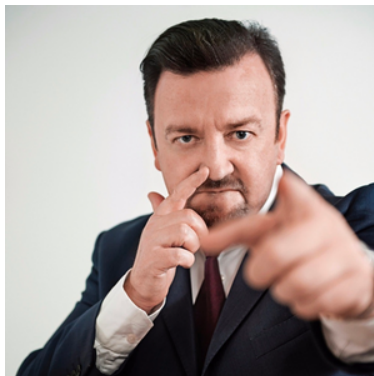
David Brent lookalike £550 for 2 hours and £100 an hour thereafter