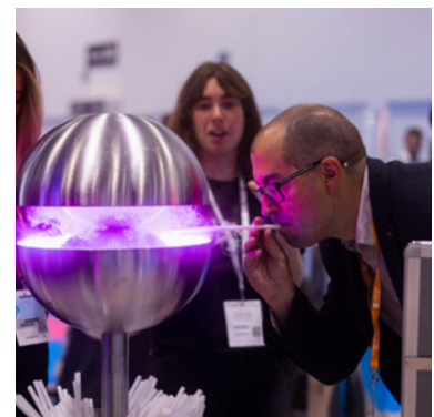
Edible Bubbles & Mist Experience from £1,785