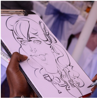
Caricaturists from £250