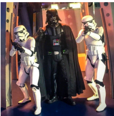
Screen Icons from £500