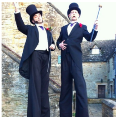
Stilt Walkers from £390