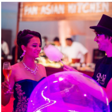
60mph Fairy Floss Whizzer from £1,350