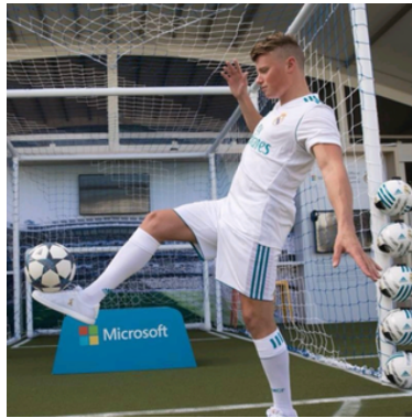
Football Freestylers from £600