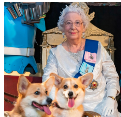
Queen Elizabeth Lookalike from £525