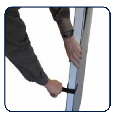
This will hold the Door Defense in place for the duration of your project.