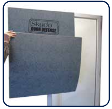
Carefully slide the middle of the Door Defense over the top of the door. Continue holding onto the side panels.