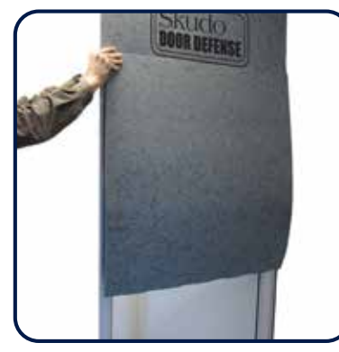
Once the Door Defense has been placed securely over the top of the door, let go of the side panels, allowing them to cover the length of the door surface.