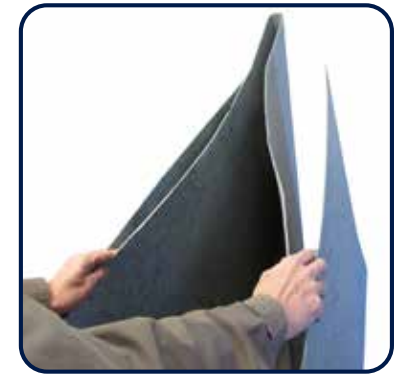
Open the middle section slightly while holding the outside panels together.