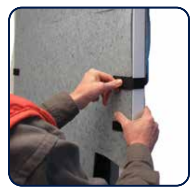
Attach and secure the Velcro straps provided around both sides of the door.