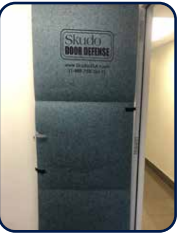
Fits Standard-Sized Doors