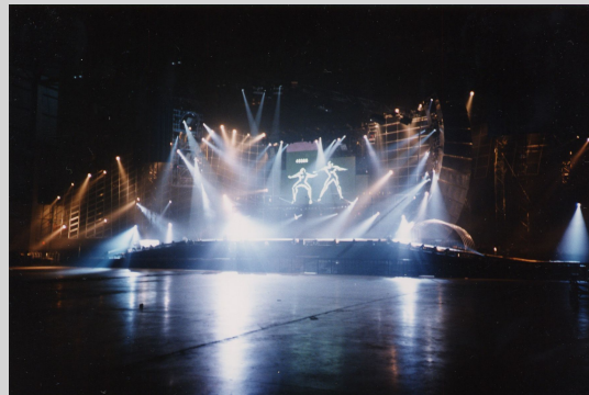
Voodoo Lounge rehearsals