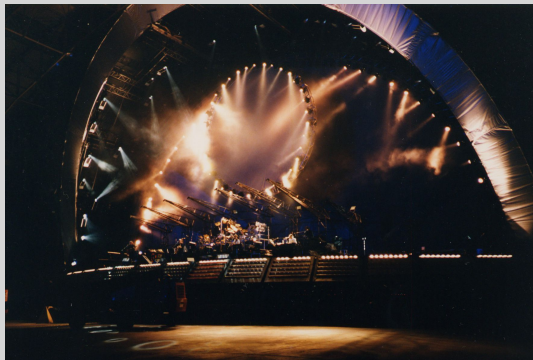
Division Bell rehearsals

The first prototype came to life in late '93 and earned its keep on the Pink Floyd Division Bell tour rehearsals in San Bernadino and then the Rolling Stones Voodoo Lounge build in Toronto. In fact, some of the first Micro-Scope customers were the crew on those tours. Full disclosure – that original prototype only really worked when plugged into power, I'd made an embarrassing error calculating battery life!