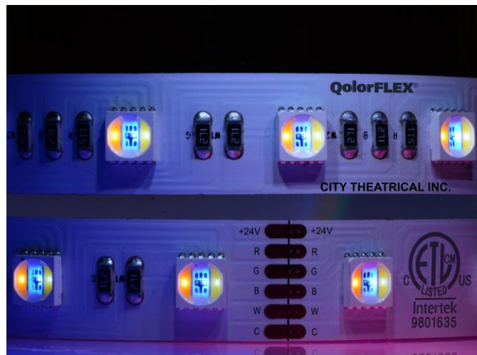
QolorFLEX 5-in-1 HiQ High CRI LED Tape is 25% brighter than other 5-in-1 LED tapes, including best-selling QolorFLEX 5-in-1 LED Tape, RGB + Amber + Cool White.