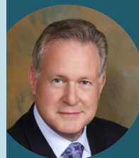
Prof Robert Lustig

The secret to wellness is identifying the illness