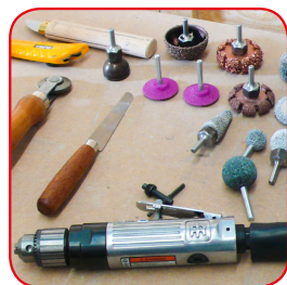
Tools and material for tire repair