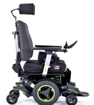
Q700 M HD+