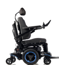
Q700 M HD