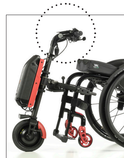
Fixed Front Mounting