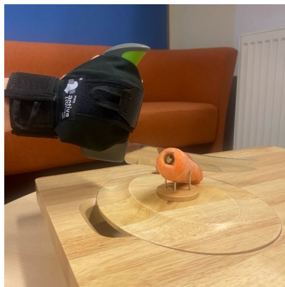
Lite aid – thin and lightweight grip assist for everyday tasks