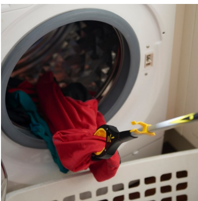
Handi-Grip Grabber – perfect for arthritis