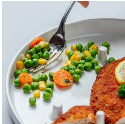
One-Handed Plate – for independent eating