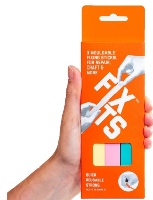
FixIts – for DIY adaptations