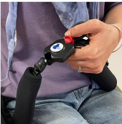
Soloc – wheelchair lap belts for easy fasten and release