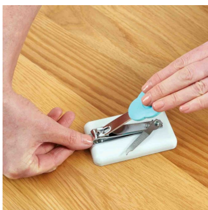
Table-Top Nail Clippers