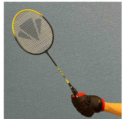
Angled aid – gripping aids for racket sports