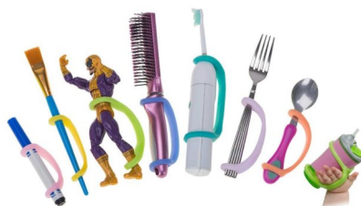
EazyHold Straps – silicone straps to give you extra grip