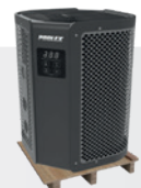
Delivered on a wooden pallet