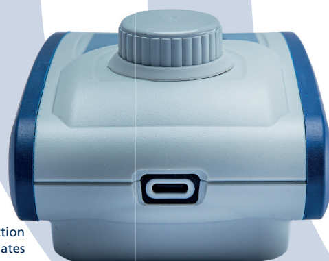
Waterproof USB-C connection for data export and updates

Store up to 100 sets of data, ensuring that all records meet GLP standards for integrity and reliability. Keep your data organized with easy transfer options via NFC using the Lovibond® AquaLX® App or choose a wired data transfer through USB-C using the Lovibond® Data Expert Software. Programming options for one user-defined method and easy instrument updateability empower you to customize your testing protocols effortlessly