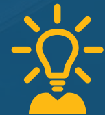
Exhibit showcase of cutting-edge services and solutions