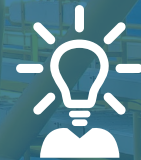
Exhibit showcase of cutting-edge services and solutions