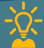
Exhibit showcase featuring innovative decommissioning solutions