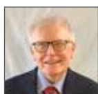
Formation Evaluation Award Estes Centennial Thomas III Bayou Petrophysics