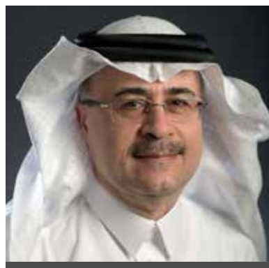
Amin Nasser, President and CEO Saudi Aramco

The oil demand last year was impacted by global economic headwinds. But most analysts expect the situation to significantly improve this year. The International Energy Agency (IEA), for example, is forecasting 1.2 million B/D growth for 2020, which is fairly healthy.