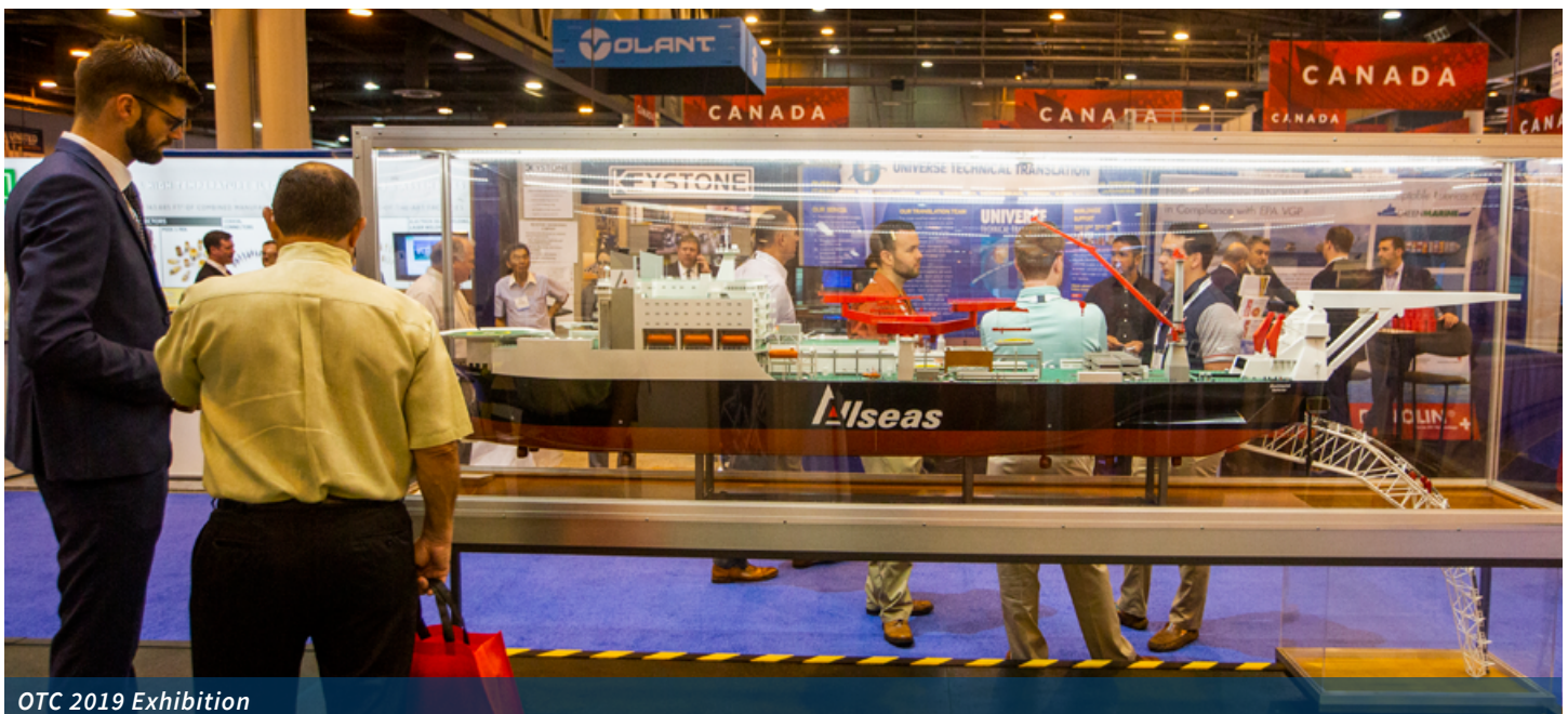
OTC 2019 Exhibition

“As the end user (operator), I explored a lot of new information and technologies that can be applied to my business unit, moreover I can directly contact these manufacturers and service providers easily.”