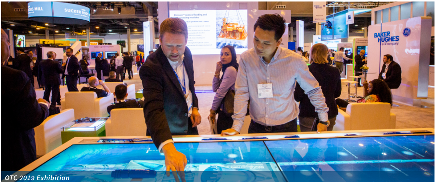
OTC 2019 Exhibition