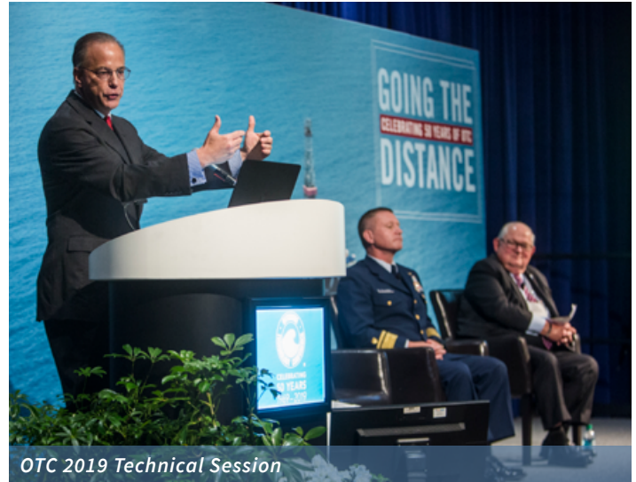
OTC 2019 Technical Session

OTC's Golden Anniversary Opening Session featured industry executives who discussed the milestones of the last 50 years and their vision for the future of offshore E&P operations.