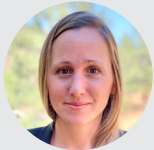
JOCELYN BROWN-SARACINO Offshore Wind Energy Lead U.S. Department of Energy