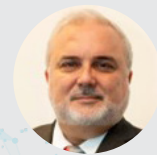
JEAN PAUL TERRA PRATES CEO Petrobras