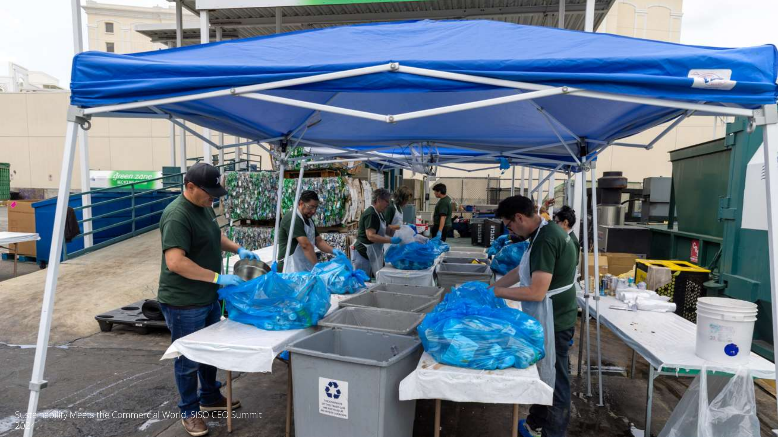
Sustainability Meets the Commercial World, SISO CEO Summit 2024