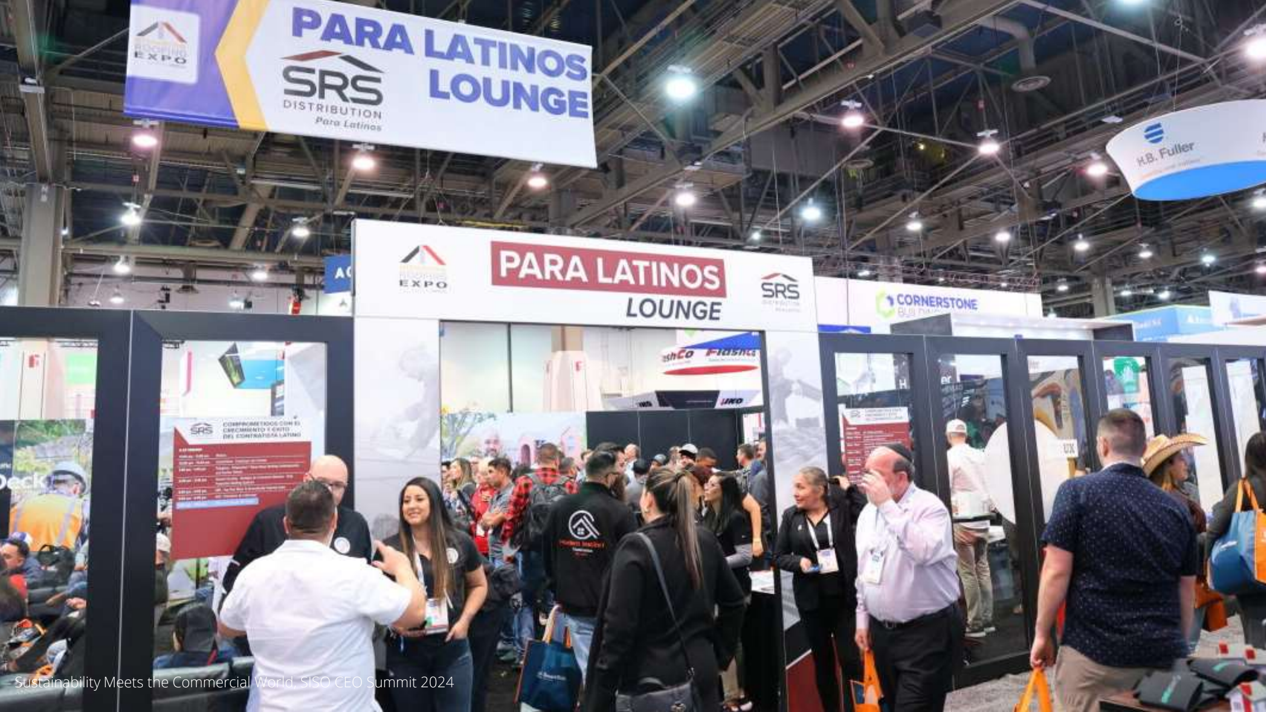
Sustainability Meets the Commercial World, SISO CEO Summit 2024