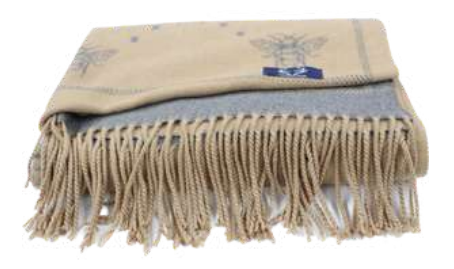
SCA-TASS-BEE-LIGHTBEIGE LIGHT BEIGE