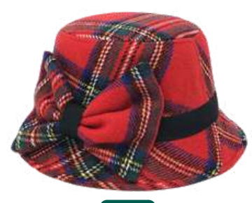
TH2.1 ROYAL STEWART

A cloche hat is a snug, bell-shaped women's hat that was popular during the 1920s. It embodies vintage elegance and complements various outfits with its unique form.