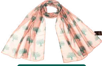
LW-TOL-BEIGEGREEN LIGHT BEIGE