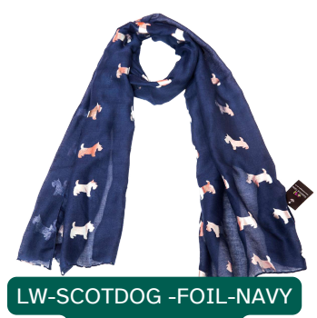
NAVY / SILVER