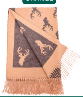
SCA-TASS-STAG-DRKBEIGE DARK BEIGE