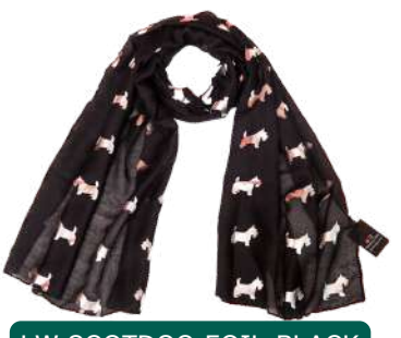
LW-SCOTDOG-FOIL-BLACK BLACK / SILVER