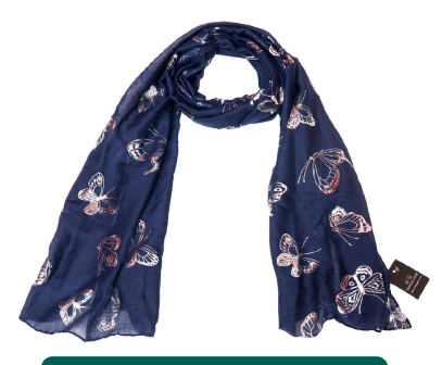
LW-BUTERFLY-FOIL-NAVY NAVY / SILVER