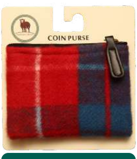
HAMILTON RED MOD