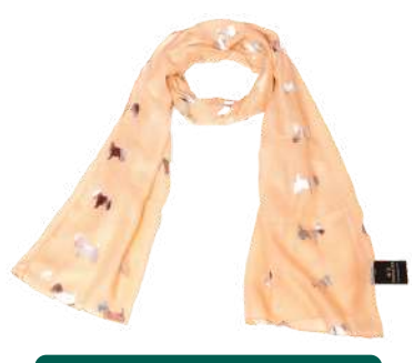
LW-SCOTDOG-FOIL-PINK PINK / SILVER