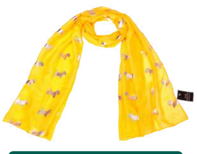
LW-SCOTDOG-FOIL-YELLOW YELLOW / SILVER