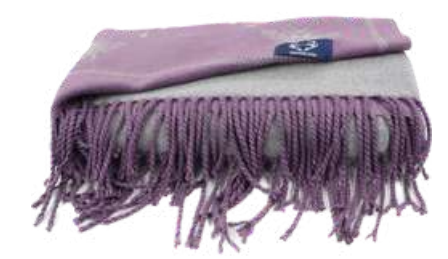
SCA-TASS-BEE-PURPLE PURPLE |