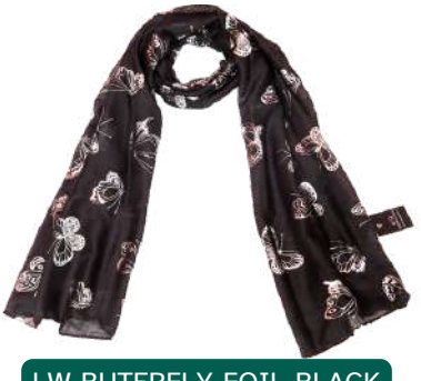
LW-BUTERFLY-FOIL-BLACK BLACK / SILVER