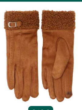
G16.2 LIGHT BROWN