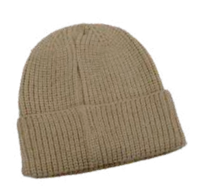
SFT-BNIE-DRKBEIGE DARK BEIGE