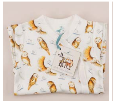
Babygrow (0-6m, 6-12m)