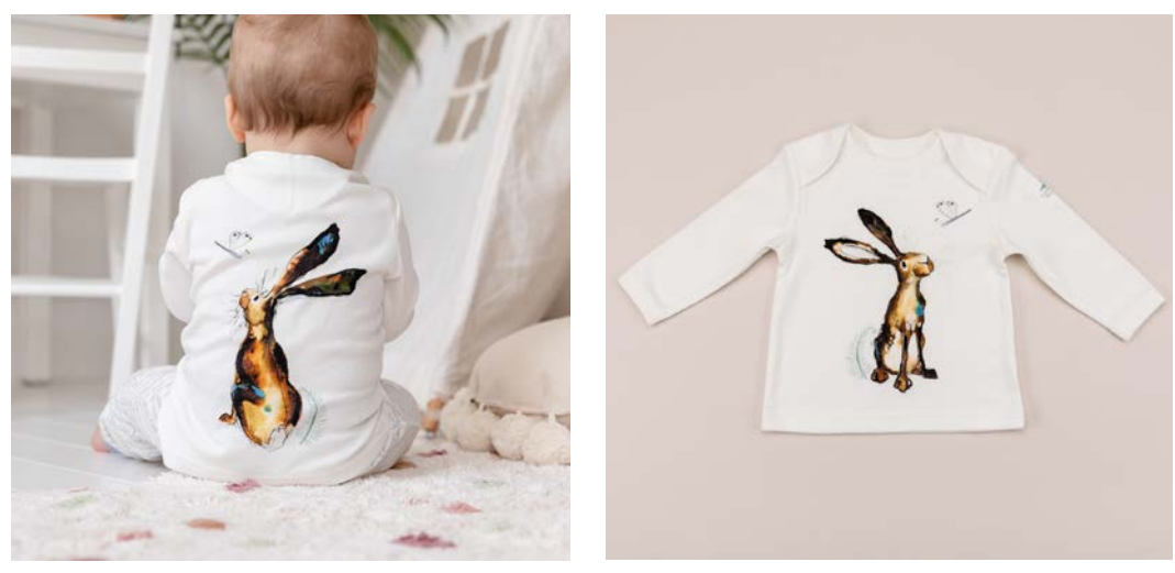
Top (0-6m, 6-12m, 1-2y)