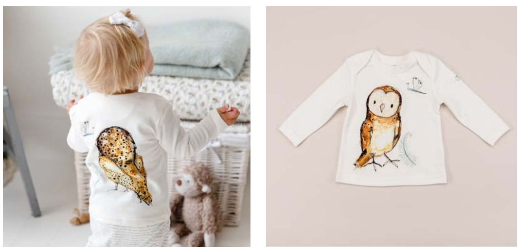
Top (0-6m, 6-12m, 1-2y)