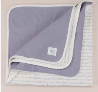
Blanket (one size)