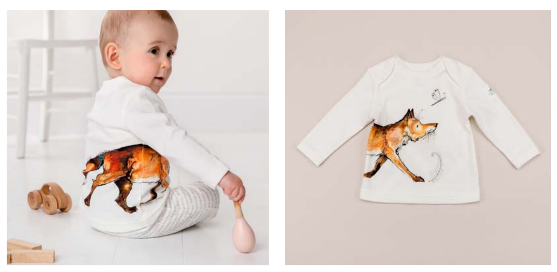
Top (0-6m, 6-12m, 1-2y)