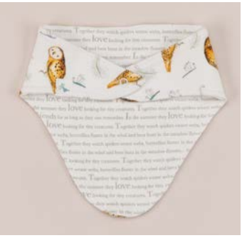
Bib (One size)