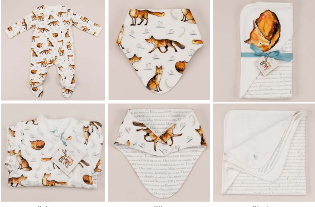
Babygrow (0-6m, 6-12m)