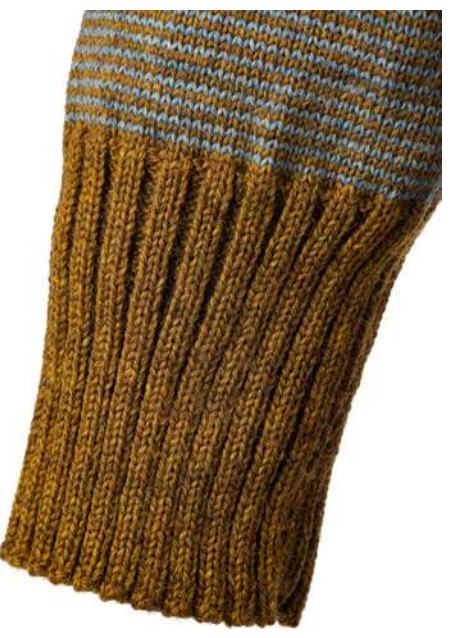
Detailing on Shoulders and Cuffs