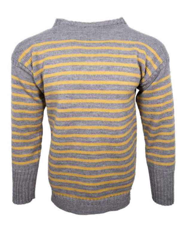
Puffin Smoke / Summer Storm CJ1412