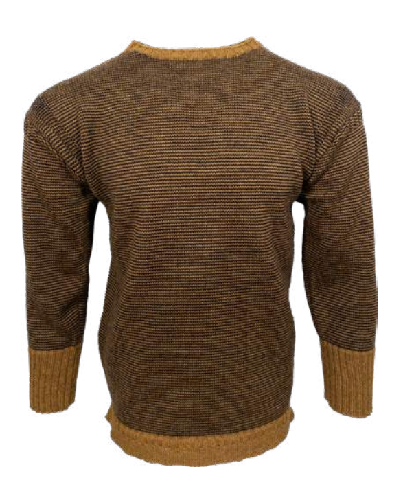
Casquets Harvest / Navy CJ1305