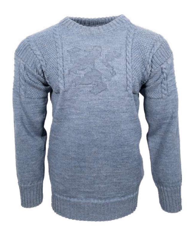
Alderney Kielder CJ1021