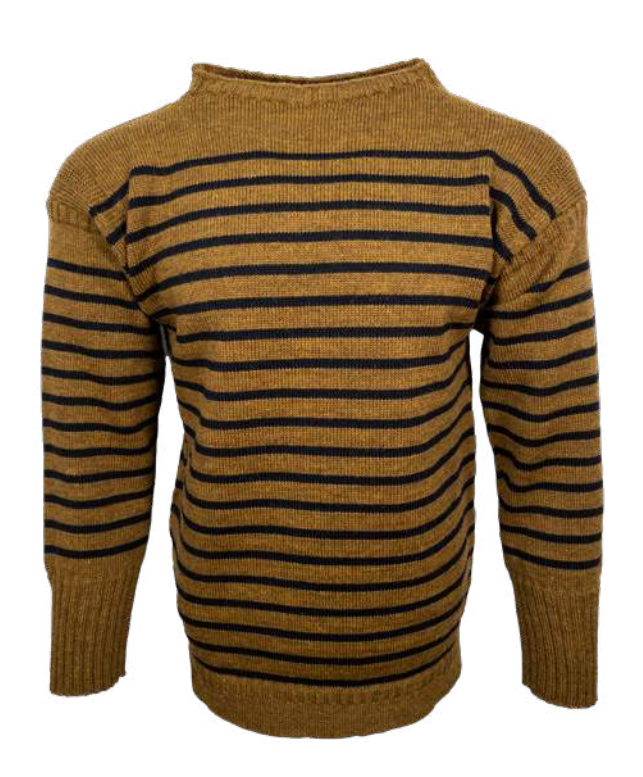
Puffin Harvest / Navy CJ1408