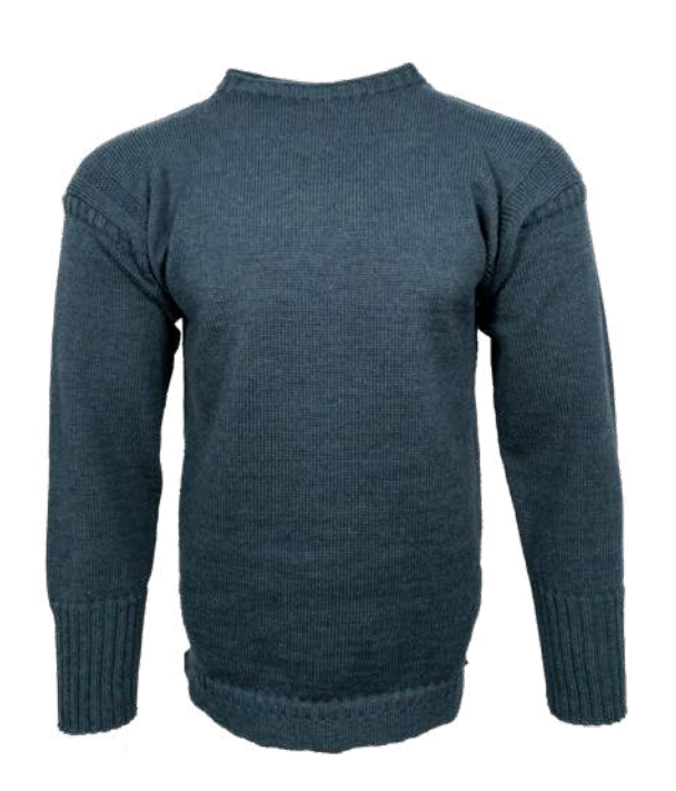
Burhou Mallard CJ0120