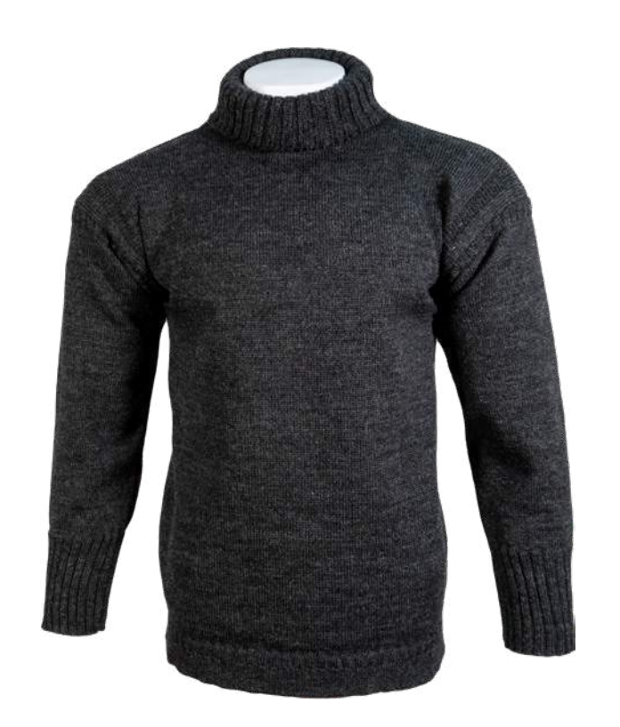
Gannet Charcoal CJ0230