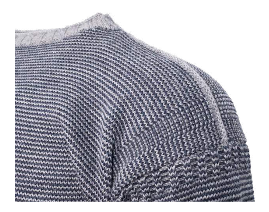
Detailing on Shoulders and Collar