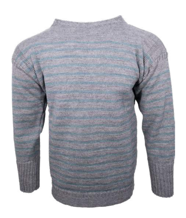
Puffin Smoke / Summer Storm CJ1412