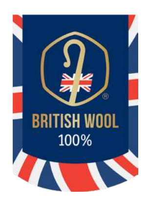
License No. GB0011 – 1