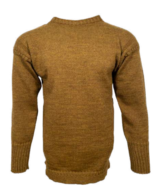
Burhou Harvest CJ0115