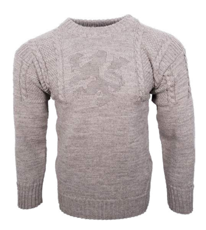
Alderney Oatmeal CJ1021