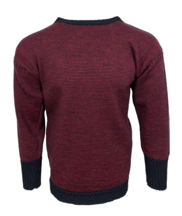
Casquets Navy / Cassat CJ1302