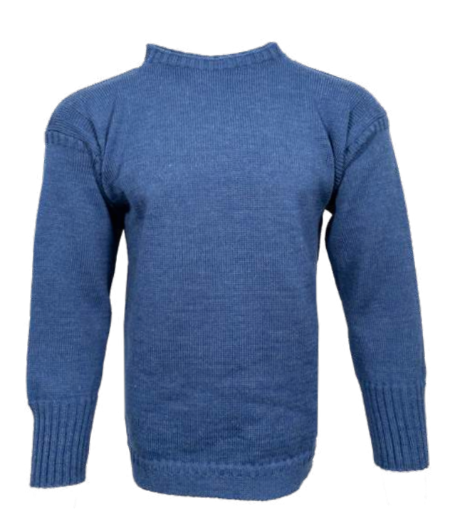
Burhou Indigo CJ0127