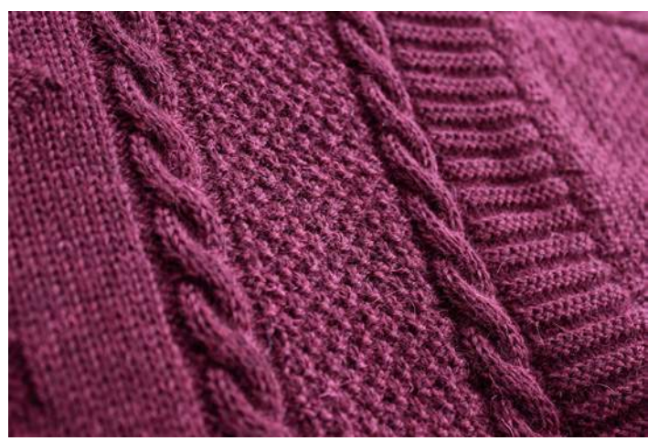
Alderney Emblem and Detailing