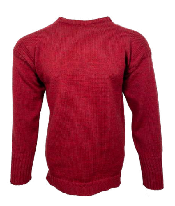
Burhou Cassat CJ0126