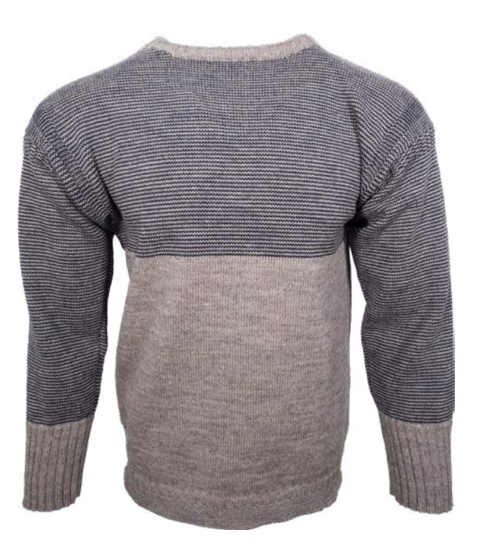
Ellis Dark Grey Natural / Cassat CJ1215