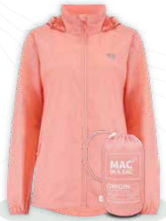
SOFT CORAL XXS-XXL