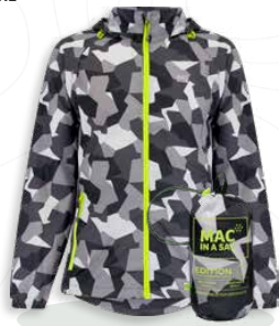
WHITE CAMO XXS-XXXL