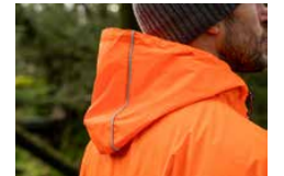
Volume Adjustable Hood with Reflective Detailing