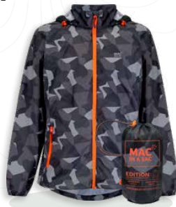
BLACK CAMO XXS-XXXL