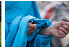
Cycle Wrist Straps