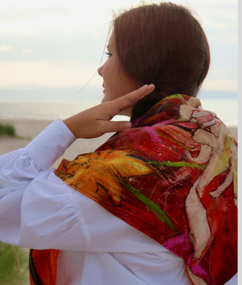
Traditional Square MB/TS 90x90cm 100% silk