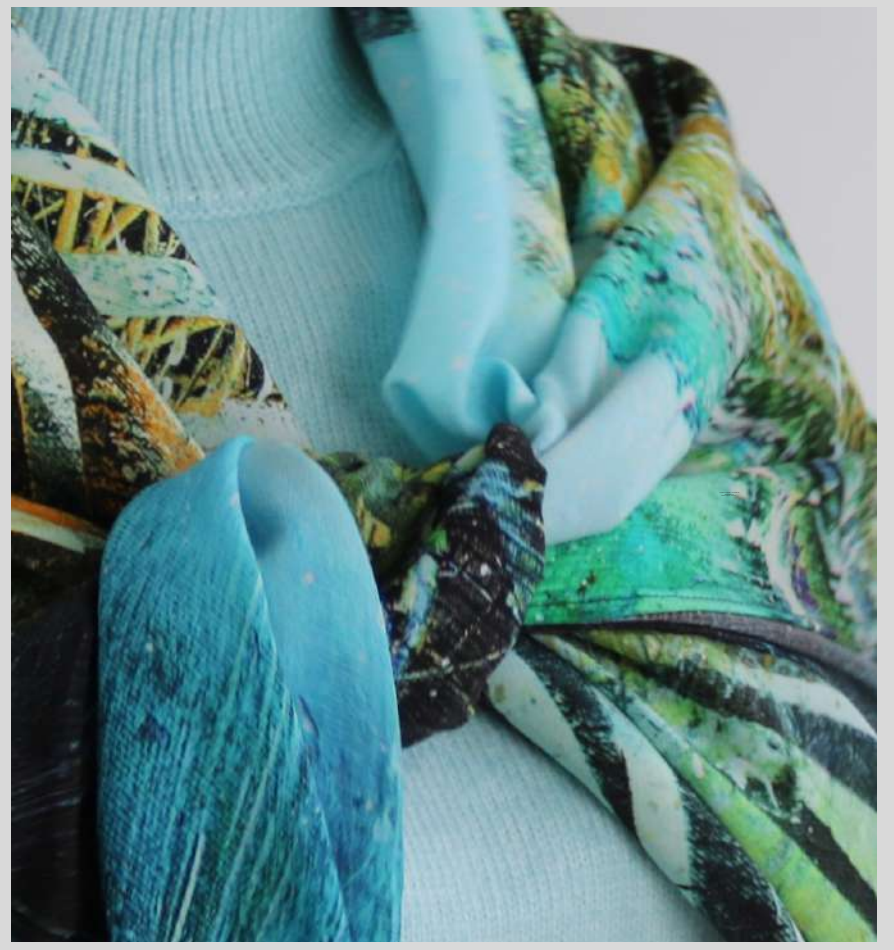
Traditional Square BG/TS 90x90cm 100% silk