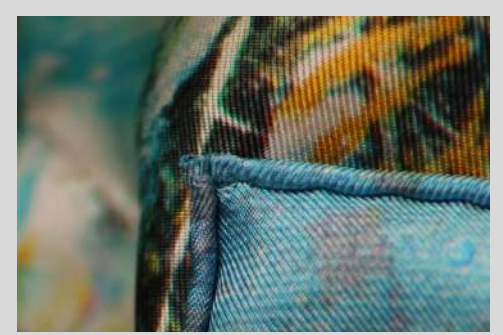
Blue Grass Oversize Square BG/OS 130x130cm 100% silk