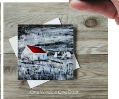
One Window, One Door