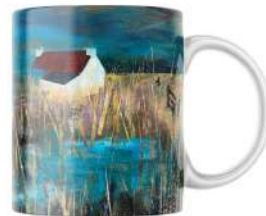
Gate to the Pond