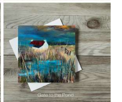
Gate to the Pond