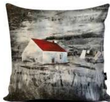
One Window One Door