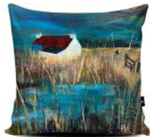
Gate to the Pond