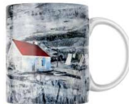
One Window One Door