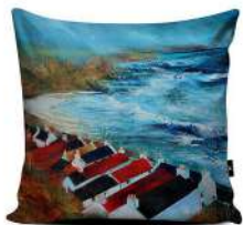
Above the Rooftops

(cover only, allowing you to choose your preferred inner)