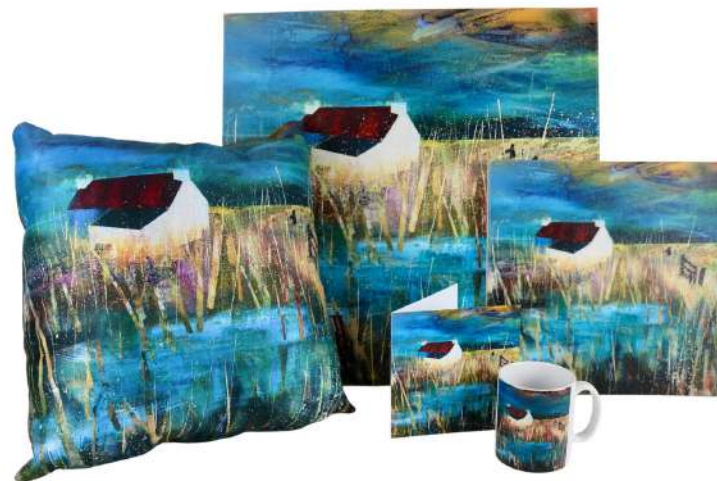
Gate to the Pond