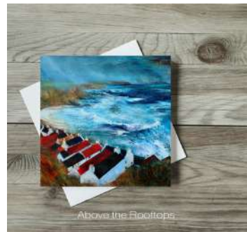
Above the Rooftops

Our cards are printed using paper from managed forests on 350gsm heavyweight silk board which is Forest Stewardship Council Certified.