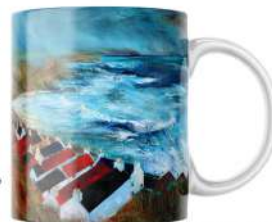
Above the Rooftops

Vegan suede Machine-washable Woven label Charcoal back Concealed Zip Low minimum order Standard 43 x 43cm