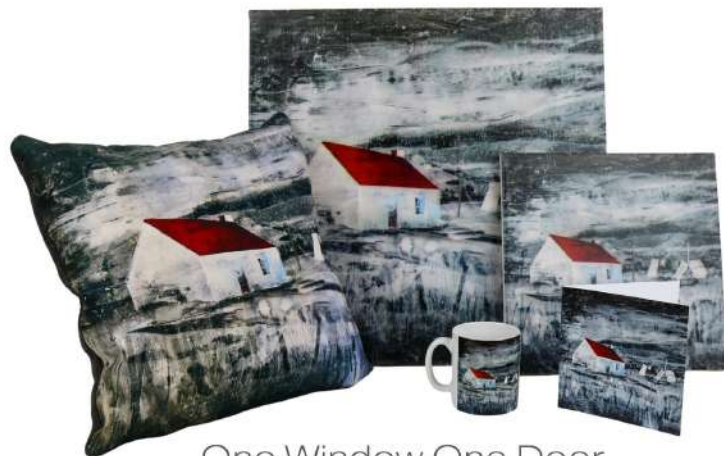
One Window One Door