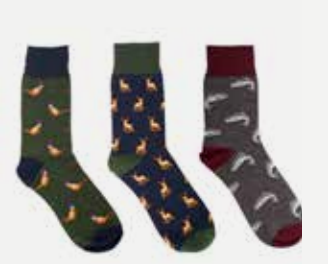
SOCKS PAGES 24-25