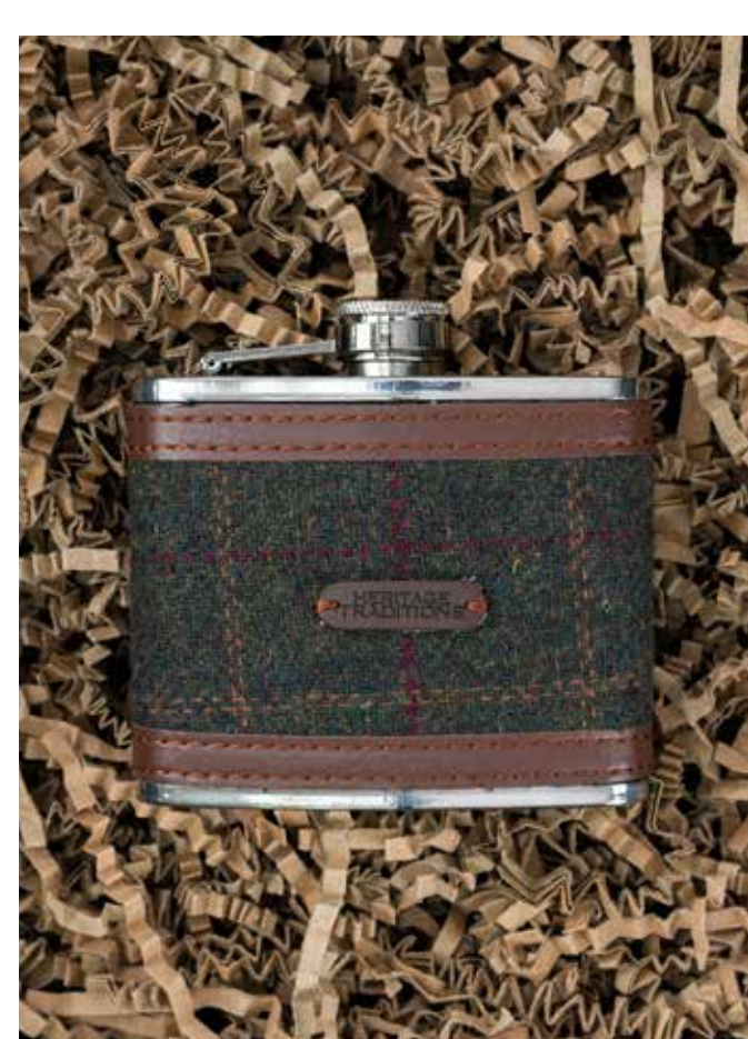
Our Tweed 4oz Hip Flask has a screw top and is decorated with a