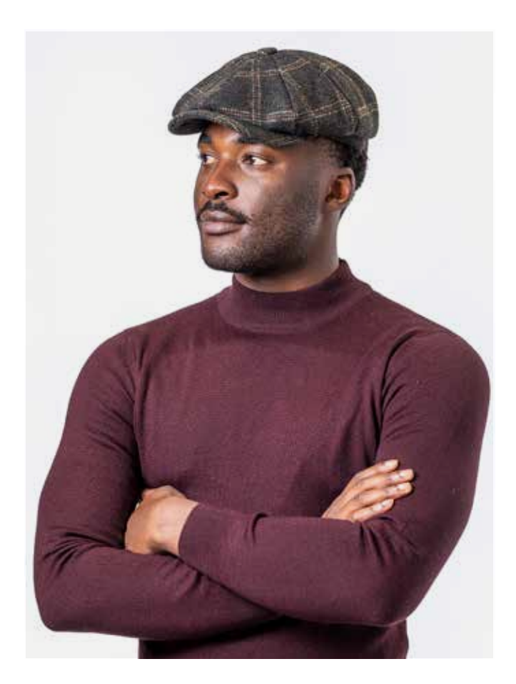
Pack Size- 5

Inspired by the in-famous Peaky Panel Newsboy, our caps take a modern twist on the classic style. Crafted in a variety of fabrics, these hats are perfect to add some character to a formal look. Razor blade not included! Do not wash or iron. Dry Clean Only