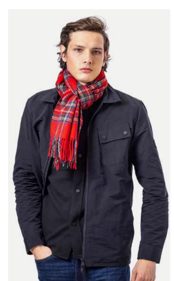
Pack Size- 5

Add a touch of tartan to your outfit with our Pure Wool Tartan Scarf. Soft brushed finish and fringe end. A perfect addition to any wardrobe. Do not wash or iron. Dry Clean Only.