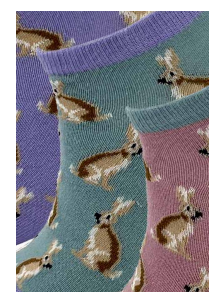
Pack Size- 10

Inspired by classic British countryside animals. These Hound and Hare design socks are made from a super soft bamboo yarn and come in a range of pastel shades. The knee high length makes them perfect to wear with your wellies! Featuring contrast colour heels, toes and rib tops. Breathable and lightweight.