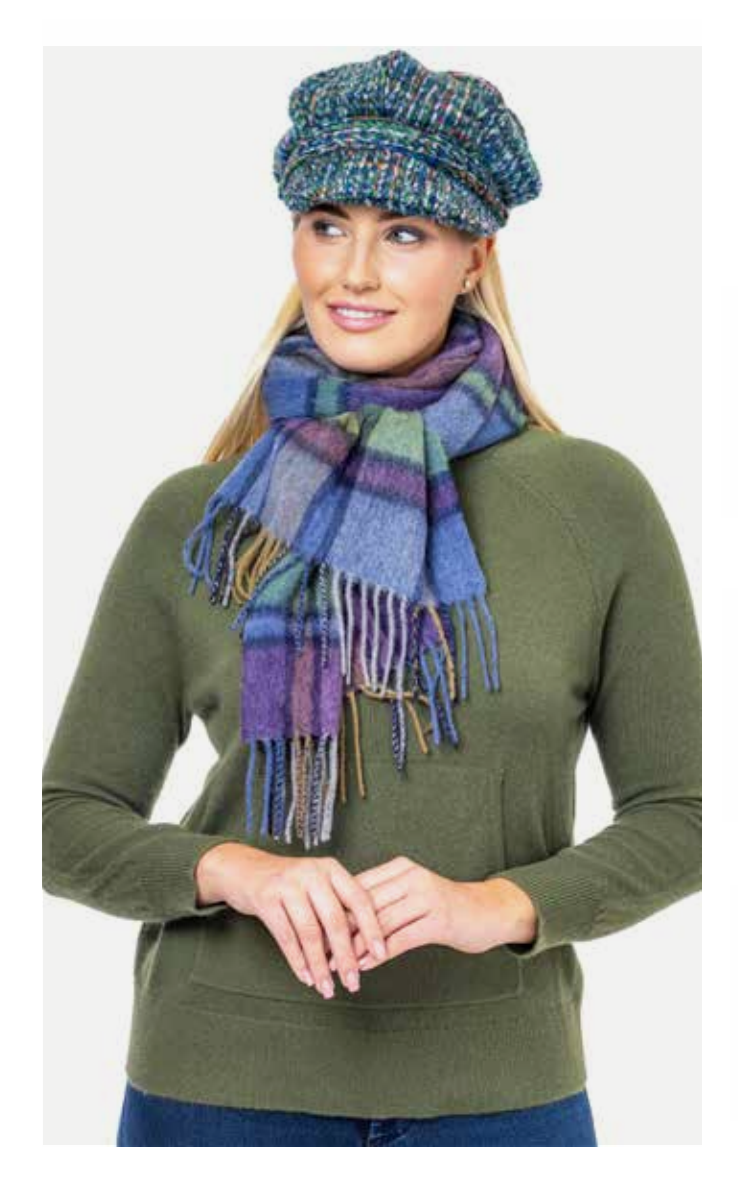
Pack Size- 5

Add a touch of tartan to your outfit with our Pure Wool Tartan Scarf. Soft brushed finish and fringe end. A perfect addition to any wardrobe. Do not wash or iron. Dry Clean Only.