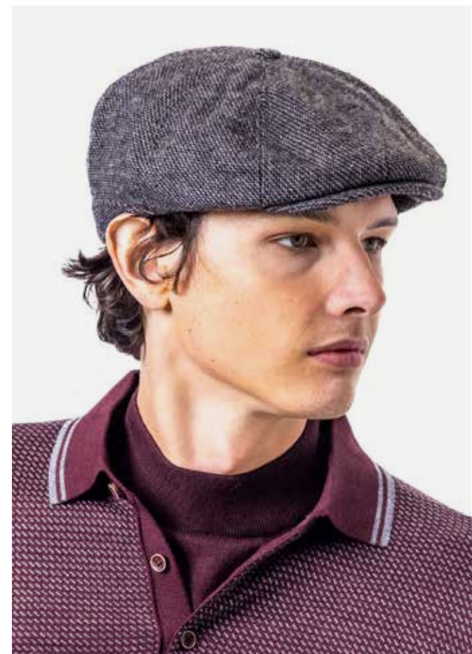
Pack Size- 5

Our signature Baker Boy Cap is crafted in the traditional peak and panel style. Made from wool mix tweed, these hats will add a touch of modern tradition to your look. Do not wash or iron. Dry Clean Only.