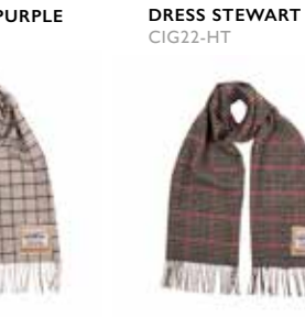
GREY / RED