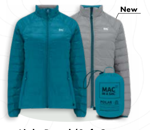
Light Petrol/Soft Grey