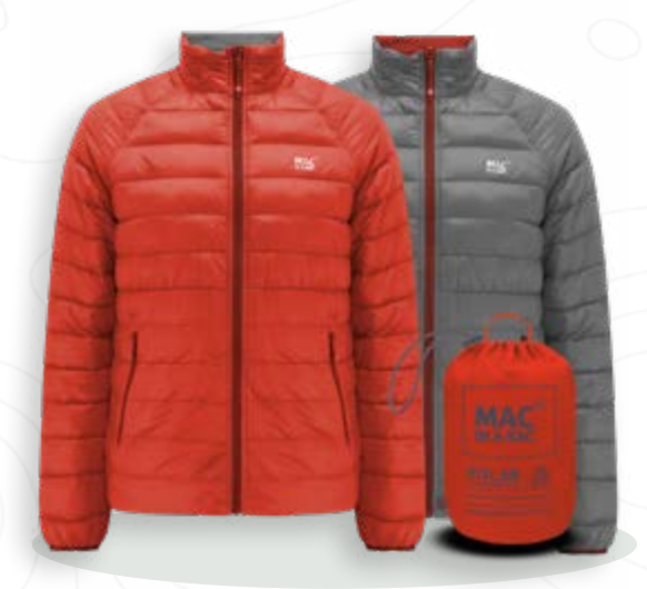
Available in 4 reversible colours for men, and 4 reversible colours for ladies.