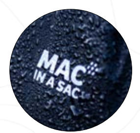
Waterproof 10,000mm Breathable 8,000gsm