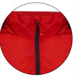
Water Repellent YKK® Front Zip