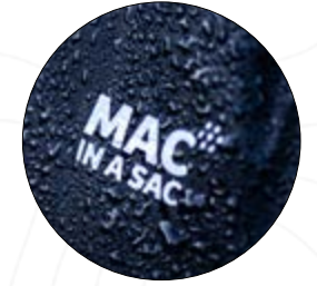
Waterproof 10,000mm Breathable 8,000gsm