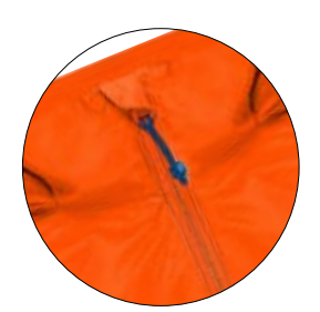
Water Repellent YKK® Front Zip