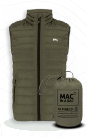
Available in 4 colourways for men, and 4 colourways for ladies.