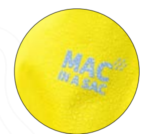
Waterproof 10,000mm Breathable 8,000gsm