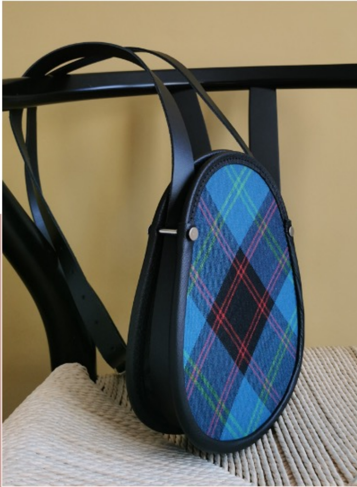
Ailsa Home Ancient Tartan

Sourcing from weaver mills with histories dating back to the 19th century, the fabrics within our designs are proudly made by talented artisans who dye, warp & weave these sumptuous textiles.