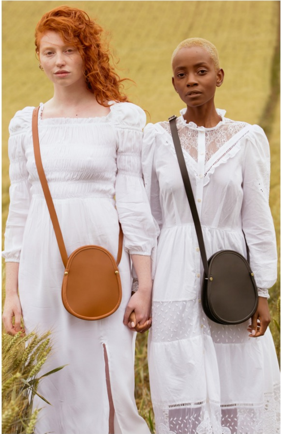
The Ailsa Bag, in London Tan & Raven Black

Welcoming the new Ailsa bag to the NIXEY collection! It's quietly elegant and simple design makes the Ailsa a wardrobe classic, perfect for everyday wear.