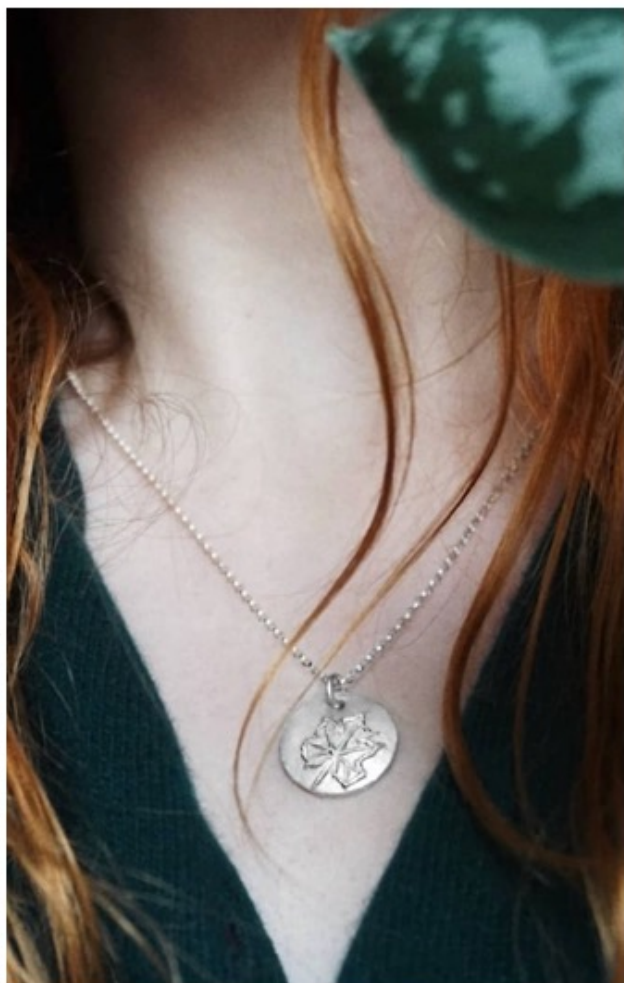
Tree Zodiac Amulet necklace; Vine