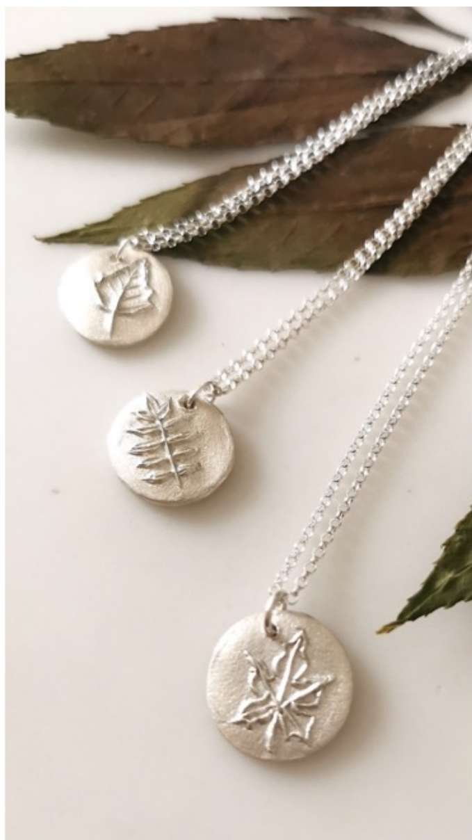
Tree Zodiac Amulet necklaces; Birch, Rowan & Ivy

Explore ancient Celtic astrology and discover your Tree Zodiac sign, with NIXEY's fine & sterling silver necklace range, handmade in the U.K.