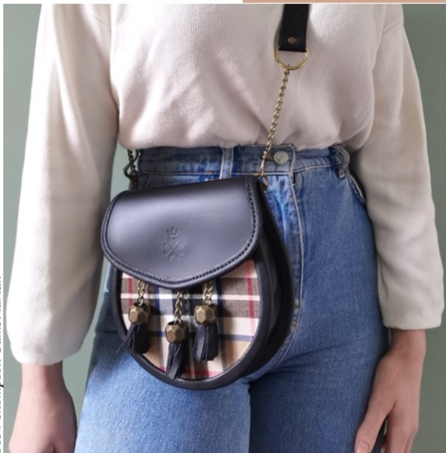
1834 Thompson Camel tartan

Championing the artisanship and heritage of these shores, we use tartans and tweeds woven in Scotland, from natural wool fibres.