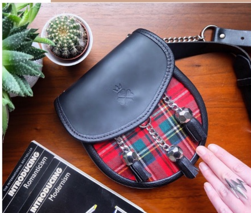
1834 Royal Stewart tartan

Championing the artisanship and heritage of these shores, we use tartans and tweeds woven in Scotland, from natural wool fibres.