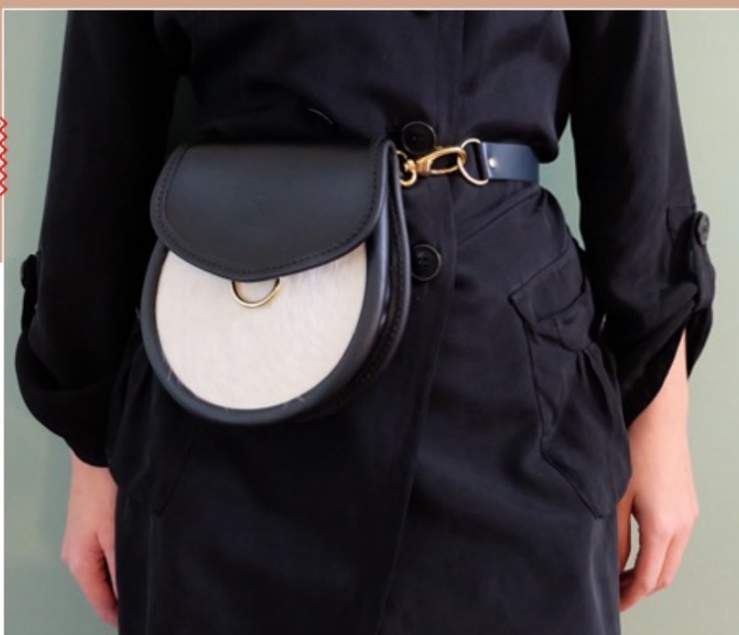
PORTOBELLO Monochrome, worn as a belt bag

Named PORTOBELLO, after the coastal suburb of Edinburgh and the famous London market where we first started selling our bags back in 2017.