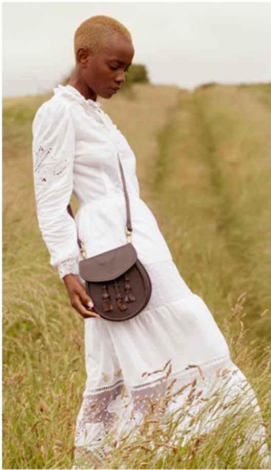
Hart in the Highlands; Brown leather embossed with a Stag head design.