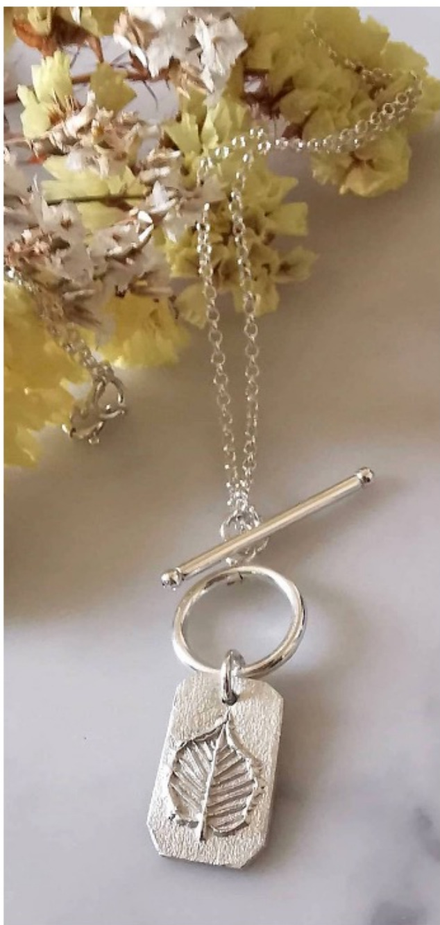
Tree Zodiac Tablet necklace; Hazel

Explore ancient Celtic astrology and discover your Tree Zodiac sign, with NIXEY's fine & sterling silver necklace range, handmade in the U.K.