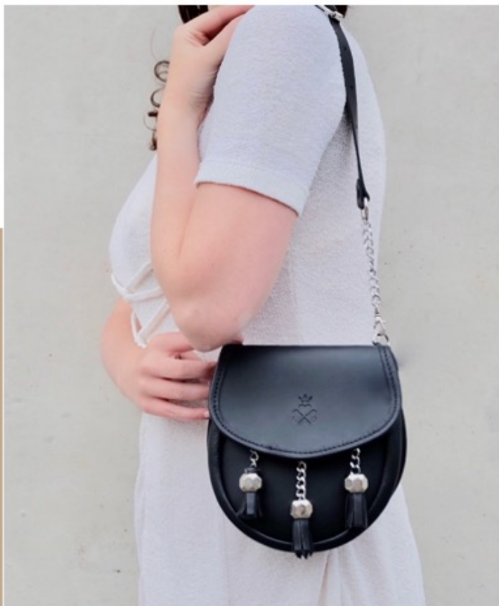
1834 Raven Black as a shoulder bag

a beltbag, shoulder & cross-body bag in one