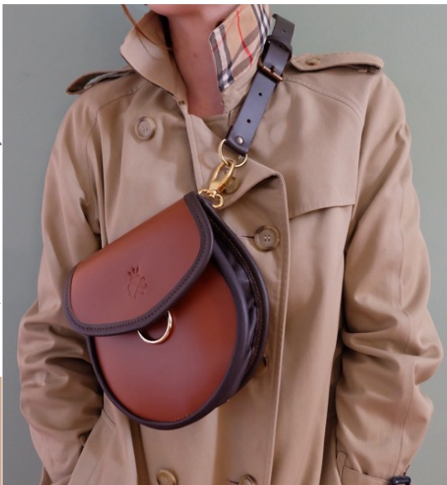
PORTOBELLO Chestnut Tan , worn as a short cross-body

The PORTOBELLO bag takes the heritage design of our original 1834 bag & reimagines it afresh, with the short cross-body strap design. As with many NIXEY designs, this can also be worn around the waist.