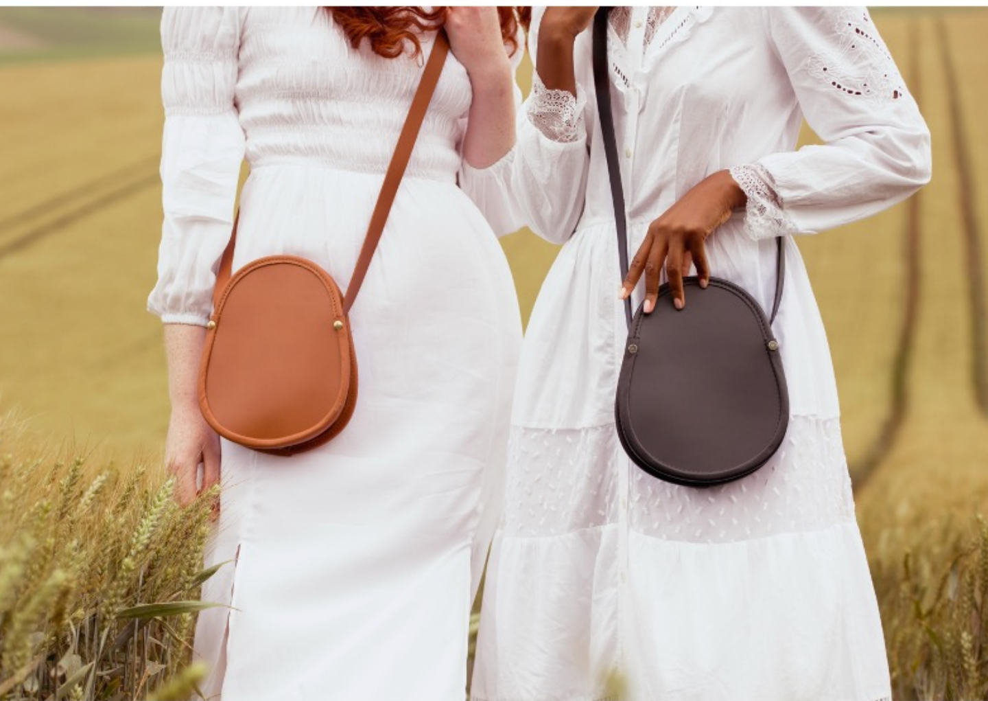
The Ailsa Bag, in London Tan & Raven Black