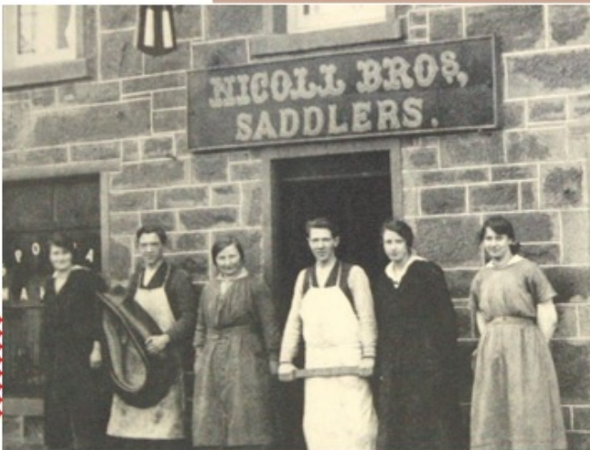
Original 19 th century workshop, in Bankfoot, Scotland

Our original collection, The 1834, is named in honour of the master craftspeople who handmake each piece. Their workshop near the Highlands has a manufacturing history, which extends all the way back to 1834. This rich heritage is cut & stitched into every bag.