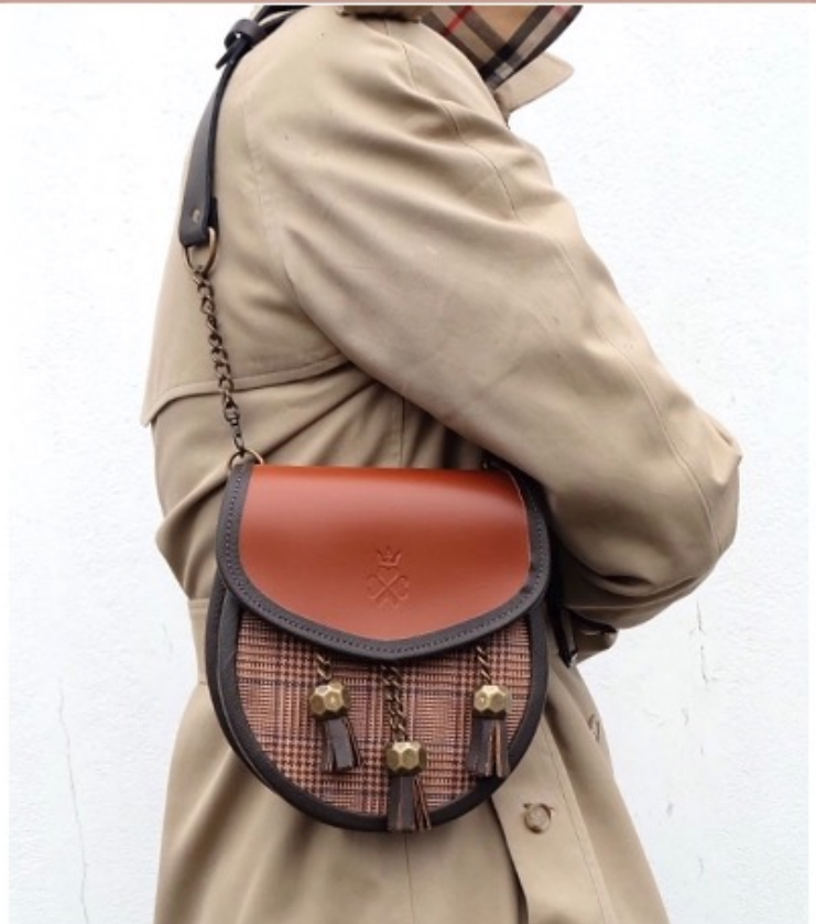
1834 Glen Keith tweed

We use tartan and tweeds in a range of our classic NIXEY bag shapes.