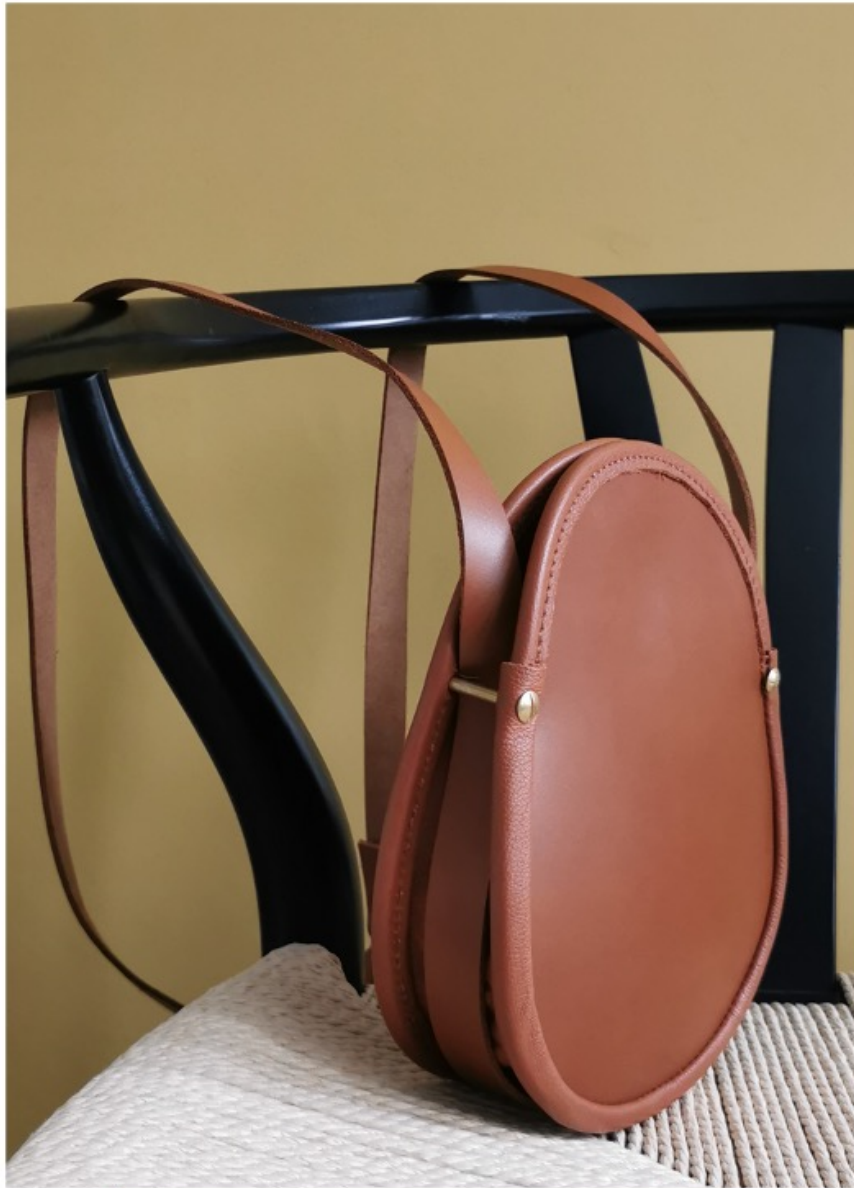
Ailsa Bag, London Tan

Beautifully crafted & hard-wearing, NIXEY bags are designed for the outdoors. The Ailsa bag is no exception. It takes its name from Ailsa Craig, an oval-shaped island 16 km west of mainland Scotland.