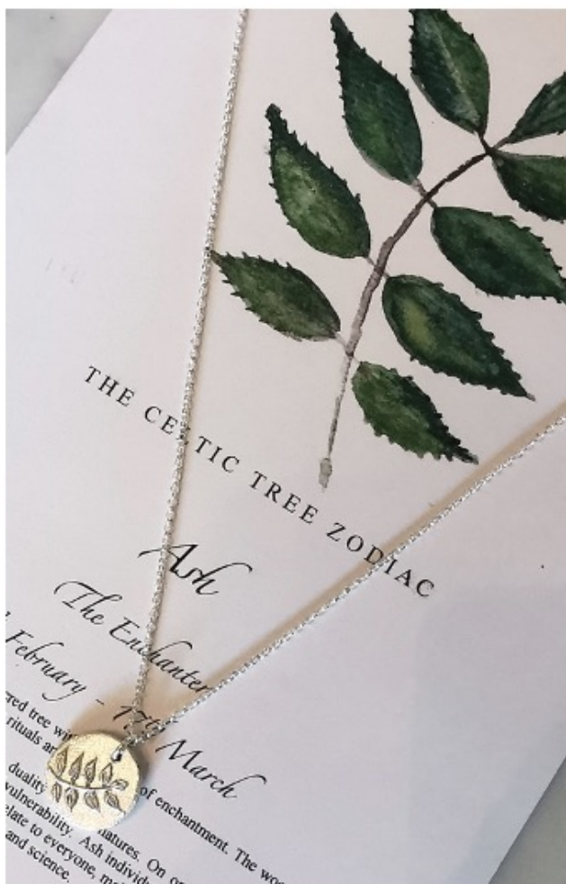
Each tree sign has its own characteristic