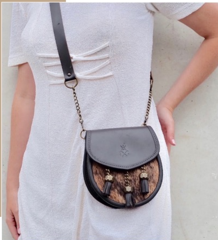
1834 Natural Hair-On-Hide as a cross-body bag

The timeless style of NIXEY's original 1834