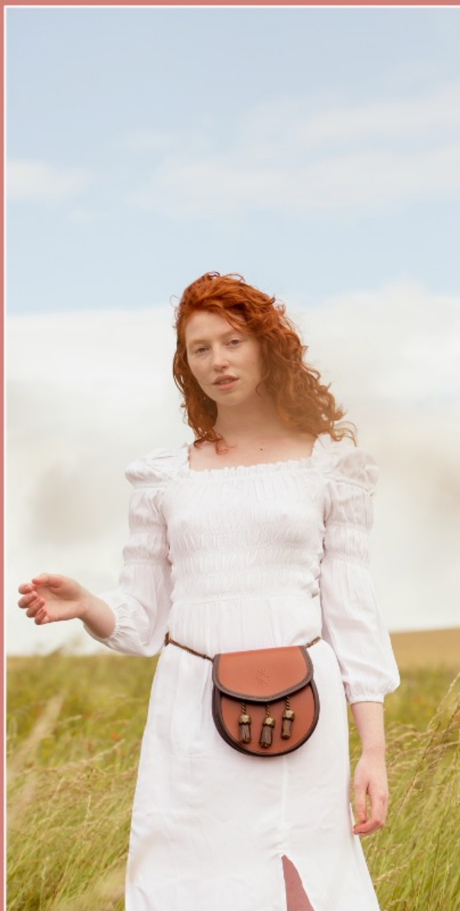
The 1834 Chestnut Tan, worn as a beltbag