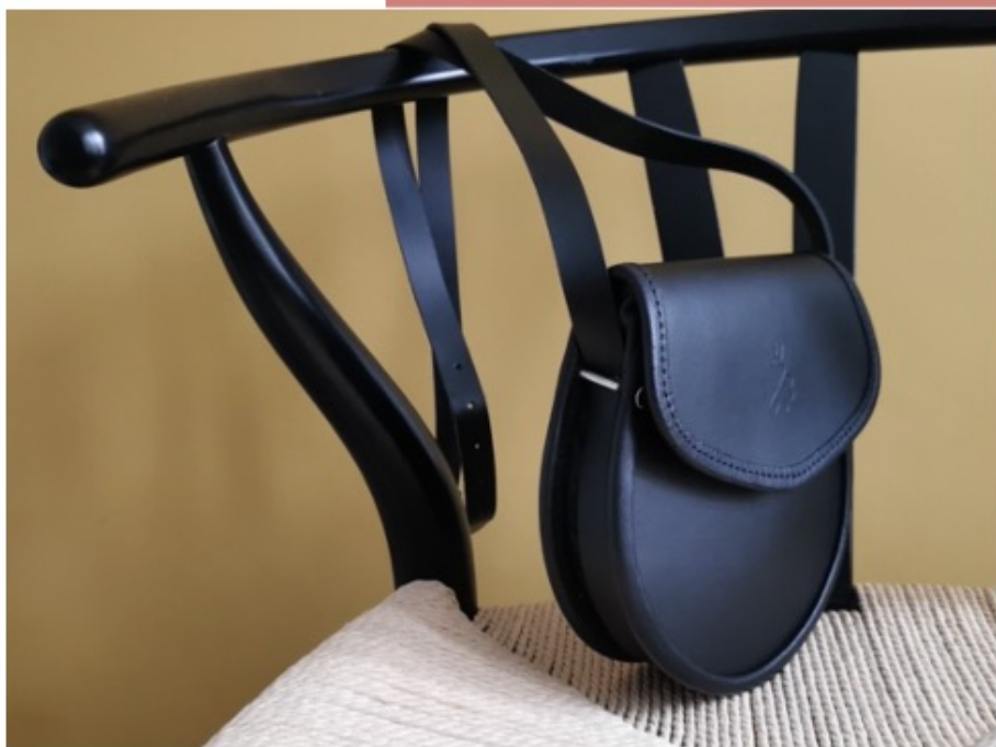
BONNIE-B in Raven Black

Embracing fashion's love of minimalism but retaining our strong sense of tradition, the BONNIE-B is a cross-body bag, in NIXEY's signature shape.