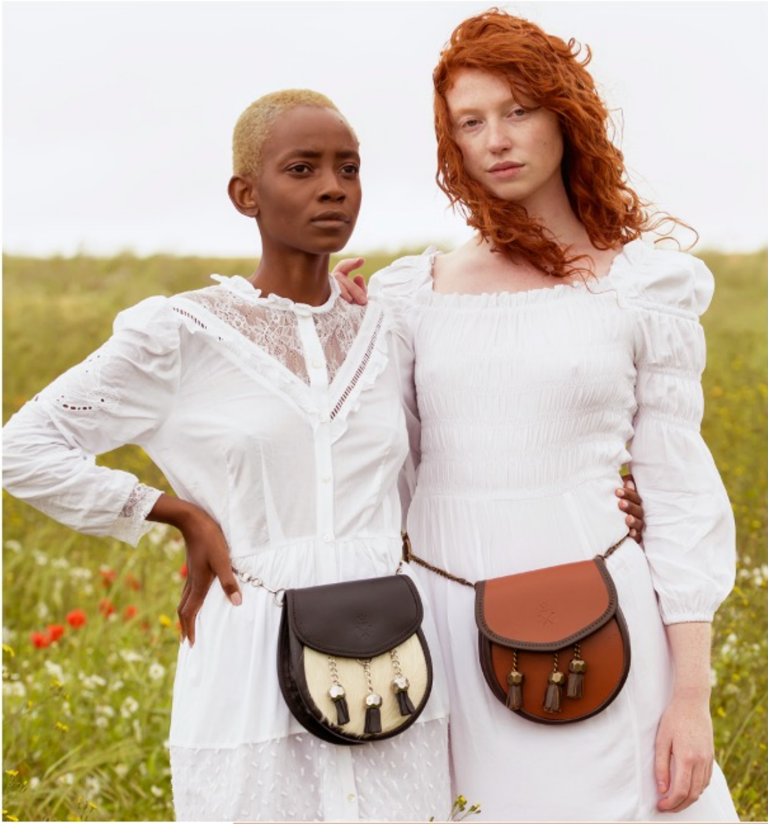
The 1834 Light Hair-On-Hide & Chestnut Tan as beltbags