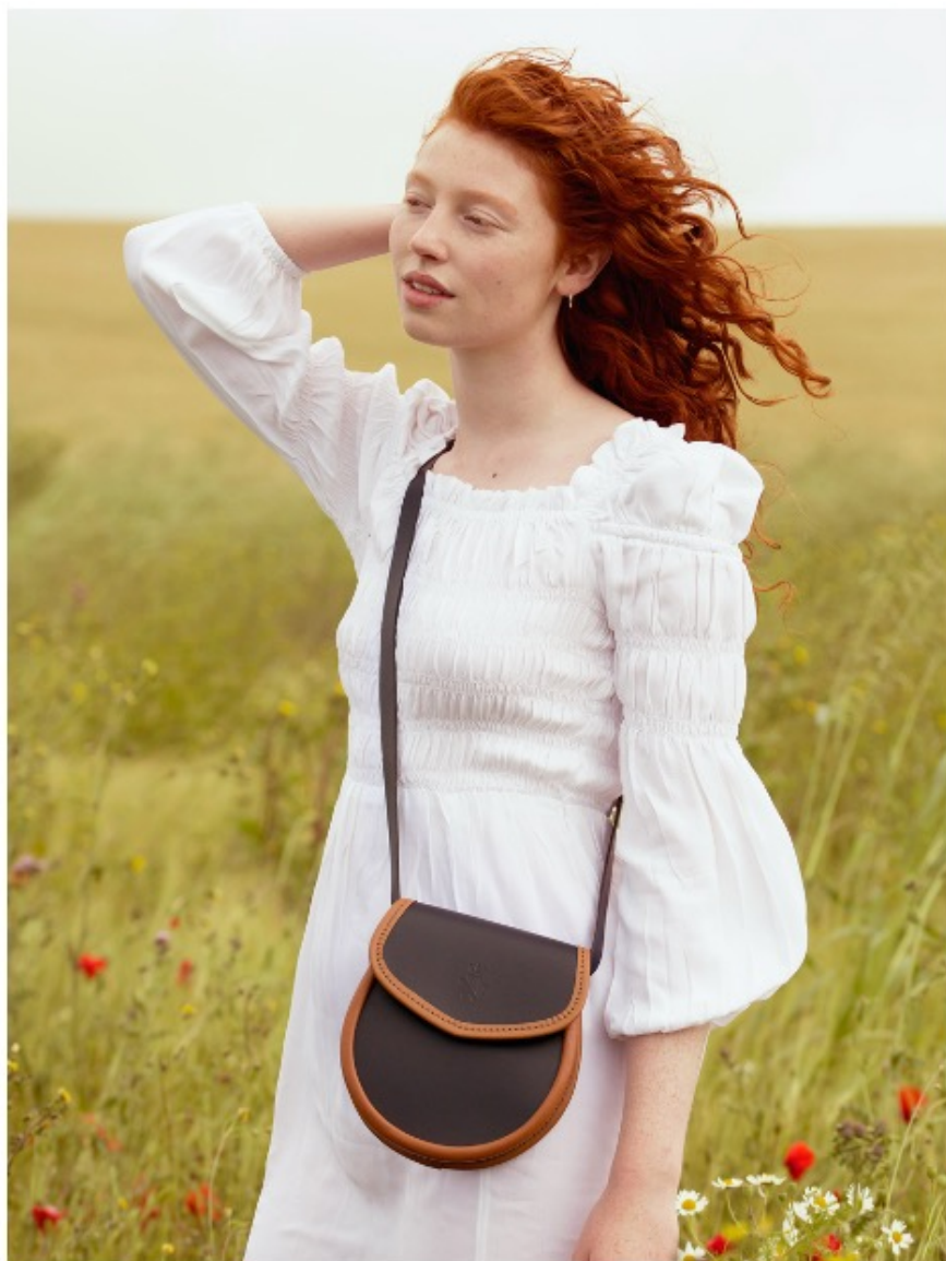
BONNIE-B in Raven Black & London Tan