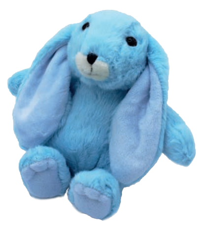
Mini Snuggly Bunny Baby Blue Size: 14cm Code: MRT22266F-3