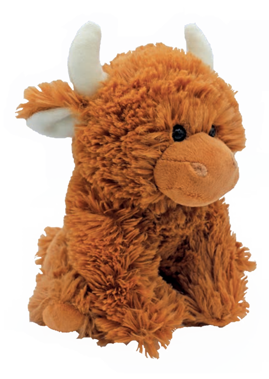
Small Highland Coo Size: 20cm Code: MRT802547