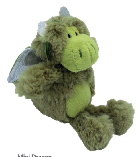
Mini Dragon Size: 12cm Code: MRT300804