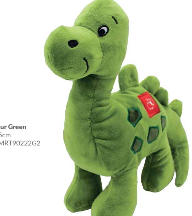
Dinosaur Green Size: 25cm Code: MRT90222G2