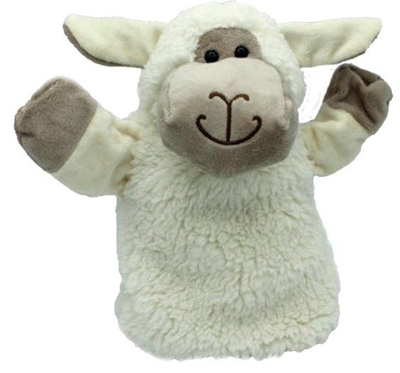
Sheep Hand Puppet Size: 23cm Code: MRT30234