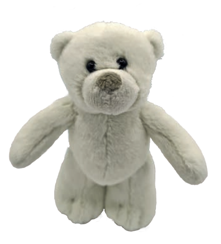
Mini Cream Bear Size: 13cm Code: MRT21700B-13CM