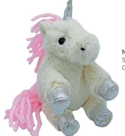
Mini Unicorn Size: 13cm Code: MRT70209AJ4