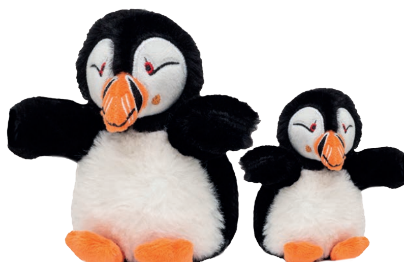
Puffin Mini Size: 13cm Code: MRT50633