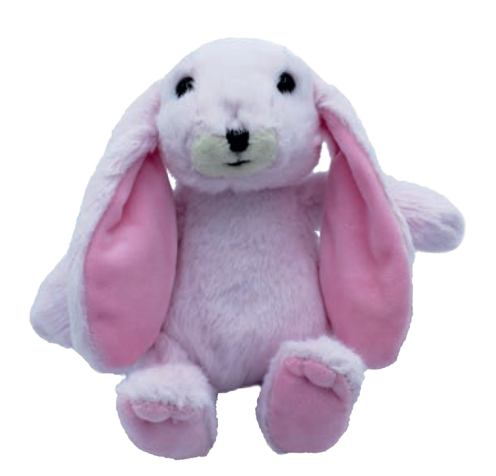
Mini Snuggly Bunny Baby Pink Size: 14cm Code: MRT22266E-3