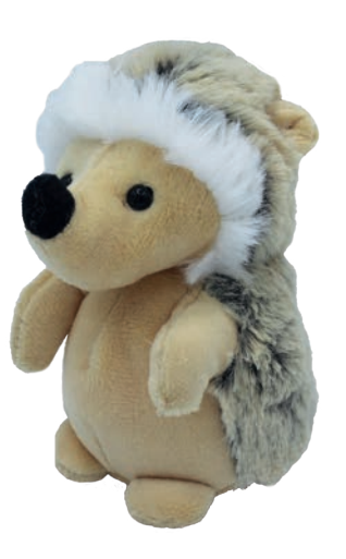
Mini Hedgehog Size: 12cm Code: MRT221854

Mini Dolphin Size: 12cm Code: MRT90283-12CM