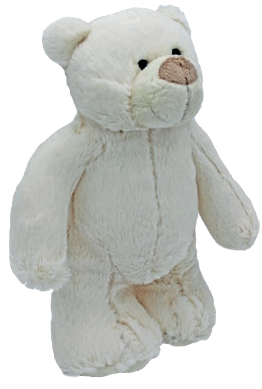
Standing Bear Cream Size: 21.5cm Code: MRT21700B