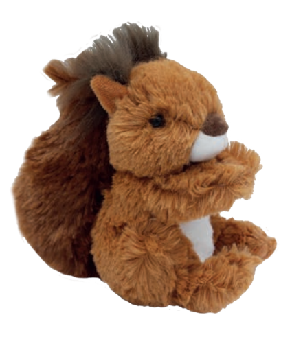
Mini Squirrel Size: 11cm Code: MRT300864