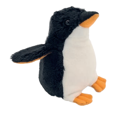
Mini Penguin Size: 10cm Code: MRT70639-10CM