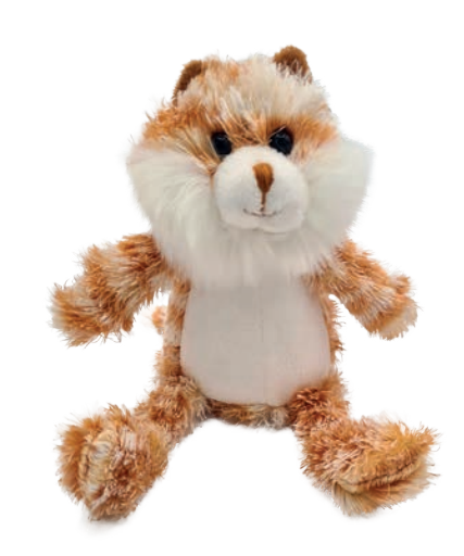
Mini Ginge Cat Size: 10cm Code: MRT22645-10CM

Mini Dolphin Size: 12cm Code: MRT90283-12CM