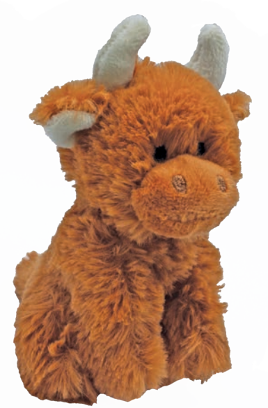
Mini Highland Coo Size: 13cm Code: MRT802544