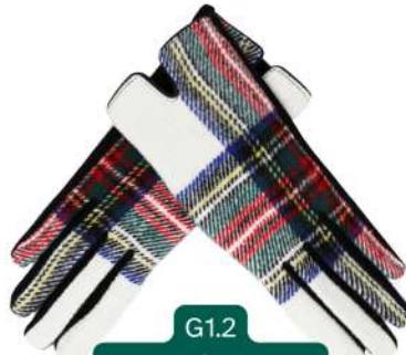
G1.2 WHITE STEWART