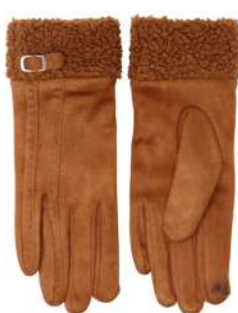
G16.2 LIGHT BROWN