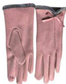
G13.2 LIGHT PINK