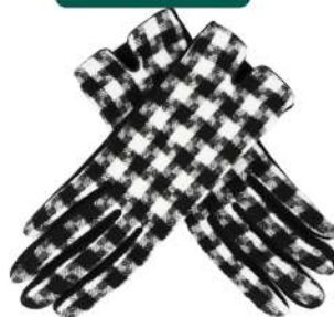
G4.2 HOUNDSTOOTH WHITE