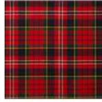
MacPherson Clan MOD