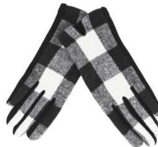
G3.2 ROB ROY WHITE