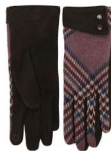
G14.8 DARK PURPLE