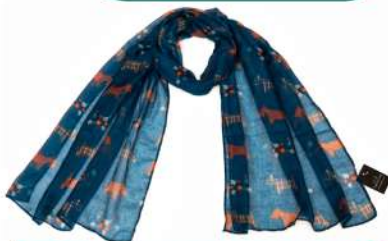
LW-SCOTDOG-TAR-DRKGREEN DARK GREEN