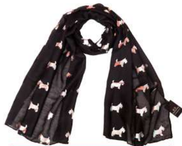
LW-SCOTDOG-FOIL-BLACK BLACK / SILVER