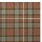
Fraser Hunting WEA