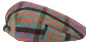
MACDONALD CLAN ANCIENT GH2.11