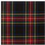
Stewart Black MOD