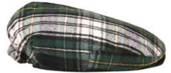
CAMPBELL DRESS MODERN GH2.4