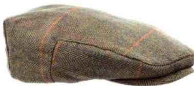
GH1.21 NEW BROWN