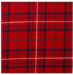
Rose Red MOD