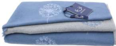
SCA-ALLIUM-LIGHTBLUE LIGHT BLUE