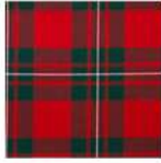
MacGregor Clan MOD