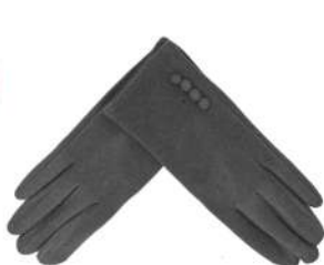
G7.4 DARK GREY