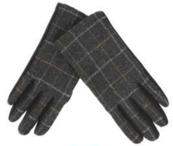
G6.3 CHARCOAL BLACK

QTY/PRICE 3 - £3.80 12 - £3.50 100 - £3.00