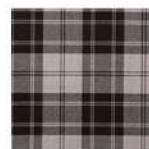
Douglas Grey MOD