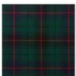
Davidson Clan MOD