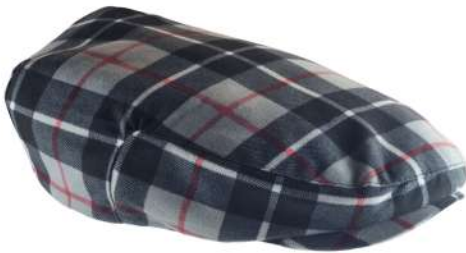
GH1.16 GREY THOMSON