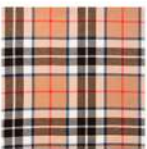
Thomson Camel MOD