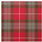
Fraser Red WEA