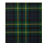
Campbell Of Breadalbane MOD