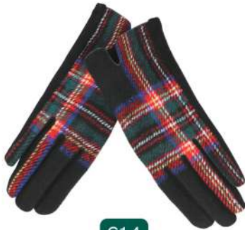
G1.4 BLACK STEWART