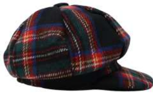
TH1.6 BLACK STEWART