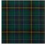
MacInnes Hunting MOD