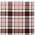
Thomson Grey MOD