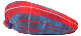
HAMILTON RED MODERN GH2.8