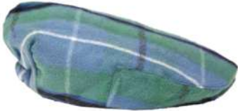
DOUGLAS ANCIENT GH2.5