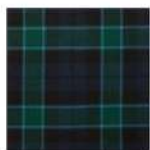
Graham of Menteith MOD