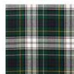
Campbell Dress MOD