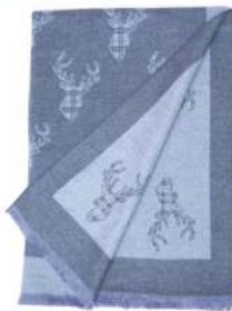
SFST6 DARK GREY/GREY