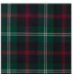
Sutherland Old MOD