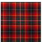
Innes Red MOD