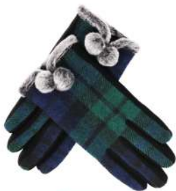
GK1.1 BLACK WATCH