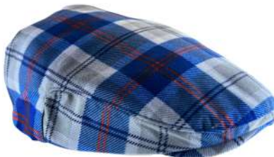
GH1.17 BANNOCKBANE BLUE