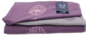
SCA-ALLIUM-LIGHTPURPLE LIGHT PURPLE