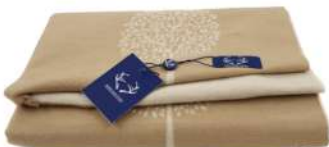
SCA-TREELIFE-LIGHTBEIGE LIGHT BEIGE