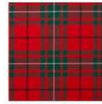
MacAulay Red MOD