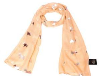
LW-SCOTDOG-FOIL-PINK PINK / SILVER