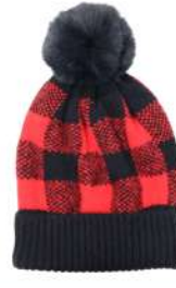
CHK-HAT-BLACK-RED RED & BLACK