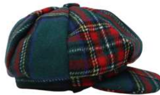
TH1.2 GREEN STEWART