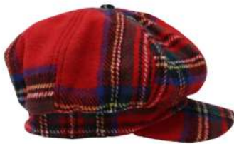
THW2.1 ROYAL STEWART