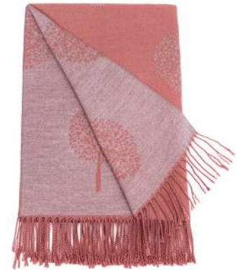
SCA-TASS-TOL-DUSKPINK DUSKY PINK