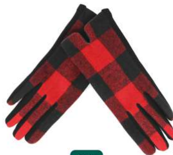
G3.1 ROB ROY RED