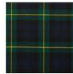
Gordon Clan MOD