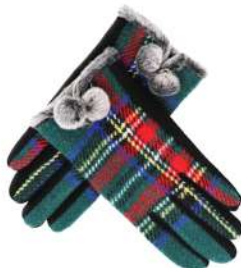
GK1.5 GREEN STEWART