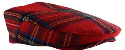
GH1.18 ROYAL STEWART