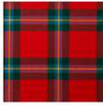
MacLaine Of Lochbuie MOD