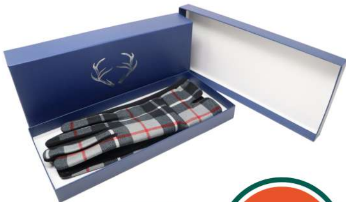
GLOVES BOX 3CM D /27 W /12CM H