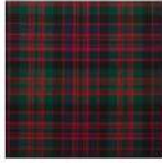
MacDonald Clan MOD