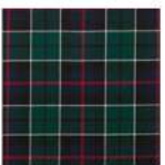
Leslie Green MOD