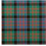
MacDonald Clan ANC