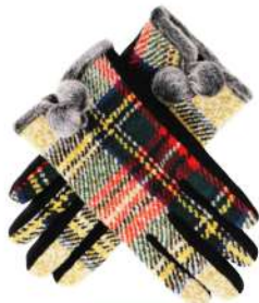
GK1.2 BEIGE STEWART