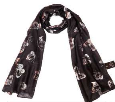
LW-BUTERFLY-FOIL-BLACK BLACK / SILVER