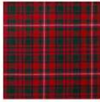
MacKinnon Red MOD