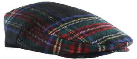
GH1.8 BLACK STEWART