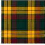
MacMillan Old MOD