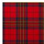
Leslie Red MOD