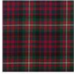
MacDonell Of Glengarry MOD