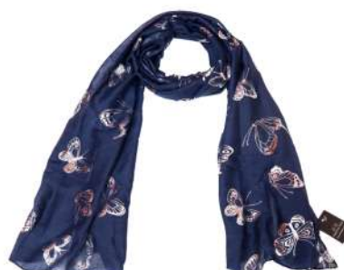
LW-BUTERFLY-FOIL-NAVY NAVY / SILVER