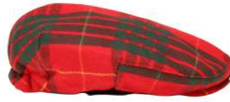
CAMERON MODERN GH2.3