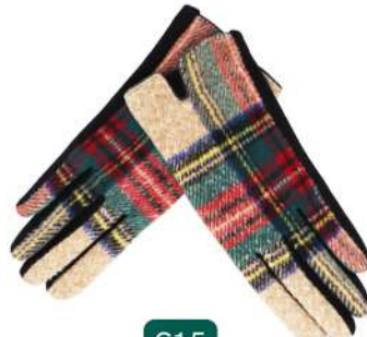
G1.5 BEIGE STEWART