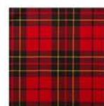
Brodie Red MOD