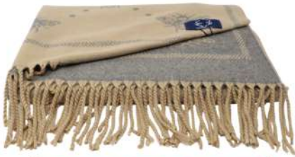
SCA-TASS-BEE-DARK BEIGE DARK BEIGE