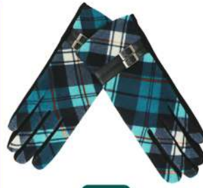
G11.1 LIGHT BLUE