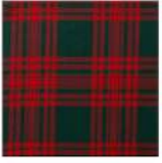
Menzies Green MOD