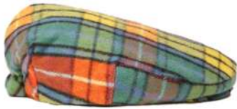
BUCHANAN ANCIENT GH2.1