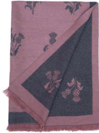
SFT2 DUSK PINK/GREY