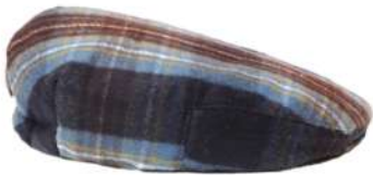
HOLYROOD MODERN GH2.9