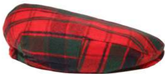
ROBERTSON RED MODERN GH2.13