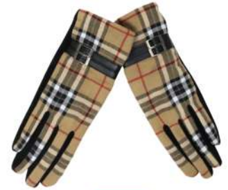
G11.6 CAMEL THOMPSON

QTY/PRICE 3 - £3.30 12 - £3.10 100 - £3.00