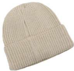
SFT-BNIE-LGHTBEIGE LIGHT BEIGE