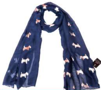
LW-SCOTDOG -FOIL-NAVY NAVY / SILVER