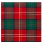
Chisholm Red MOD