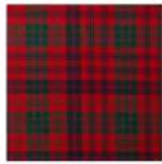
Ross Red MOD