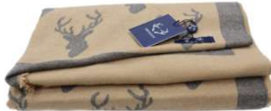
SCA-STAG-DRKBEIGE DARK BEIGE