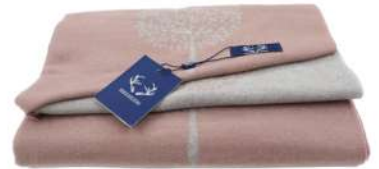
SCA-TREELIFE-DUSKPINK DUSKY PINK