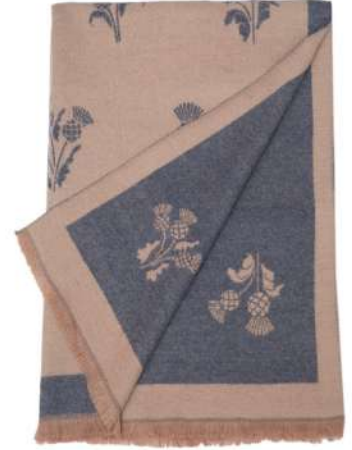
SFT3 DARK BEIGE/BEIGE