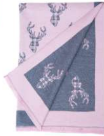
SFST1 DUSKY PINK