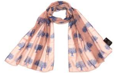
LW-TOL-BEIGEBLUE DARK BEIGE