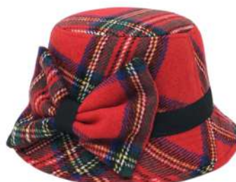
TH2.1 ROYAL STEWART