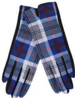
G2.2 BANNOCKBANE BLUE