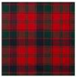
Robertson Red MOD