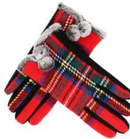
GK1.3 ROYAL STEWART