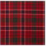
MacRae Red MOD