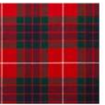
Fraser Red MOD