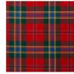
MacLean Of Duart MOD