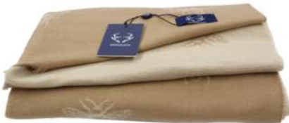
SCA-BEE-DRKBEIGE DARK BEIGE