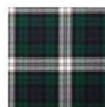
Blackwatch Dress MOD