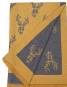
SFST7 OCHRE GREY