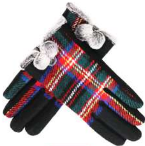
GK1.4 BLACK STEWART