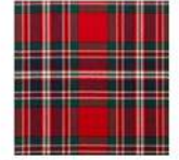
MacFarlane Clan MOD