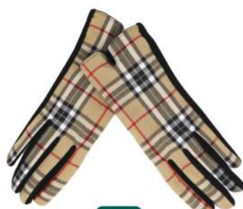
G5.1 CAMEL THOMPSON