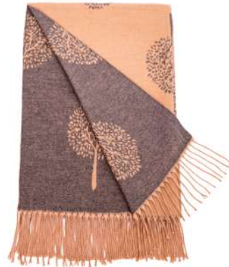
SCA-TASS-TOL-DRKBEIGE DARK BEIGE