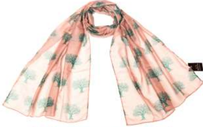
LW-TOL-BEIGEGREEN LIGHT BEIGE