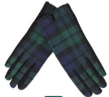
G2.1 BLACK WATCH