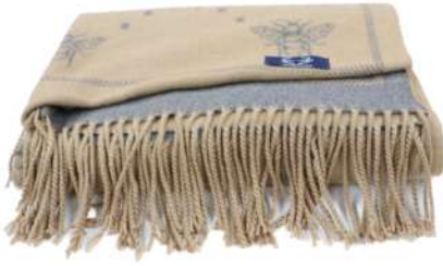
SCA-TASS-BEE-LIGHTBEIGE LIGHT BEIGE