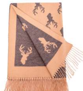
SCA-TASS-STAG-DRKBEIGE DARK BEIGE