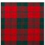
Erskine Red MOD