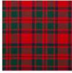
MacIntosh Clan MOD