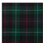
Campbell Of Cawdor MOD