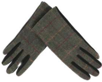
G6.1 OLIVE GREEN