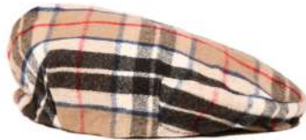
THOMPSON CAMEL MODERN GH2.14