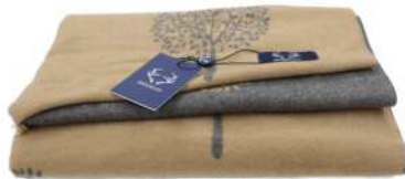
SCA-TREELIFE-DRKBEIGE DARK BEIGE