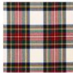
Stewart Dress MOD