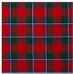
Sinclair Red MOD