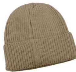
SFT-BNIE-DRKBEIGE DARK BEIGE