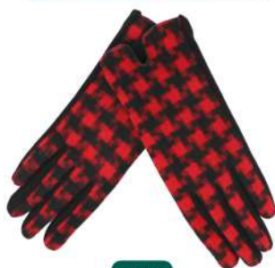
G4.1 HOUNDSTOOTH RED