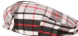
THOMPSON GREY MODERN GH2.15