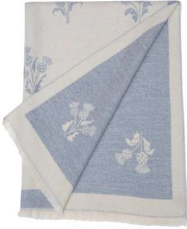
SFT1 LIGHT BEIGE/BEIGE