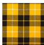
Barclay Dress MOD