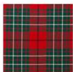
Cumming Clan MOD