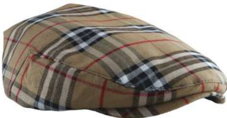
GH1.9 CAMEL THOMSON