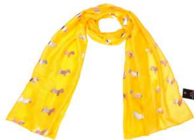
LW-SCOTDOG-FOIL-YELLOW YELLOW / SILVER