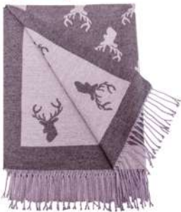
SCA-TASS-STAG-DRKGREY DARK GREY