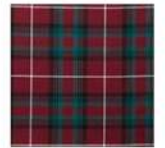
Stuart Of Bute MOD