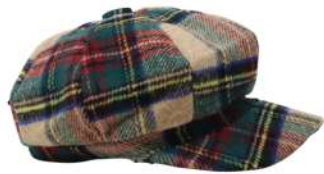
TH1.4 BEIGE STEWART