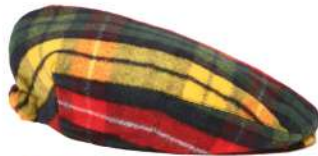
BUCHANAN MODERN GH2.2