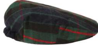
GUNN MODERN GH2.7