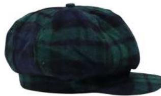
THW2.2 BLACK WATCH