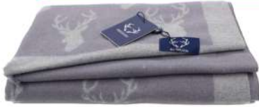
SCA-STAG-DRKGREY DARK GREY