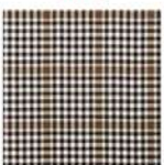
Burns Check MOD