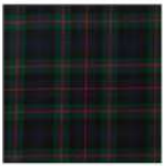
Murray of Atholl MOD