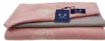
SCA-ALLIUM-LIGHTPINK LIGHT PINK