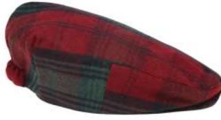
LINDSAY MODERN GH2.10