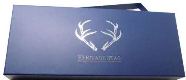
SCARF BOX 5CM D /27 W /12CM H