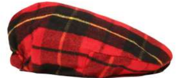
WALLACE MODERN GH2.16