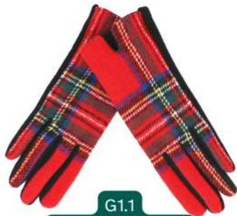
G1.1 ROYAL STEWART