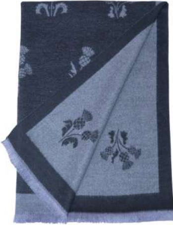
SFT4 LIGHT GREY/GREY