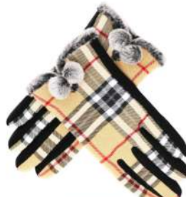
GK1.6 CAMEL THOMPSON

S: 2/4 years old Length: 15 cm - Width: 7 cm M: 5/7 years old Length: 17 cm - Width: 7.5 cm L: 8/10 years old Length: 19 cm - Width: 8 cm XL: 11/13 years old Length: 21 cm - Width: 8 cm