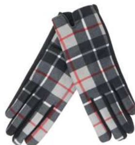
G5.2 GREY THOMPSON

Indulge in timeless elegance with our Ladies Tartan Gloves. Crafted from luxuriously soft materials and adorned with authentic Scottish tartan patterns, these gloves exude sophistication and charm. Embrace warmth, style, and heritage – a must-have accessory for every fashion-forward woman.