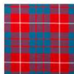
Hamilton Red MOD