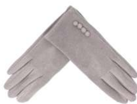
G7.3 LIGHT GREY