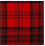
Matheson Red MOD