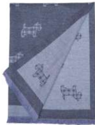
SFTD2 DARK GREY/GREY