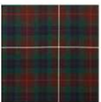
Fraser Hunting MOD