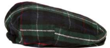
MACKENZIE MODERN GH2.12