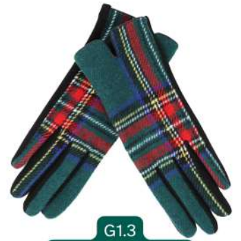
G1.3 GREEN STEWART