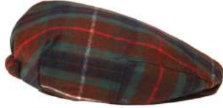
FRASER HUNTING MODERN GH2.6