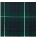
Hamilton Green MOD