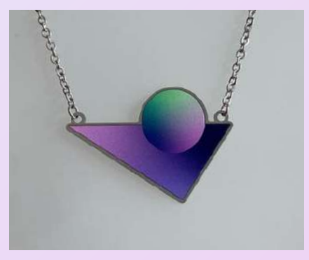
COSMIC TRIANGLE NECKLACE Code: CM-N-B