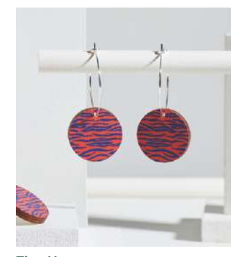
Tina Hoops Code: TIN-H