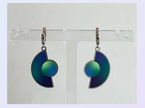
COSMIC MOON EARRINGS Code: CM-E-B