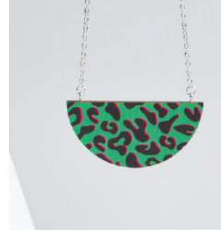
Donna Necklace Code: DON-H-G