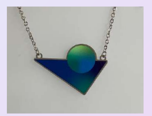
COSMIC TRIANGLE NECKLACE Code: CM-N-B