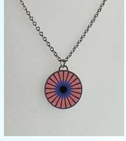
Optical Necklace Peach Code: OP-N-P

Materials: Stainless steel + UV Printed Dimensions: 22mm diameter Price: £15.80 / £38