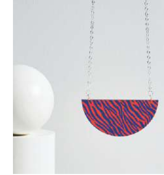
Tina Necklace Code: TIN-H