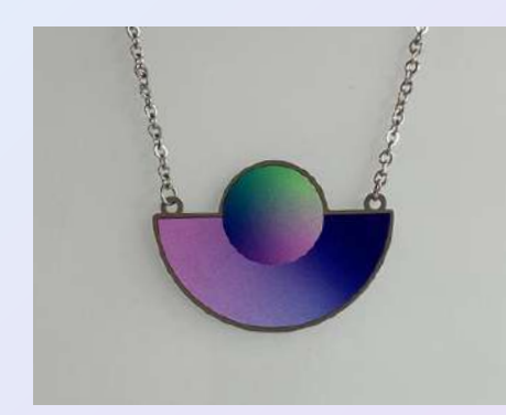
COSMIC MOON NECKLACE Code: CM-N-B