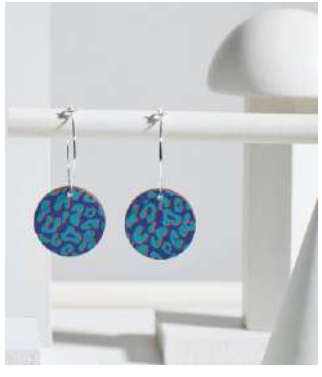
Donna Hoops Code: DON-H-B