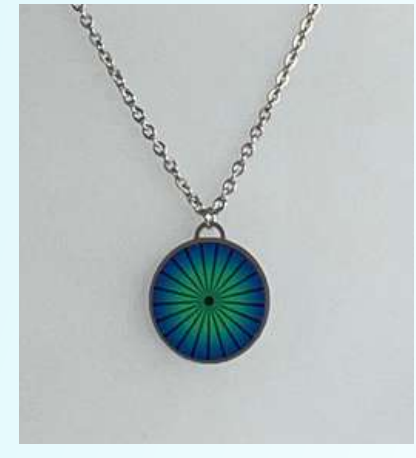
Optical Necklace Green Code: OP-N-G