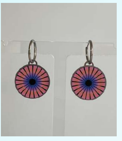
Optical Earrings Peach Code: OP-E-P