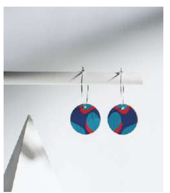
Grace Hoops Code: GRA-H-B