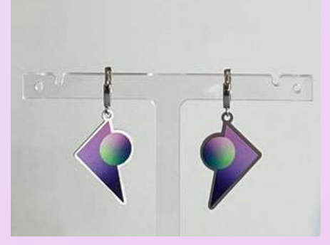
COSMIC TRIANGLE EARRINGS Code: CT-E-P