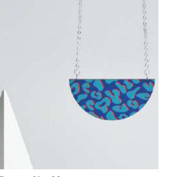
Donna Necklace Code: DON-H-B