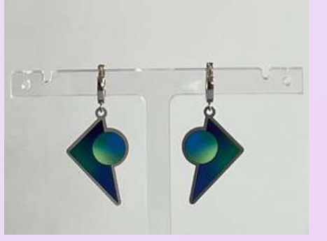
COSMIC TRIANGLE EARRINGS Code: CT-E-B