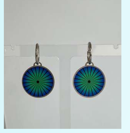
Optical Earrings Green Code: OP-E-G