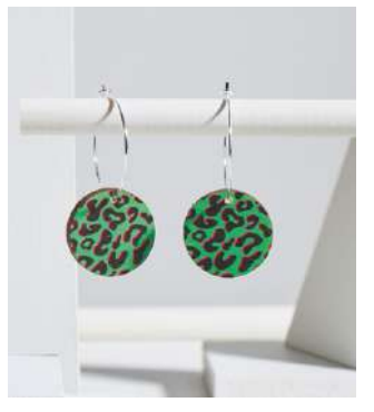
Donna Hoops Code: DON-H-G