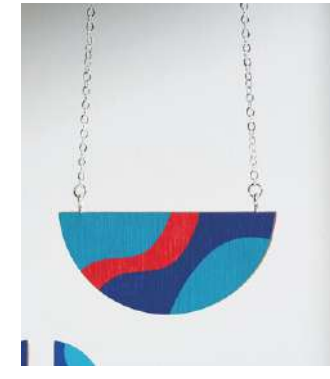
Joni Necklace Code: JON-N