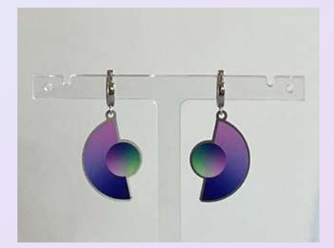
COSMIC MOON EARRINGS Code: CM-E-P