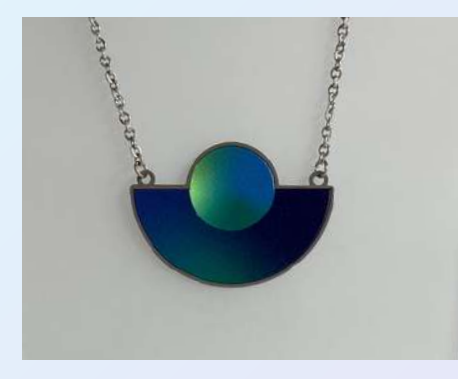
COSMIC MOON NECKLACE Code: CM-N-B