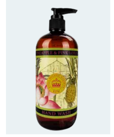
KGL0014 Pineapple & Pink Lotus