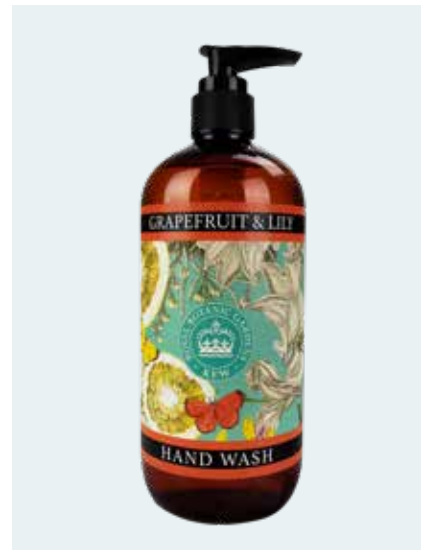
KGL0003 Grapefruit & Lily