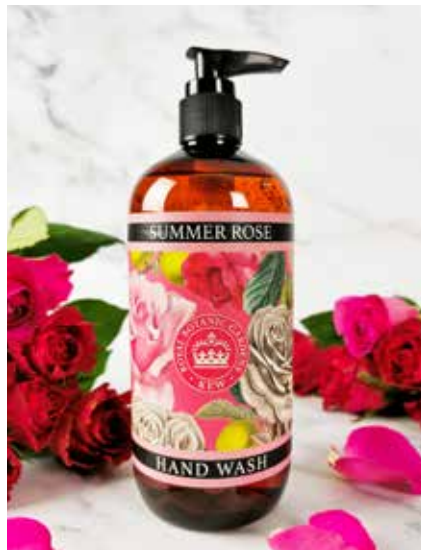
KGL0002 Summer Rose