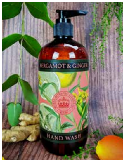
KGL0008 Bergamot & Ginger