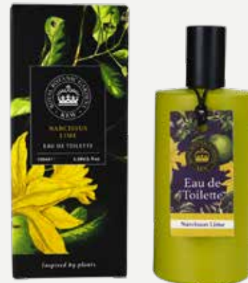
NARCISSUS LIME KGEDT015 | 100ML | #IN CASE: 2