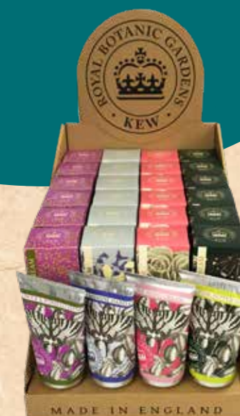
CDU2 HAND CREAM CDU HOLDS 4 CASES

All profits from RBG Kew Enterprises Ltd. go to support Kew's vital work