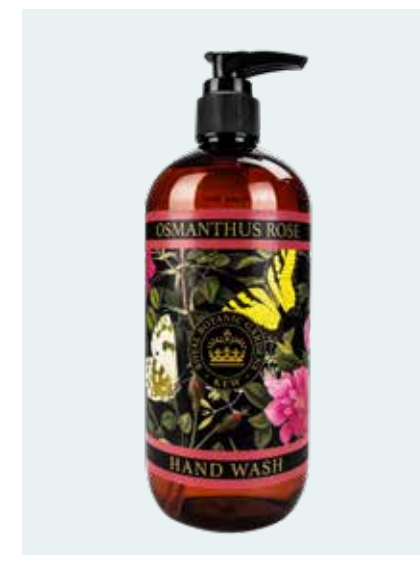
KGL0016 Osmanthus Rose