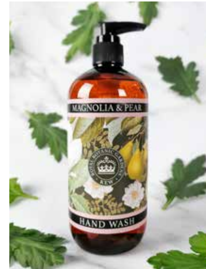
KGL0009 Magnolia & Pear