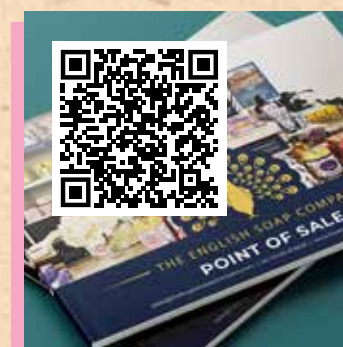
SCAN HERE TO VIEW THE FULL POS BROCHURE