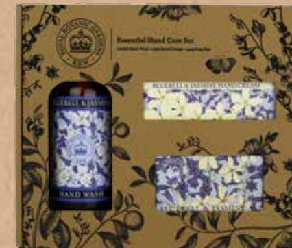
KGLGB007 Bluebell & Jasmine

A zesty blend of citrus combined with the freshness of lemongrass, create a balanced and uplifting fragrance.