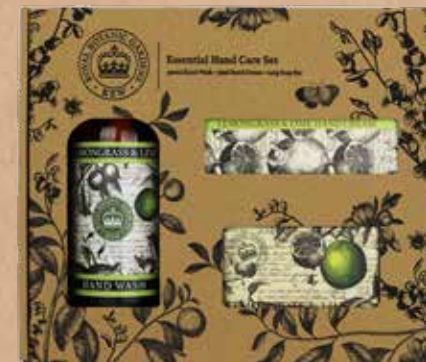
KGLGB004 Lemongrass & Lime

Top notes of lavender and rosemary enhanced with the freshness of mint. A base of hay-dried lavender flowers with vanilla, cedar and musk create this classically aromatic scent.