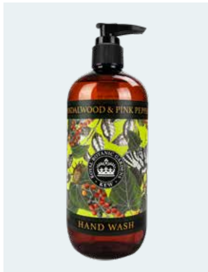
KGL0005 Sandalwood & Pink Pepper