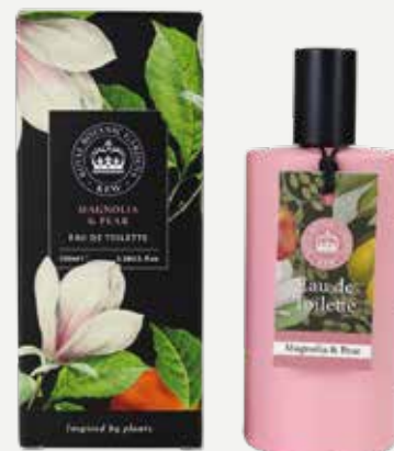
MAGNOLIA & PEAR KGEDT009 | 100ML | #IN CASE: 2