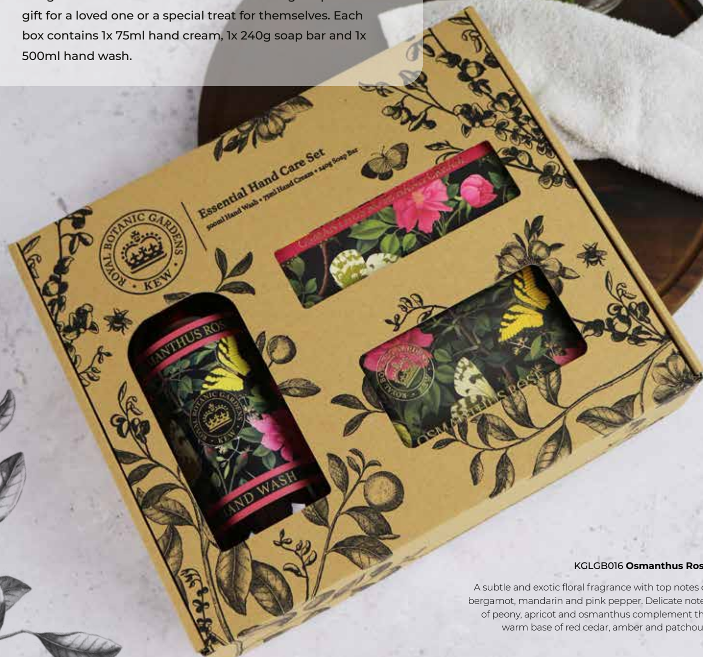
KGLGB016 Osmanthus Rose

Decorated with illustrations from the Library & Archives at the Royal Botanic Gardens, Kew; these giftboxes have been designed with the consumer in mind. Making it a perfect gift for a loved one or a special treat for themselves. Each box contains 1x 75ml hand cream, 1x 240g soap bar and 1x 500ml hand wash.