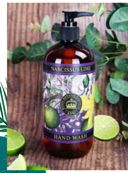
KGL0015 Narcissus Lime