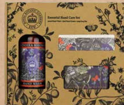
KGLGB001 Lavender & Rosemary

A subtle and exotic floral fragrance with top notes of bergamot, mandarin and pink pepper. Delicate notes of peony, apricot and osmanthus complement the warm base of red cedar, amber and patchouli.