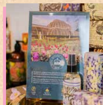
INFORMATION POSTERS A4 (POK02) OR A5 (POK3)

All profits from RBG Kew Enterprises Ltd. go to support Kew's vital work