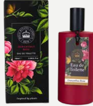
OSMANTHUS ROSE KGEDT016 | 100ML | #IN CASE: 2