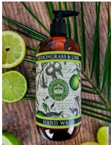
KGL0004 Lemongrass & Lime