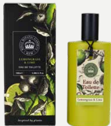
LEMONGRASS & LIME KGEDT004 | 100ML | #IN CASE: 2