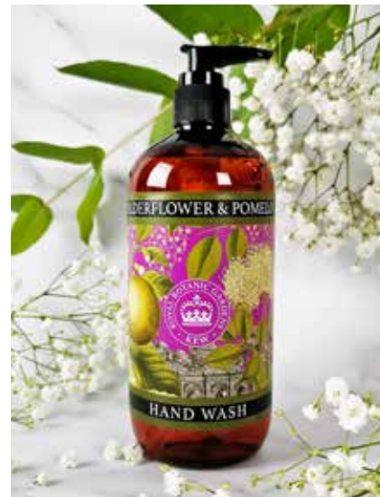
KGL0006 Elderflower & Pomelo