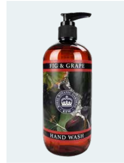
KGL0010 Fig & Grape