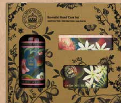
KGLGB017 Jasmine Peach

A floral fragrance with top notes of lime, bergamot and pear. Notes from jasmine, orange blossom, tuberose and narcissus form the heart of the scent and come together on a base of vanilla and sandalwood.