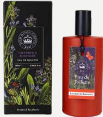
LAVENDER & ROSEMARY KGEDT001 | 100ML | #IN CASE: 2