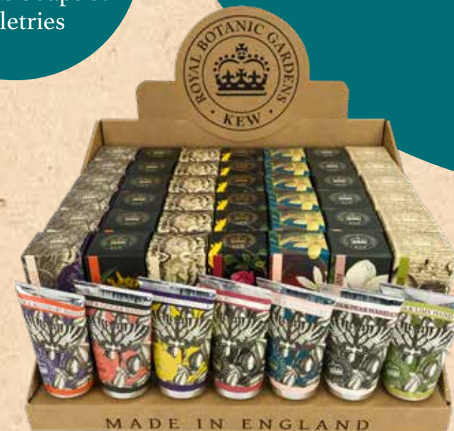
CDU1 HAND CREAM CDU HOLDS 7 CASES

All of our perfumes are made in England by expert perfumers and have been designed specifically for our products.