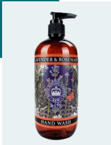
KGL0001 Lavender & Rosemary