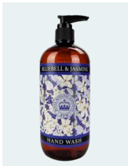
KGL0007 Bluebell & Jasmine