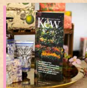
TRIANGLE TENT CARD 3 SIDED TENT CARD (POK01)