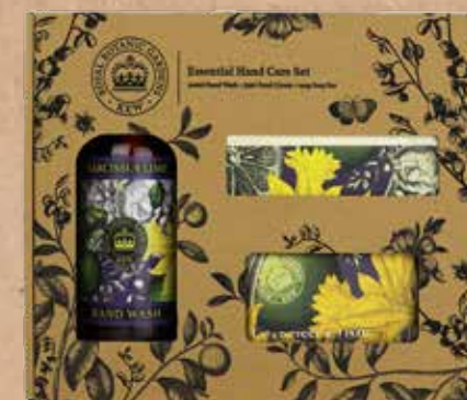
KGLGB015 Narcissus Lime

Top notes of magnolia and pear combine with a heart of orchid, freesia, rose and lily and a musk base of amber and patchouli to create this evocative scent.