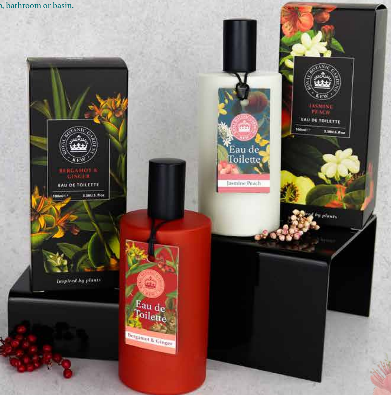
BERGAMOT & GINGER KGEDT008 | 100ML | #IN CASE: 2

With a fresh new, beautifully decorated box adorned with illustrations and paintings from Kew's historical archives. The Royal Botanic Gardens, Kew Body Oils and Eaux De Toilettes will not only ensure you smell and feel luxurious, but they create a striking and vibrant display in any shop, bathroom or basin.