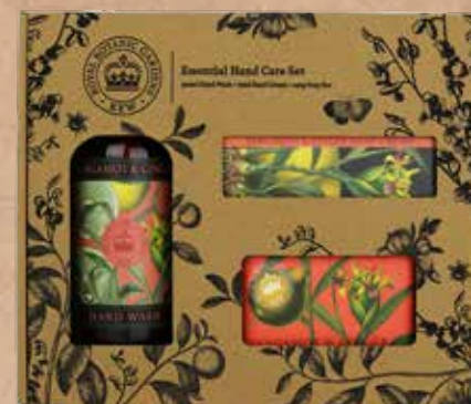
KGLGB008 Bergamot & Ginger

A meadow fresh fragrance with notes of bluebell, jasmine and green grass. Hyacinth, peony and rosemary complement a soft base of moss and vanilla to create this delicate fragrance.