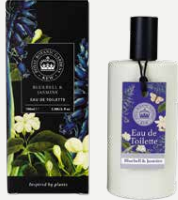
BLUEBELL & JASMINE KGEDT007 | 100ML | #IN CASE: 2