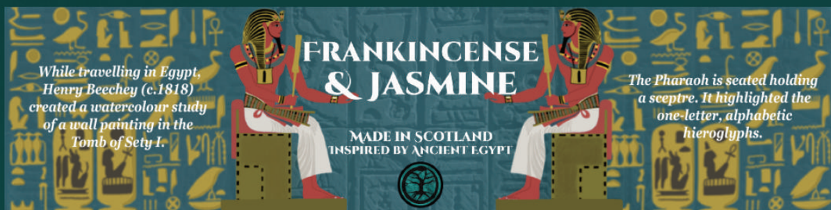
Example of our 85g Pharaoh label for The British Museum's 'Egyptian Hieroglyphics' exhibition.

If not, we also offer a bespoke design service for labels. Tell us your preferences, if you want certain motifs or landscapes encapsulated into your label, and we'll design something truly unique. If you have brand guidelines, we'll work within them to make your candles into something distinctly you . Chat to us more if you want our design services!