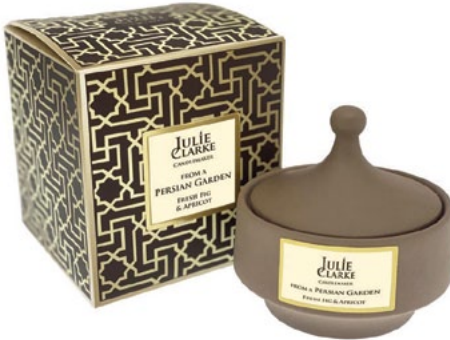
107-09 CANDLE FROM A PERSIAN GARDEN Fresh Fig & Apricot