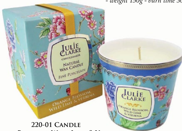
220-01 CANDLE ORANGE BLOSSOM, WILD LIME & VERBENA

Fresh and sweet Citrus top notes, a cleansing heart of Verbena, with a warm sweet base of Musk and Amber.