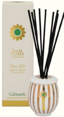
238-23 DIFFUSER jasmine & lime blossom