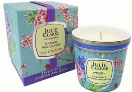
220-03 CANDLE LAVENDER & GARDEN ANGELICA Relaxing notes of soothing Lavender around a heart of healing Angelica from the herb garden.