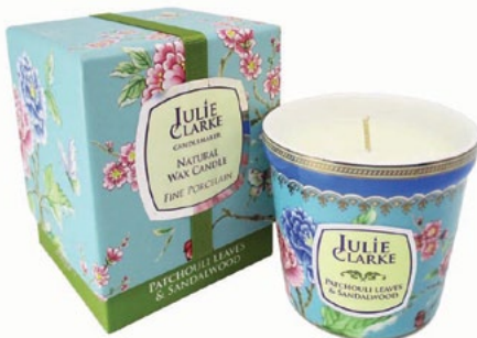
220-08 CANDLE PATCHOULI LEAVES & SANDALWOOD The earthy notes of Indian Patchouli are combined with woody notes of oriental Sandalwood.