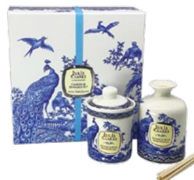
210211-02 CANDLE & DIFFUSER SET