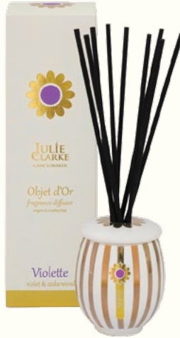
238-21 DIFFUSER violet & cedarwood