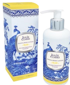
902-11 MALABAR LEMONGRASS & GINGER HAND & BODY LOTION