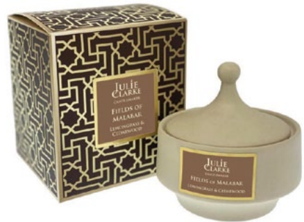
108-11 CANDLE FIELDS OF MALABAR Lemongrass & Cedarwood