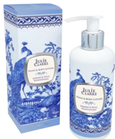
902-02 JASMINE & WILD HONEYSUCKLE HAND & BODY LOTION

These superfruit hand & body lotions are formulated with moisturising botanicals and a superfruit blend that slows down the loss of water from the skin. Organic jojoba and antioxidant cranberry seed oils help to repair your skin cells by forming a barrier on the surface, leaving your skin velvety soft.