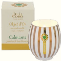
237-23 CANDLE jasmine & lime blossom

The refreshing and exhilarating top notes of lime blossom are complemented by an intense jasmine heart note, one of the foundation stones of fragrances.