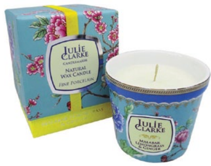
220-11 CANDLE MALABAR LEMONGRASS & GINGER Tangy Lemongrass blended with spicy Ginger creates an invigorating, zesty and spicy scent to lift your mood.