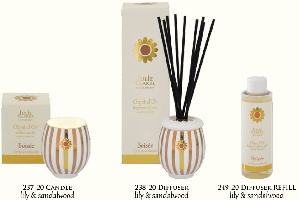
237-20 CANDLE lily & sandalwood

Infused with top notes of coconut, this classic woody fragrance adds richness, depth & elegance, with base notes of creamy, sensual sandalwood and heart notes of musky patchouli and intoxicating lily.