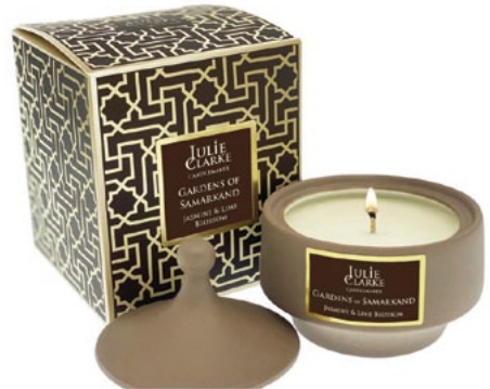
107-02 CANDLE GARDENS OF SAMARKAND Jasmine & Lime Blossom