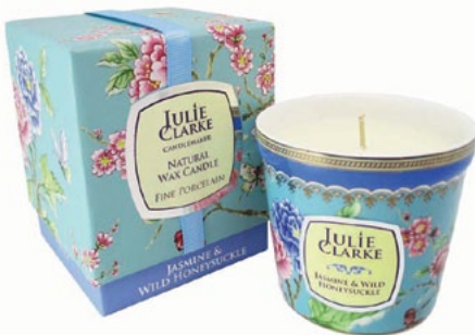
220-02 CANDLE JASMINE & WILD HONEYSUCKLE The sweet and fruity top notes of Honeysuckle are complimented by intense Jasmine heart notes.

Fresh and sweet Citrus top notes, a cleansing heart of Verbena, with a warm sweet base of Musk and Amber.