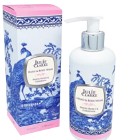
901-04 WHITE ROSES & GARDENIA HAND & BODY WASH