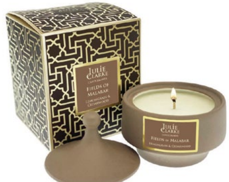
107-11 CANDLE FIELDS OF MALABAR Lemongrass & Cedarwood