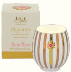
237-25 CANDLE pink pepper & rose

A fresh, revitalising, woody & spicy fragrance with top notes of pink pepper, leading to a heart of rose and geranium florals, and a base of warm, sweet amber.