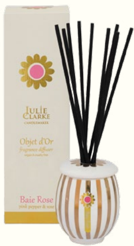
238-25 DIFFUSER pink pepper & rose