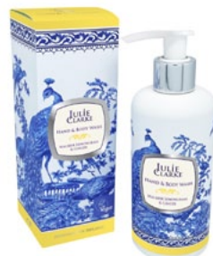
901-11 MALABAR LEMONGRASS & GINGER HAND & BODY WASH