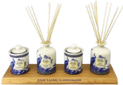
WOODEN PLINTH FOR TESTERS