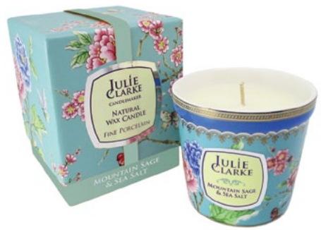
220-13 CANDLE MOUNTAIN SAGE & SEA SALT A warm sophisticated fragrance with top notes of Sage and an invigorating heart of Ocean fragrances.