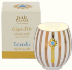
237-24 CANDLE sage & sea salt

A warm, sophisticated fragrance with top notes of sage and hints of bergamot leading to an invigorating heart of fresh ocean fragrances, smoothed by shades of musk and guaiac wood.