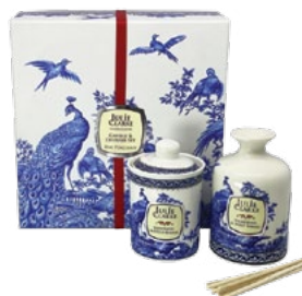
210211-07 CANDLE & DIFFUSER SET