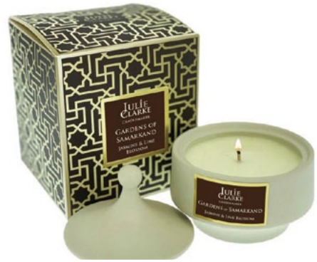
108-02 CANDLE GARDENS OF SAMARKAND Jasmine & Lime Blossom