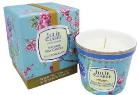
220-09 CANDLE WILD FIG, VANILLA & BLACKCURRANTS Fruity scented top notes of tangy Blackcurrant, a Mediterranean heart of milky sweet Fig and a sweet base of Vanilla.