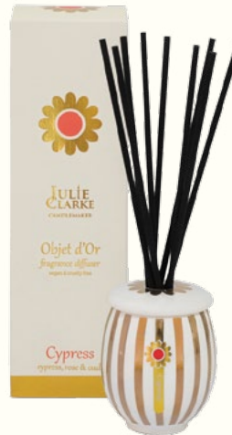
238-22 DIFFUSER cypress, rose & oud