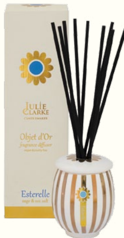
238-24 DIFFUSER sage & sea salt