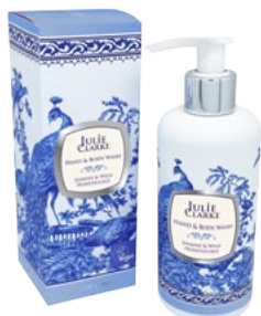
901-02 JASMINE & WILD HONEYSUCKLE HAND & BODY WASH

These superfruit body washes gently cleanse your skin with moisturising botanicals, organic jojoba oil and glycerin. The natural emollients provide lipid relief to smooth and hydrate your skin. They are enriched with an antioxidant superfruit blend delivering vital nutrients, while supporting the skin's surface barrier.