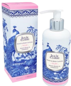
902-04 WHITE ROSES & GARDENIA HAND & BODY LOTION