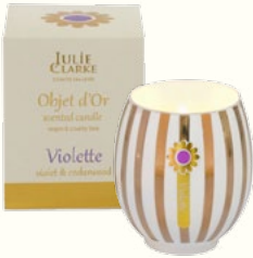
237-21 CANDLE violet & cedarwood

With warm, aromatic top notes of fresh spice, this musky fragrance is softened by heart notes of romantic violet, a very feminine scent, and intense, woody base notes of cedarwood.