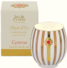
237-22 CANDLE cypress, rose & oud

A zesty burst of refreshing grapefruit dominates the top notes of Cypress, with the rich intensity of jasmine & rose at its heart, mixed with the warm sweetness and woody base notes of oud.