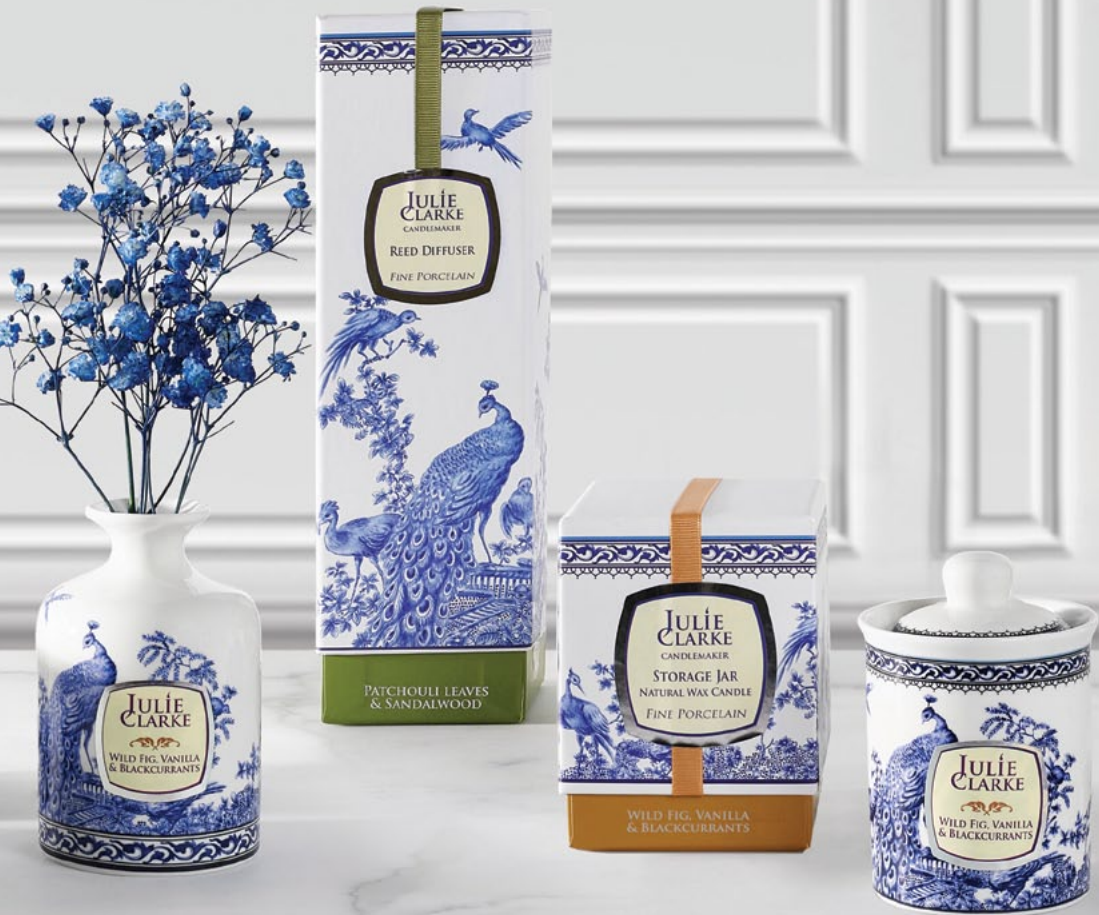
BLUE PEACOCK COLLECTION