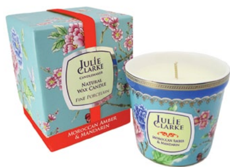
220-14 CANDLE MOROCCAN AMBER & MANDARIN A rich sultry fragrance with warm Moroccan Amber enriched with fresh Mandarin and touches of Cassis.