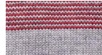
Smoke / Cassat - CJ1211