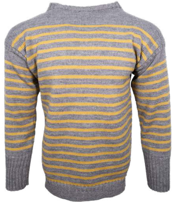
Puffin Smoke / Summer Storm CJ1412

Base Code: CJ14 Available in Sizes 34-54