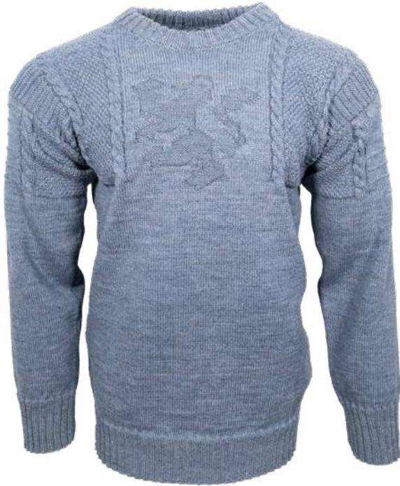
Alderney Kielder CJ1021