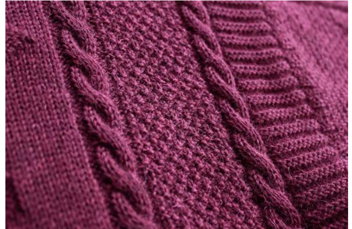
Alderney Emblem and Detailing