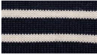
Navy / Aran - CJ1425