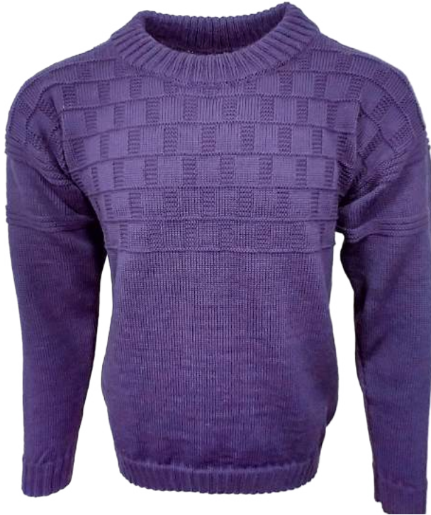
Cobbles Heather CJ0805