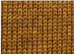
Harvest - CJ0115