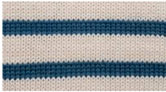
Aran / Kingfisher - CJ1401