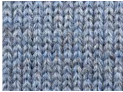
Kielder - CJ0131