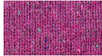
Pink - CJ1712