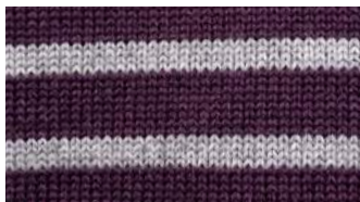
Foxglove / Smoke - CJ1409