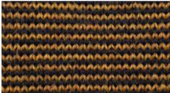
Harvest / Navy - CJ1305