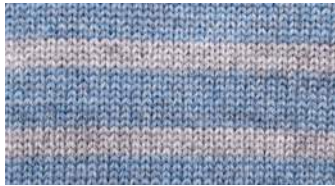
Kielder / Smoke - CJ1403