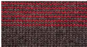
Dark Grey Natural / Cassat - CJ1215

Base Code: CJ12 Available in Sizes 34-50