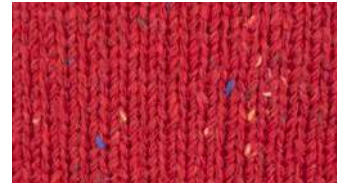
Red - CJ1726