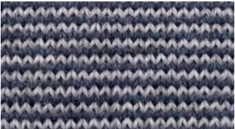
Smoke / Denim - CJ1307

Base Code: CJ13 Available in Sizes 34-50