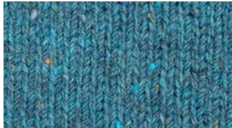
Turquoise - CJ1718