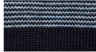
Navy / Summer Storm - CJ1207