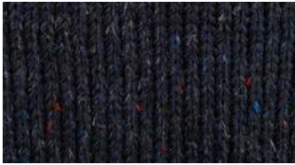
Navy Blue - CJ1702