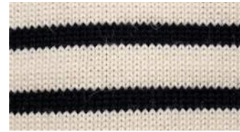
Aran / Dark Navy - CJ1402