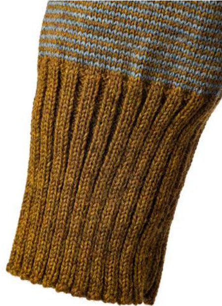
Detailing on Shoulders and Cuffs