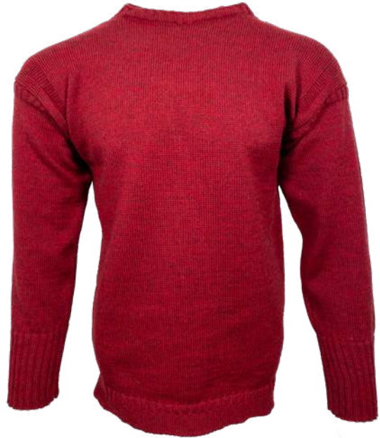
Burhou Cassat CJ0126