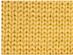
Sunflower - CJ0128