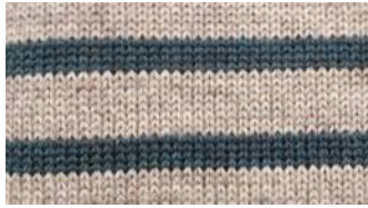
Oatmeal / Mallard - CJ1406