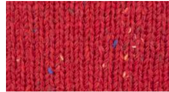
Red - CJ1726