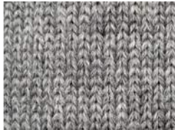
Smoke - CJ0129