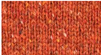
Orange - CJ1710

Base Code: CJ19 Available in Sizes XS-XXL