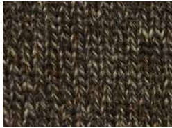
Derby Tweed - CJ0103