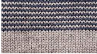
Oatmeal / Denim - CJ1214