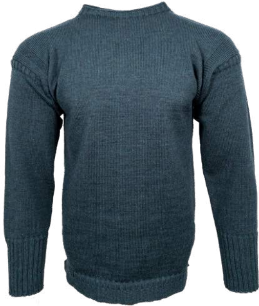
Burhou Mallard CJ0120