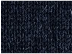
Dark Navy - CJ0102