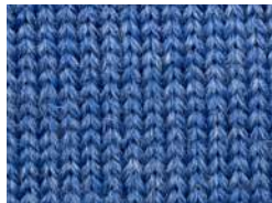
Indigo - CJ0127

Base Code: CJ01 Available in Sizes 34-56