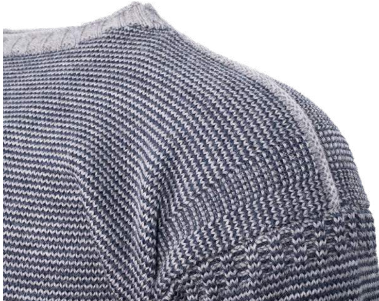
Detailing on Shoulders and Collar