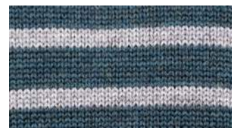
Mallard / Smoke - CJ1410