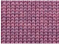
Lupin - CJ0112