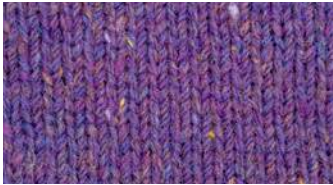
Purple - CJ1707