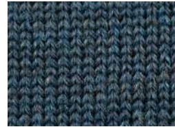
Mallard - CJ0120