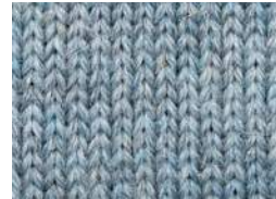
Summer Storm - CJ0119