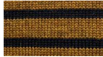
Harvest / Navy - CJ1408