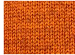
Burnt Orange - CJ0110