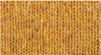
Yellow - CJ1728