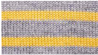
Smoke / Sunflower - CJ1411