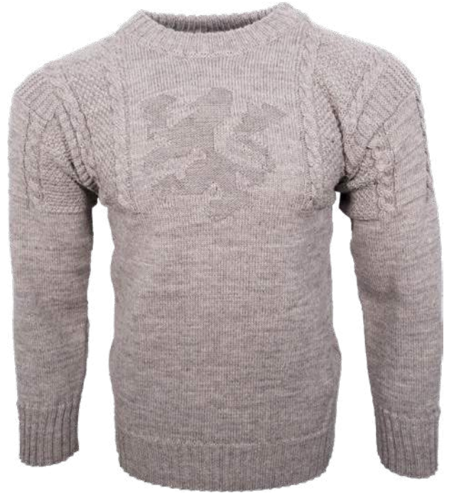
Alderney Oatmeal CJ1021