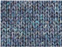
Denim - CJ0109