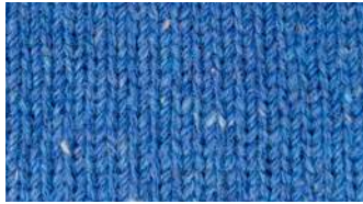
Ocean Blue - CJ1727