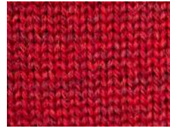
Cassat - CJ0126