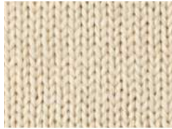
Aran - CJ0100