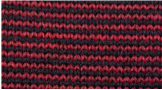
Navy / Cassat - CJ1302