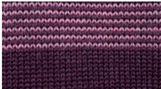
Foxglove / Lupin - CJ1209