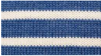
Indigo / Aran - CJ1426