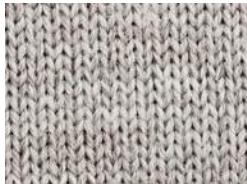
Oatmeal - CJ0114