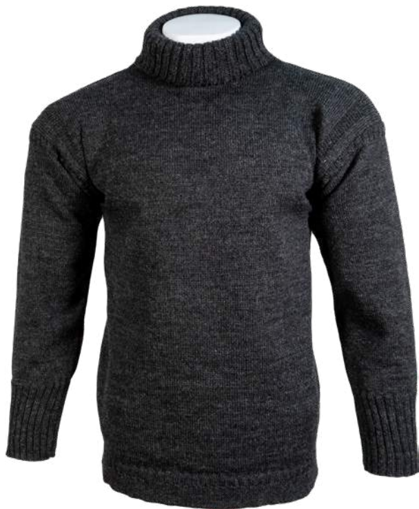
Gannet Charcoal CJ0230