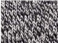
Humbug - CJ0116