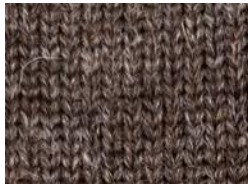
Dark Grey Natural - CJ0132