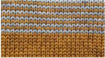
Harvest / Summer Storm - CJ1201