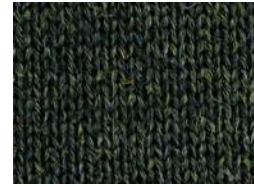
Loden Green - CJ0123