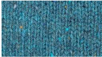
Turquoise - CJ1718