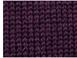
Foxglove - CJ0125