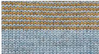
Summer Storm / Harvest - CJ1205