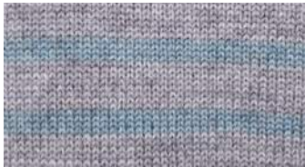
Smoke / Summer Storm - CJ1412

Base Code: CJ14 Available in Sizes 34-54